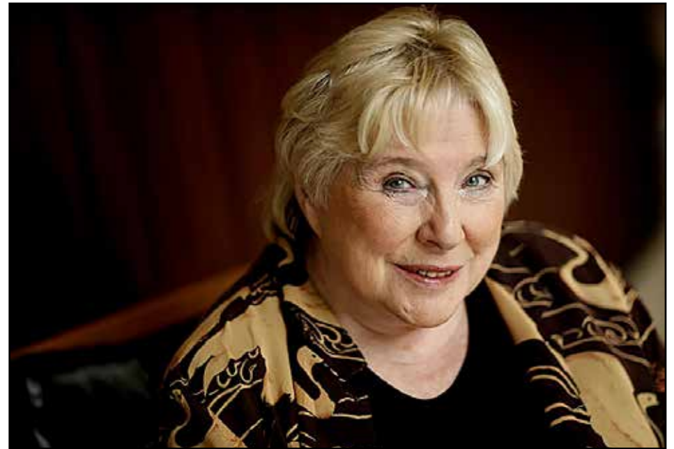
"formidable, fierce and wonderful": Fay Weldon was 91

"It's a complicated process, getting diagnosed, but I found lots of kindness along the way. I'm very, very, very pleased to have done it, and I'm very, very, very pleased to know this about myself."