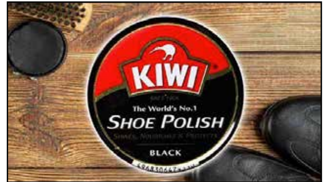
ICON: but casual shoes have polished off the brand party, having shiny, clean That need will never shoes gives confidence. disappear.”