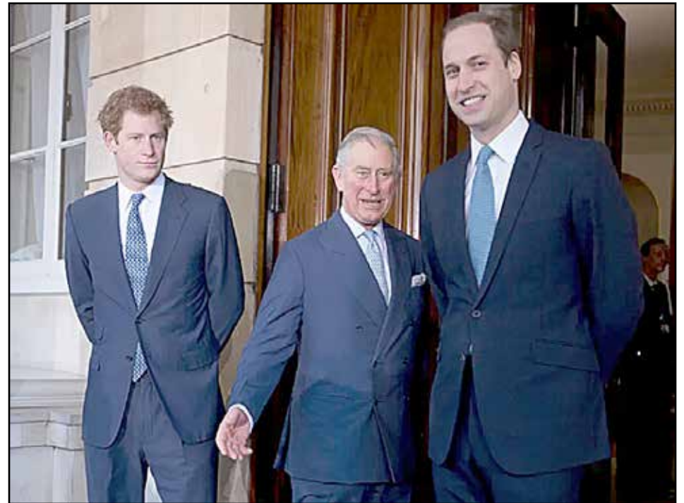
SO WHO'S TELLING PORKIES? one of them, clearly

And while speaking to US broadcaster Anderson Cooper for his CBS programme, 60 Minutes, Harry was asked why he had not communicated his complaints in private rather than going public. The Prince replied: "Every single time I've tried to do it privately, there have been briefings