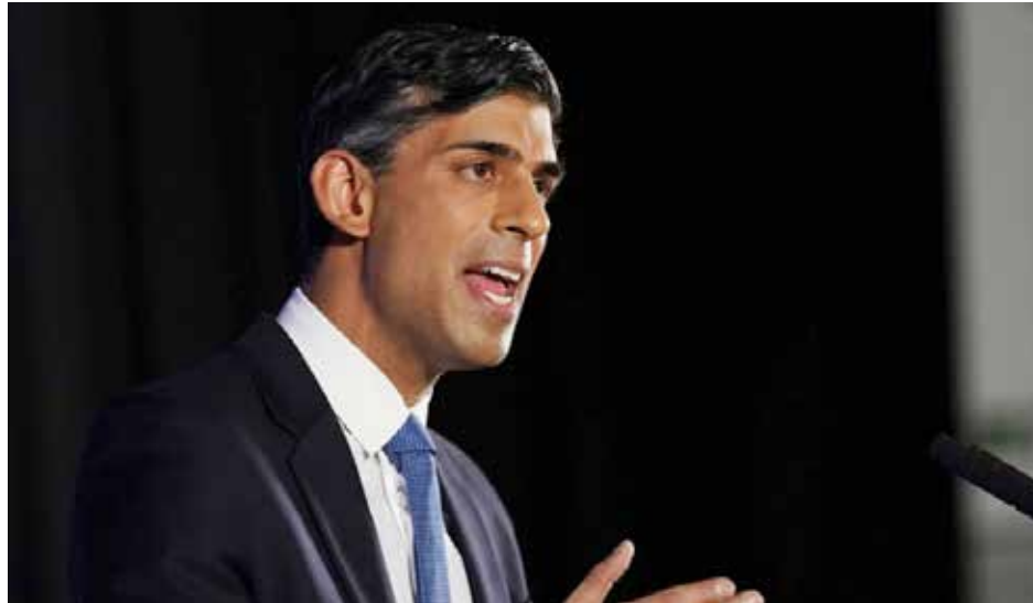
SUNAK: "I fully expect the country to hold me and the Government to account"

after the Prime Minister was given a glimmer of hope in a new poll that found that he has leapfrogged Keir Starmer as the public's preferred leader.