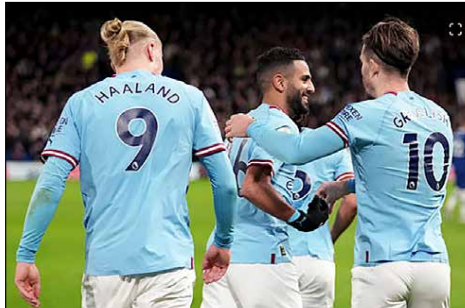
TOP MAN: Jack Grealish congratulates Mahrez after his winner for City

Potter's plight was illustrated when he sent on 19-year-old Chukwuemeka for Pulisic and he was joined by young trio Conor Gallagher, Lewis Hall and Omari Hutchinson