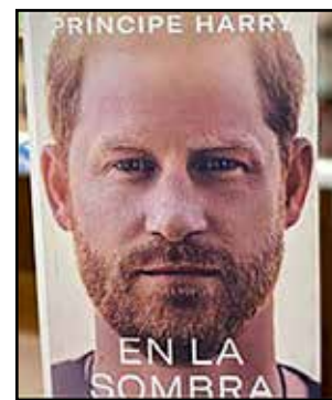
LEAK: the excerpts were revealed in an early copy of the Spanish version of Harry's book

Harry's account of a conversation he says he had with his late mother