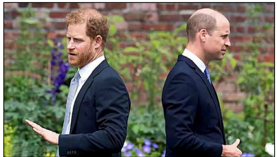
TURNING HIS BACK? Harry claimed this week that he 'wanted his brother back', but the contents of his autobiography seem to make that prospect remote

Harry writes that he and William begged their father not to marry Camilla, now Queen Consort, over fears she would be their 'wicked stepmother'. Harry alleges that he pondered whether she would one