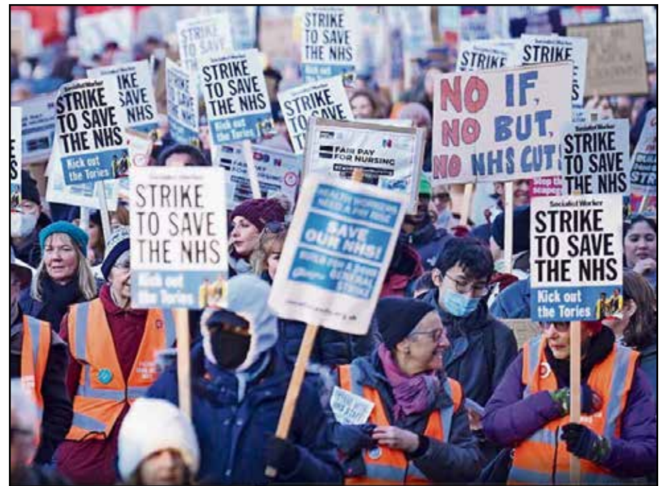
No end in sight: Thousands of nurses walked out on Wednesday and Thursday