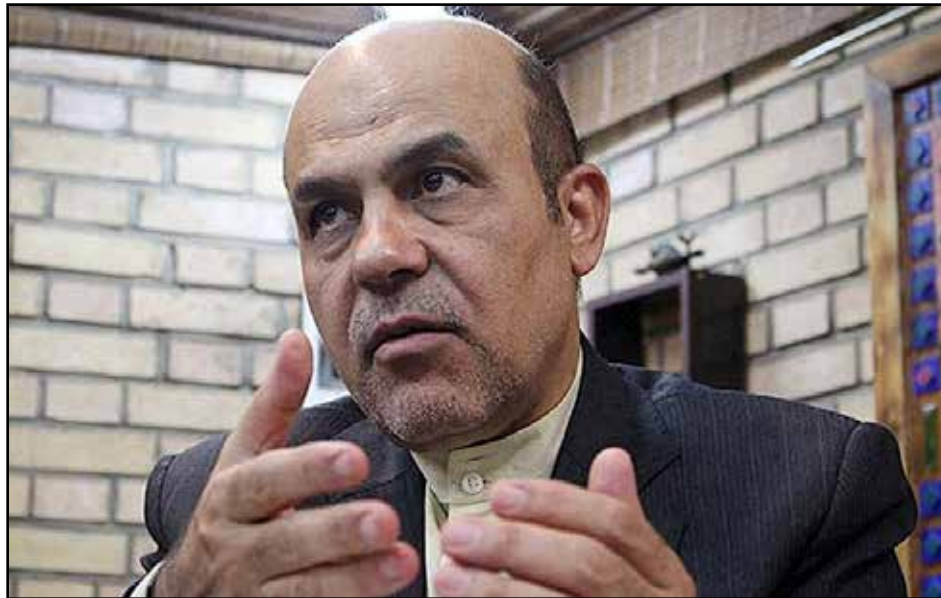
Alireza Akbari was hung on Sunday in Tehran