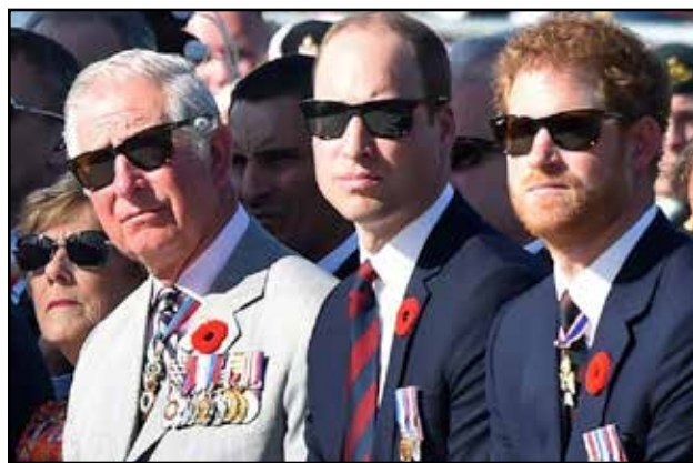
Hope springs eternal...at least for Charles

The King, who on Sunday attended a service at Crathie Kirk, near Balmoral, with his wife Camilla, is desperate for his day to be a national and global celebration and not