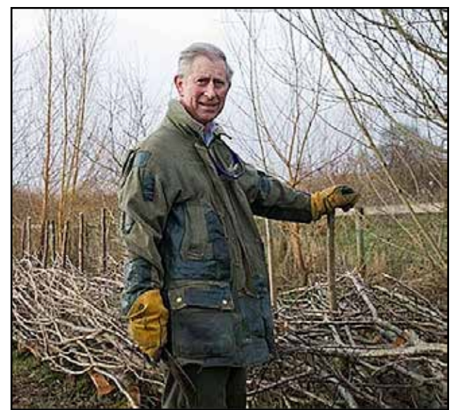
NO SMALL NUMBER: Charles has forgone a £250m profit on his Crown Estate energy project

A Buckingham Palace spokeswoman said: "In view of the offshore energy windfall, the Keeper of the Privy Purse has written to the Prime Minister and Chancellor to share the King's wish that this windfall be directed for wider public good, rather than to the Sovereign Grant, through an appropriate reduction