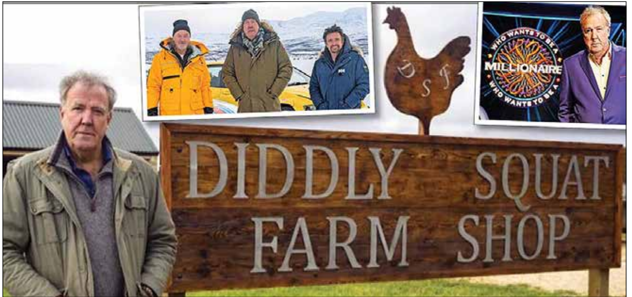
Clarkson earns about £10m annually from Clarkson's Farm, the Grand Tour and Who Wants to Be a Millionaire

JEREMY Clarkson is facing being "cancelled" by the TV industry amid the continuing fallout from his attack on the Duchess of Sussex.