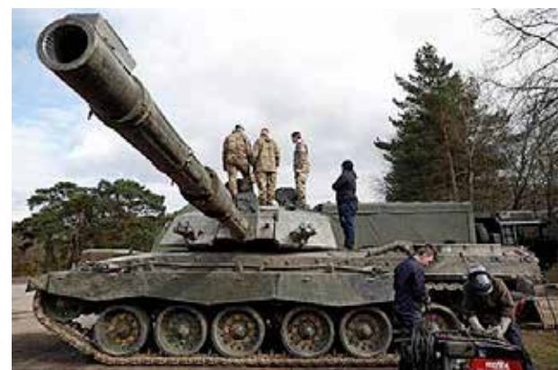
BIG GUNS: the Challenger 2 tank

announcement, adding: "Bringing tanks to the conflict zone, far from drawing the hostilities to a close, will only serve to intensify combat operations, generating more casualties, including among the civilian population."