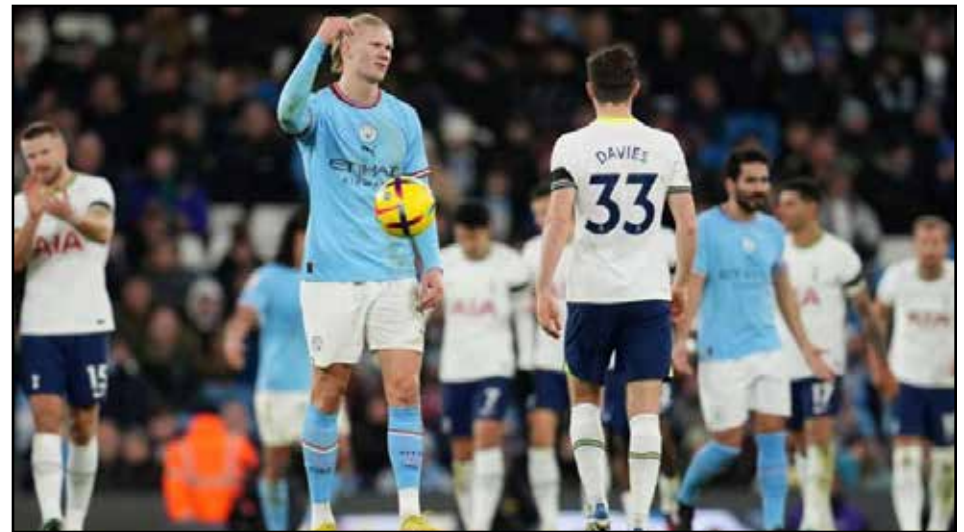
NORMAL SERVICE RESUMED: for City...and Spurs

Manchester City left the pitch at half-time with heads bowed and their jeering supporters frustrated, mainly by