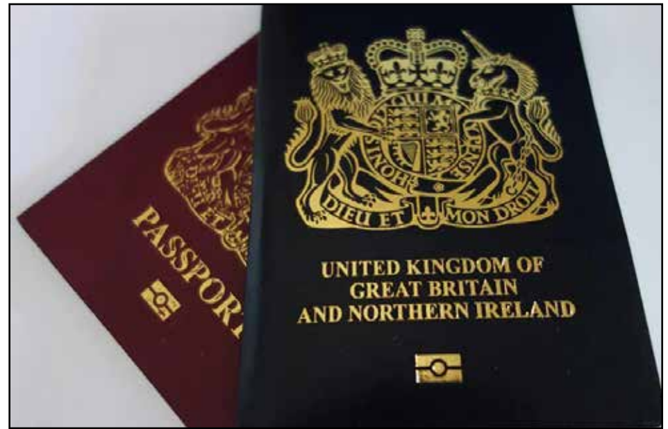
Prices going up too! Expect to pay more for your passport renewal

Talking of which, a proposal has been submitted to change several of the filing fees that fund the U.S Citizenship and Immigration Services. A few are going down (including Green Card renewals and replacements), but a lot are going to get a hefty increase if this gets approved - if you are a conditional resident with a two-year Green Card you will be paying an extra $515 (currently $680) to get the conditions removed.