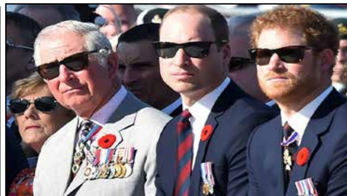
Charles 'will seek reconciliation' - page 3