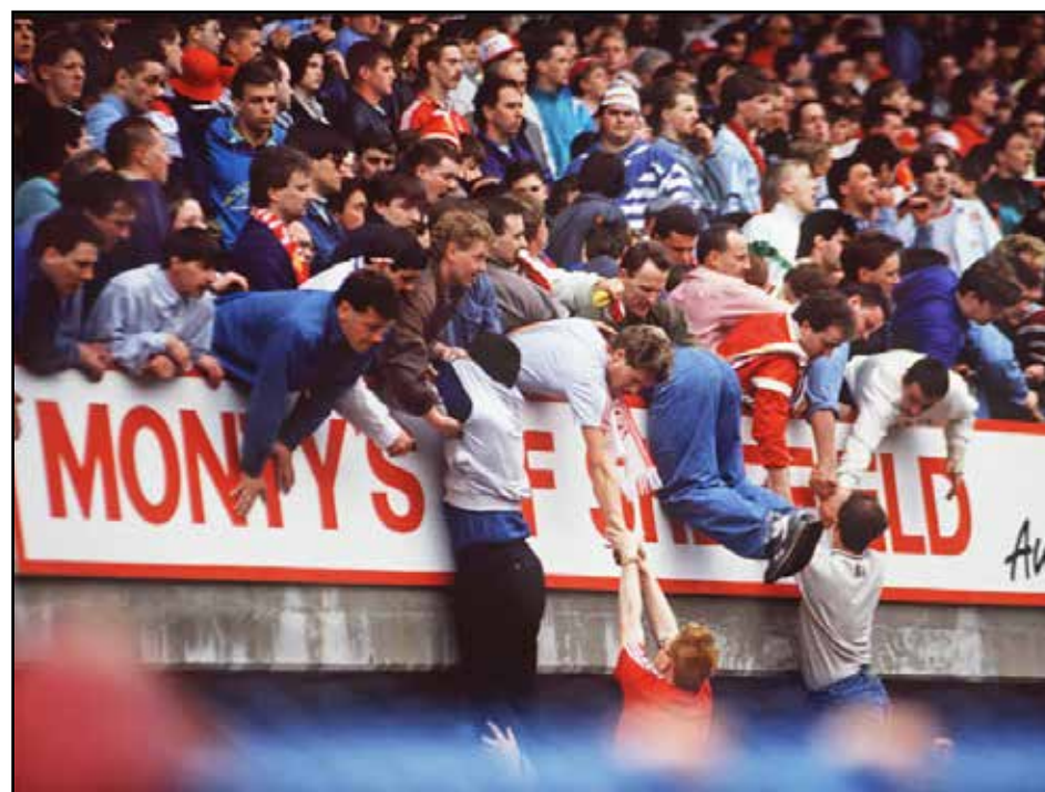
LONG SLOG FOR JUSTICE: Ninety-seven Liverpool fans died after a crush at the Sheffield stadium on April 15, 1989