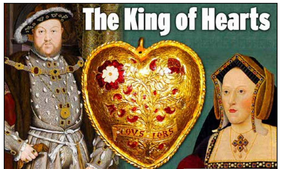
LOVE'S LABOUR'S LOST: the pendant marking Henry's marriage to Katherine of Aragon was found in a muddy field

On the reverse, the initials H and K are engraved and ribbon motifs carry the legend TOVS and IORS, an early "Franglais" pun on the word "toujours" and "all yours". Experts are reluctant to put a price on the 300g find – which is cast in 24-carat gold – before an official valuation. But it is unlikely to be more than £1million.