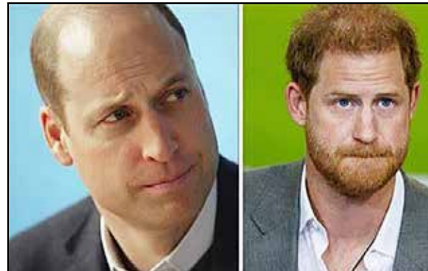
A HOUSE DIVIDED: the brothers remain at odds

Since the Duke of Sussex began his campaign to tell what he considers his side