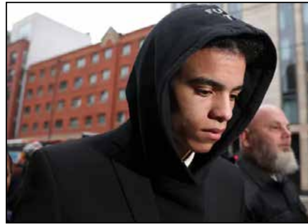
The Manchester United footballer, 21, was charged with attempted rape offence last year

Greenwood, one of the most promising English strikers of his generation, is not expected to return immediately to the Manchester