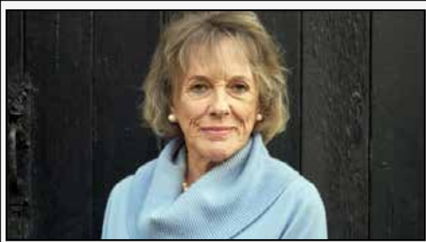
Dame Esther: "I am remaining optimistic."