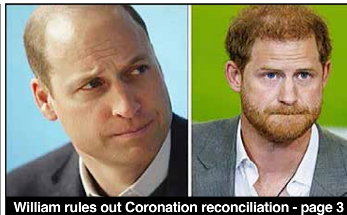
William rules out Coronation reconciliation - page 3