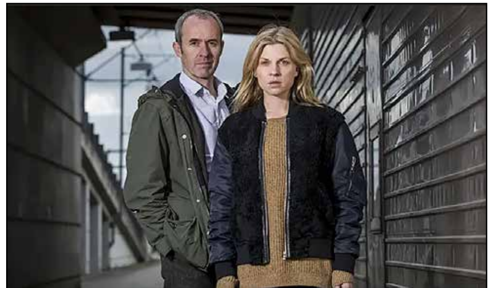
VIVE LA DIFFERENCE: Stephen Dillane and Clémence Poésy star as British and French detectives forced to work together in "The Tunnel"

It's not just the acting that's stunning. There's the backdrop too - on either side of the Channel. The Kent coast looks delightful, while Calais, that perennially passed-