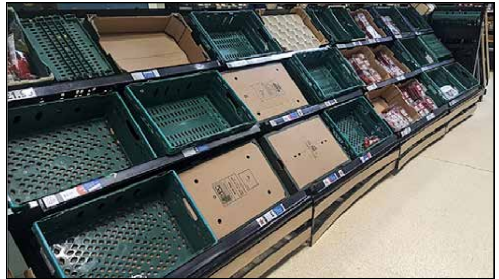
SIGN OF THE TIMES: empty vegetable bins at a London Tesco this week

It said the limits applied both to loose fruit and vegetables and