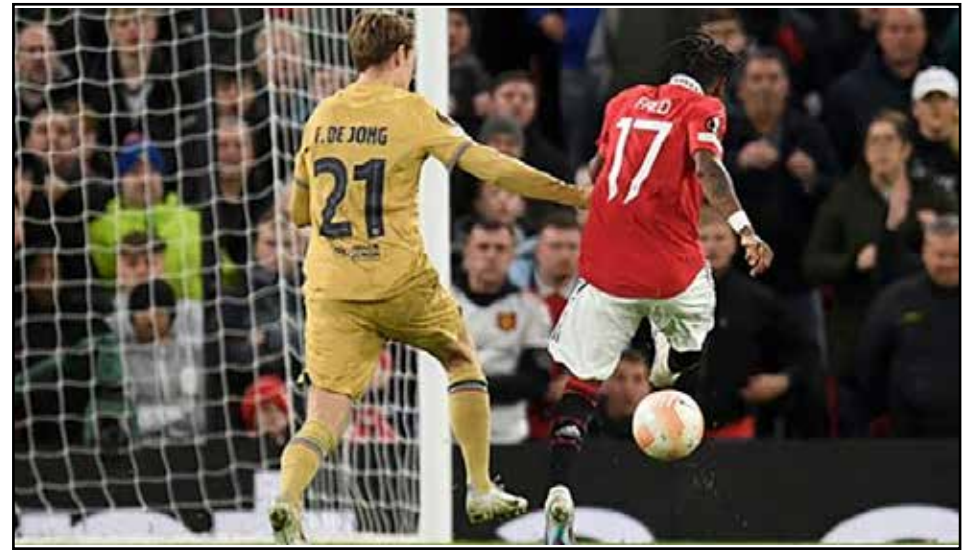
RIGHT SAID FRED: the Brazilian midfielder equalized for United on Thursday

When De Jong did come across to pressure his opponent after Fernandes had played a superb through ball, he