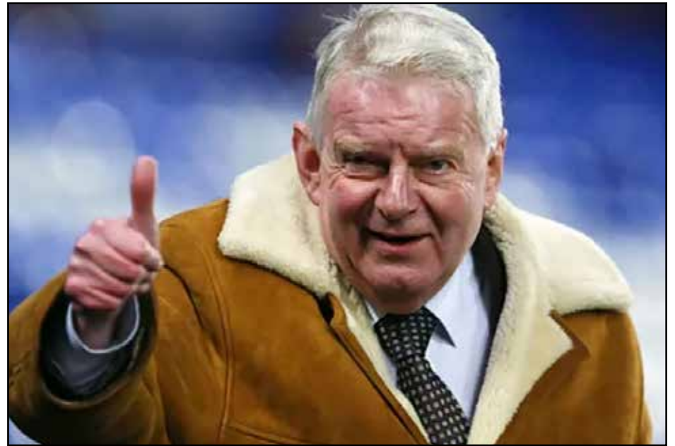
MOTSON: the famous fan of the sheepskin coat enjoyed a 50 year career at the BBC

For most of the period from 1979 to 2008, Motson - known for his trademark sheepskin coats and encyclopaedic knowledge of the game - was the BBC’s voice on major finals such as the FA Cup, European Championship and World Cup.