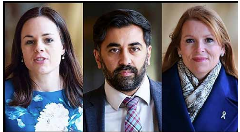
HOPEFULS: Kate Forbes, Humza Yousaf and Ash Regan

All three names will now go forward to be voted on by party members, who will be asked to rank the candidates in order of