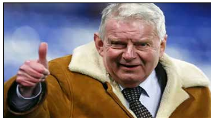
Farewell Motty: TV loses a legend....Page 4