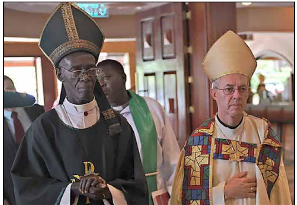
DISHARMONY EVERYWHERE: Archbishop of Kenya Eliud Wabukala is in strong disagreement with Archbishop of Canterbury Justin Welby (right)

Cutting ties with the Episcopal Church is one thing; breaking with the Church of England is another matter entirely. All 45 national or regional provinces in the Anglican Communion are autonomous and free to