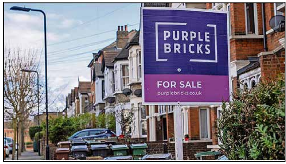
AT LONG LAST, A SLUMP: but prices remain eye-wateringly high

, was technically Queen Consort, but was known in public as Queen Elizabeth.