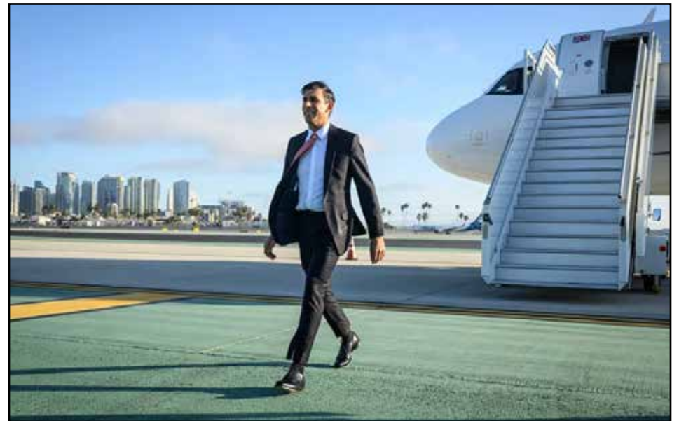
BLUE SKY THINKING? the Prime Minister arrives in San Diego this week ahead of talks with President Biden

Turning his sights on Beijing Mr Sunak vowed Britain would