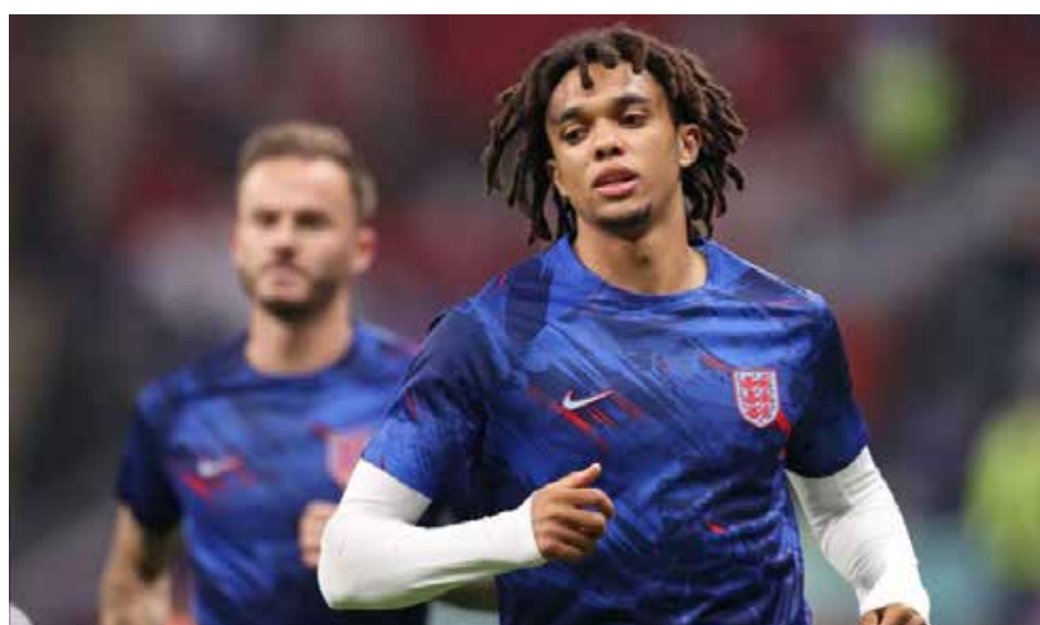
TTFN TO TAA: the Liverpool star has been left out of the latest England squad

Owen Farrell finished the game as captain after starting on the bench for the first time in eight years. He said: "England players never expect to be in this situation. We knew we had to improve before this game. We definitely know it after. But we have to improve together."