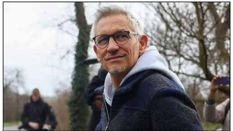
HONORS EVEN? Lineker is the BBC's highest-paid presenter

Lineker also said that "however difficult the last few days have been, it simply doesn't compare to having to flee your home from persecution or war to seek refuge in a land far away".