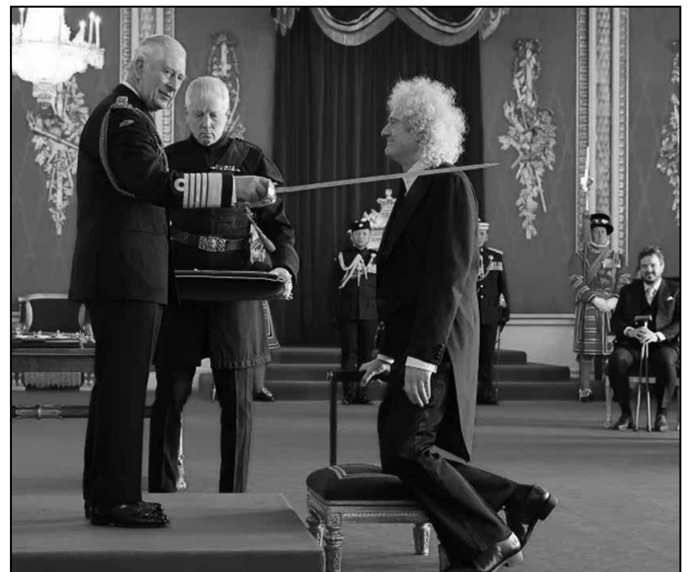
TAKING THE KNEE: feels the weight of the kingly sword...

The musician, famous for riffs and solos on songs such as We Will Rock You, Bohemian Rhapsody and One Vision, is no stranger to Buckingham Palace, having performed at the