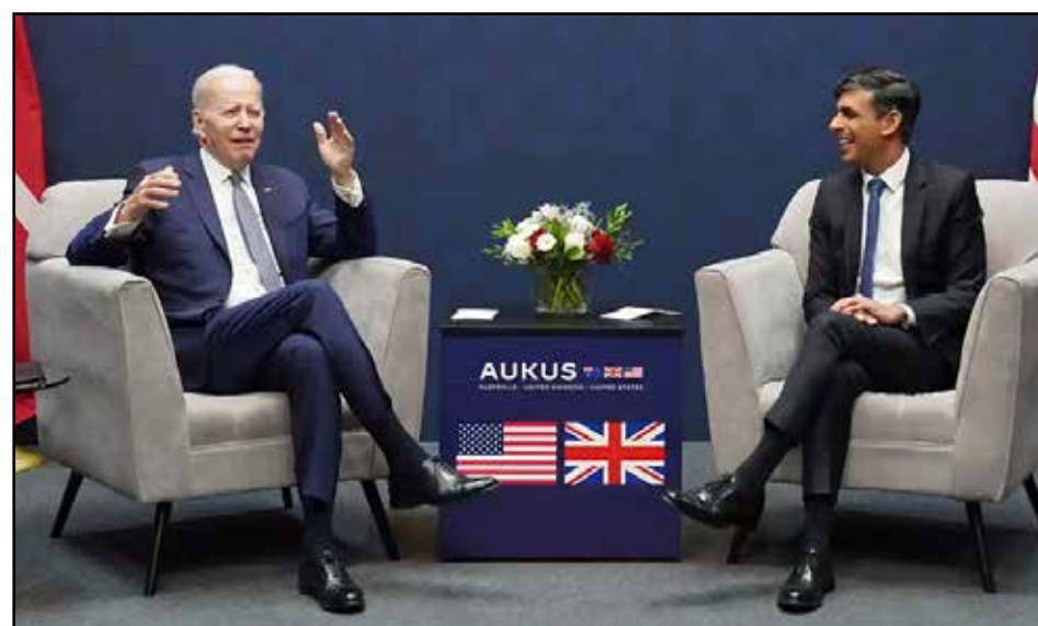
ALLIANCE RENEWED: President Biden and Rishi Sunak chatted privately for over an hour this week ahead of their landmark announcement

It is thought Britain could double its number of nuclear-powered hunter-killer submarines as part of the tri-nation alliance. Construction of the UK's submarines will take place principally in Barrow-in-Furness, Cumbria, with some other jobs being created in Derby. Between eight and 20 new subs could be