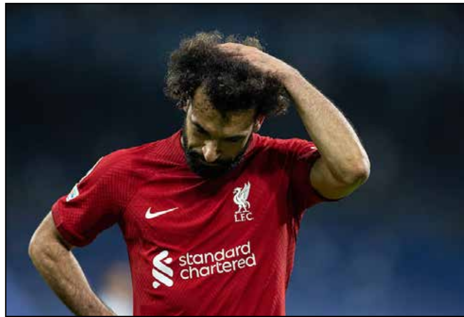
Mo Salah cut a frustrated figure Wednesday night at the Bernabeu

They did not even have a shot between James Milner's blocked effort in the 37th minute and Harvey Elliott's