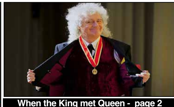
When the King met Queen - page 2