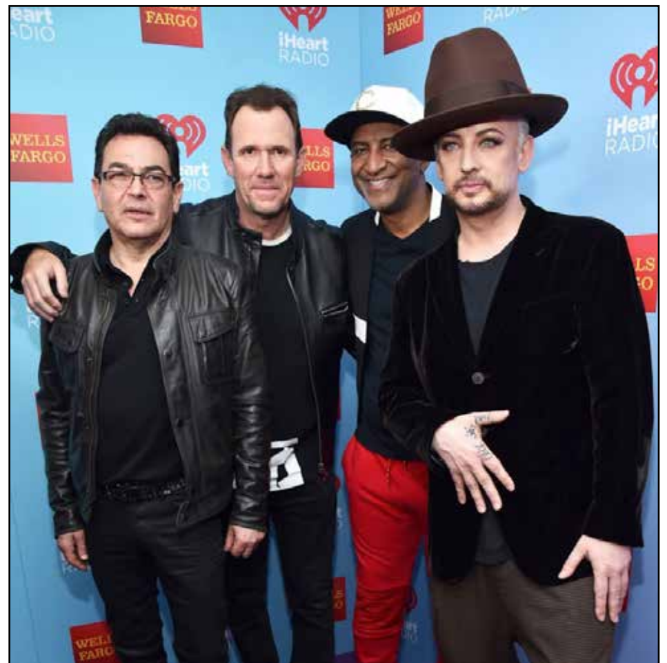
DO THEY REALLY WANT TO HURT HIM? Moss (left) with Roy Hay, Michael Craig and Boy George in happier times

At the time Jerry was reported to have been "heartbroken" at the end of the relationship.