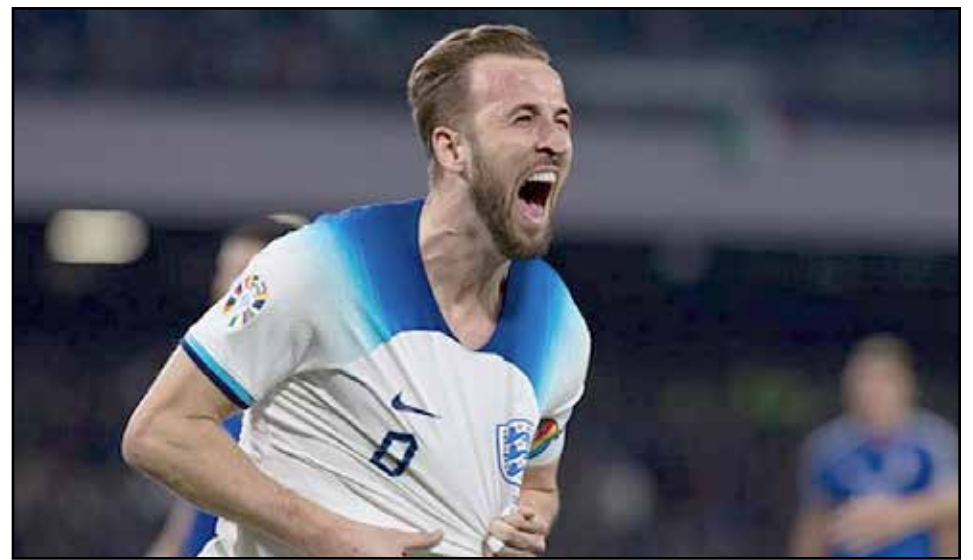
CAN'T MISS? Harry Kane put THAT World Cup miss behind him on Thursday, scoring from the spot in Naples to double England's goal lead against Italy

In practice, there were empty seats inside this vast bowl and Italy's poor first half meant that it took until after the break