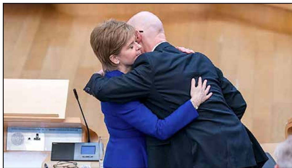
A few brickbats...but mostly love. The scene in Holyrood on Thursday.

Sturgeon, 52, announced her resignation last