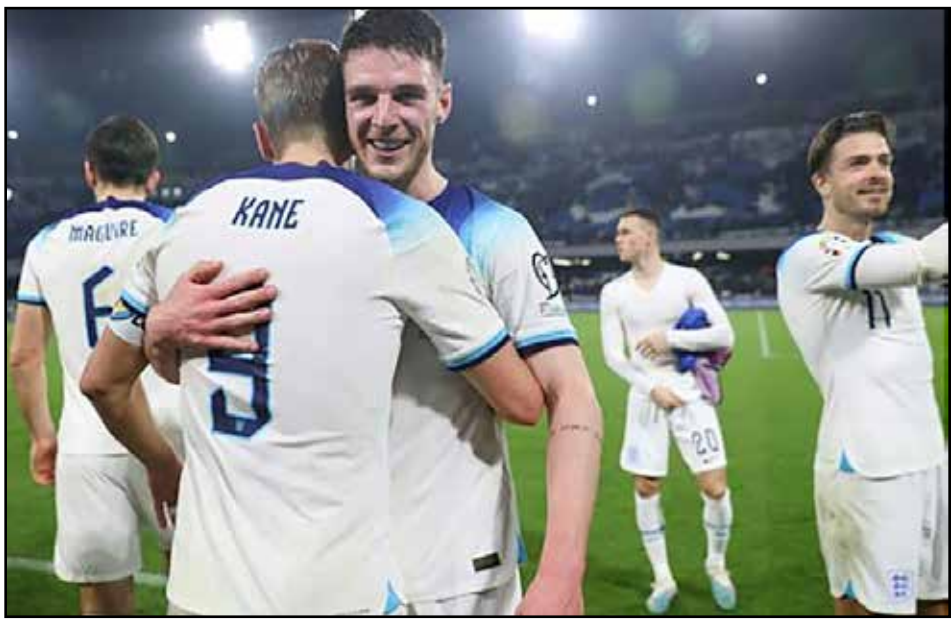
BETTER WITH RICE: England's two goalscorers embrace at the final whistle

And he has five England hat-tricks to his name, the same number as Lineker and one shy of the record tally of