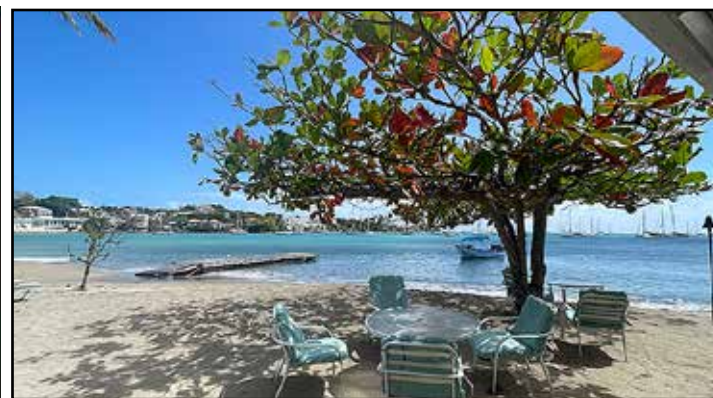
A quick break in Grenada - page 10