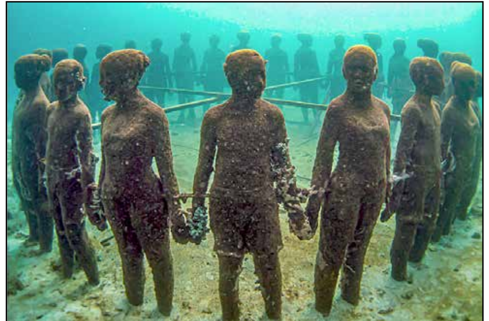
SEABED SURPRISE: 'Vicissitudes' is a ring of 26 standing statues just a few feet down in Dragon's Bay