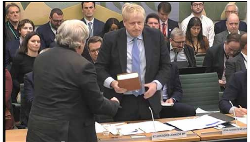
STILL PLAYING TO THE GALLERY: the former PM claimed there was "not a shred of evidence" to suggest that he misled MPs

The party's deputy leader Angela Rayner said: "They reveal a tax system designed by successive Tory governments in which the prime minister pays a far lower tax rate than working people who face the highest tax burden in 70 years."