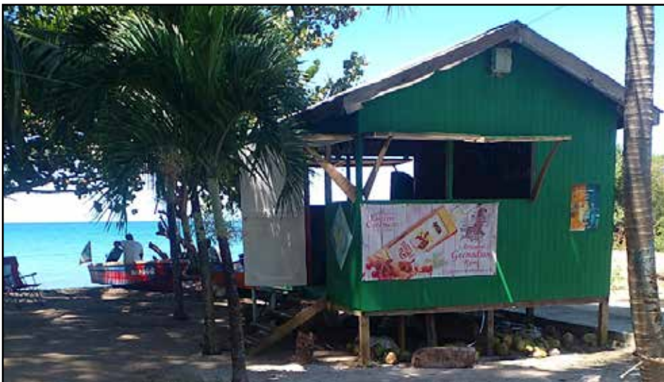
A RUM AFFAIR: the Dragon's Hideaway Sports Bar and Grill