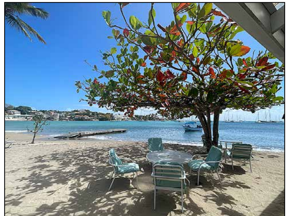
TRADING PLACES: the view from the Calabash Resort in Prickly Bay