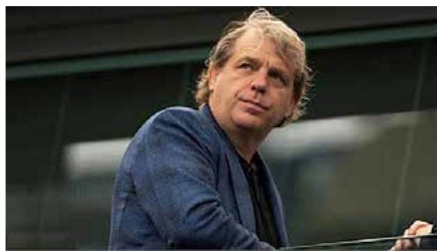
A very poor return on investment: Todd Boehly

Carlo Ancelotti's quest for an historic fifth win as a coach in this tournament will continue with a semi-final against either Bayern Munich or Manchester City while Chelsea's interim manager Frank Lampard, who now has