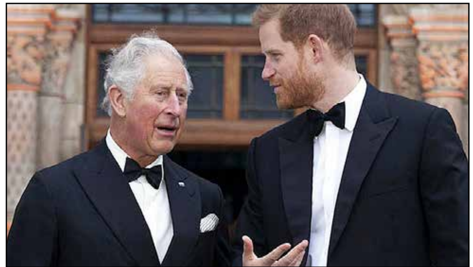
"I would like to get my father back," Harry admitted earlier this year

Sources claimed that Harry was desperate to attend to support his father and mark the significance of the