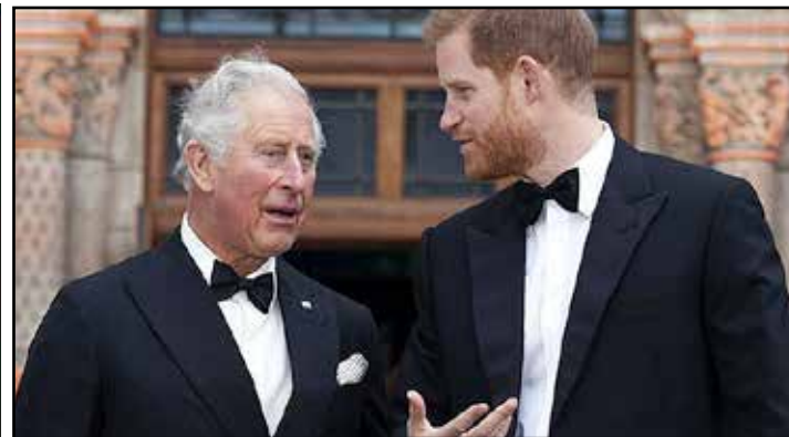
'Father and son talks led to Coronation deal' - page 3