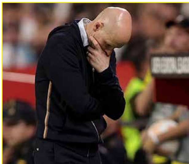
ERIK TEN HAG: Running out of juice in Seville?

The Spanish side were gifted the lead after eight minutes when Youssef En-Nesyri finished following an awful error from Harry Maguire, and Sevilla doubled their advantage shortly after half-time with a looping header from defender Loic Bade.