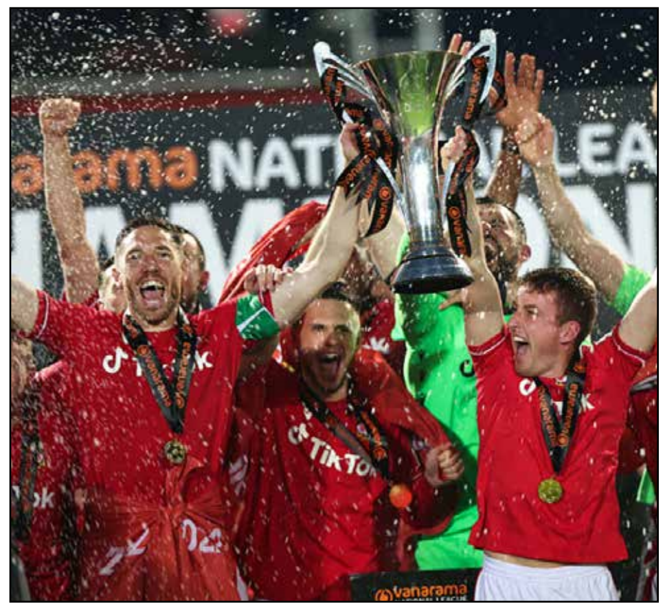
COMPULSIVE VIEWING: Don't miss Welcome to Wrexham on Netflix

Eurovision was terra incognita for most Americans... until the Will Ferrell comedy put it on the map