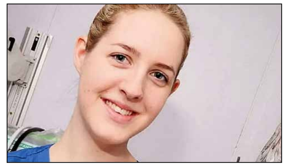
LETBY: the court heard 257 nursing shift sheets had been found at the accused's home during police searches