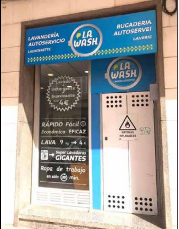
LA WASH: Port Mahon's finest laundrette