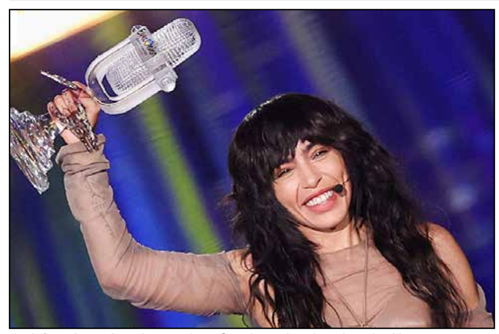
and the winner is.....Loreen from Sweden, who also triumphed in 2012