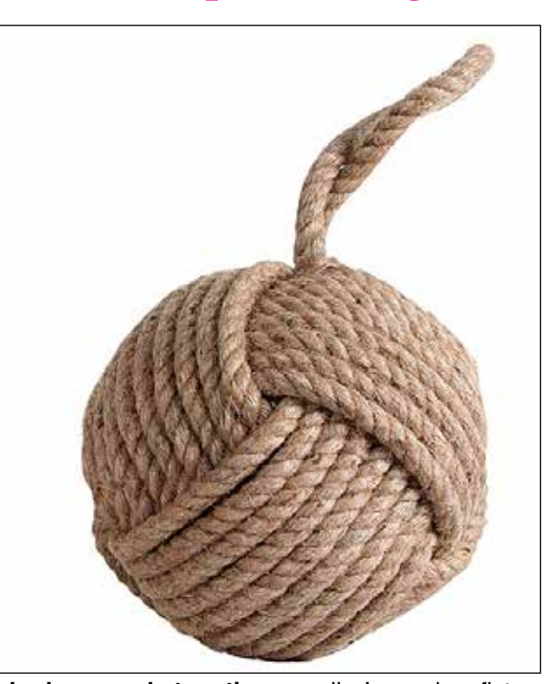
Bringing people together: a sailor's monkey fist

Ye Olde King's Head, 116 Santa Monica Blvd. Santa Monica CA 90401 • Tel: 310-451-1402