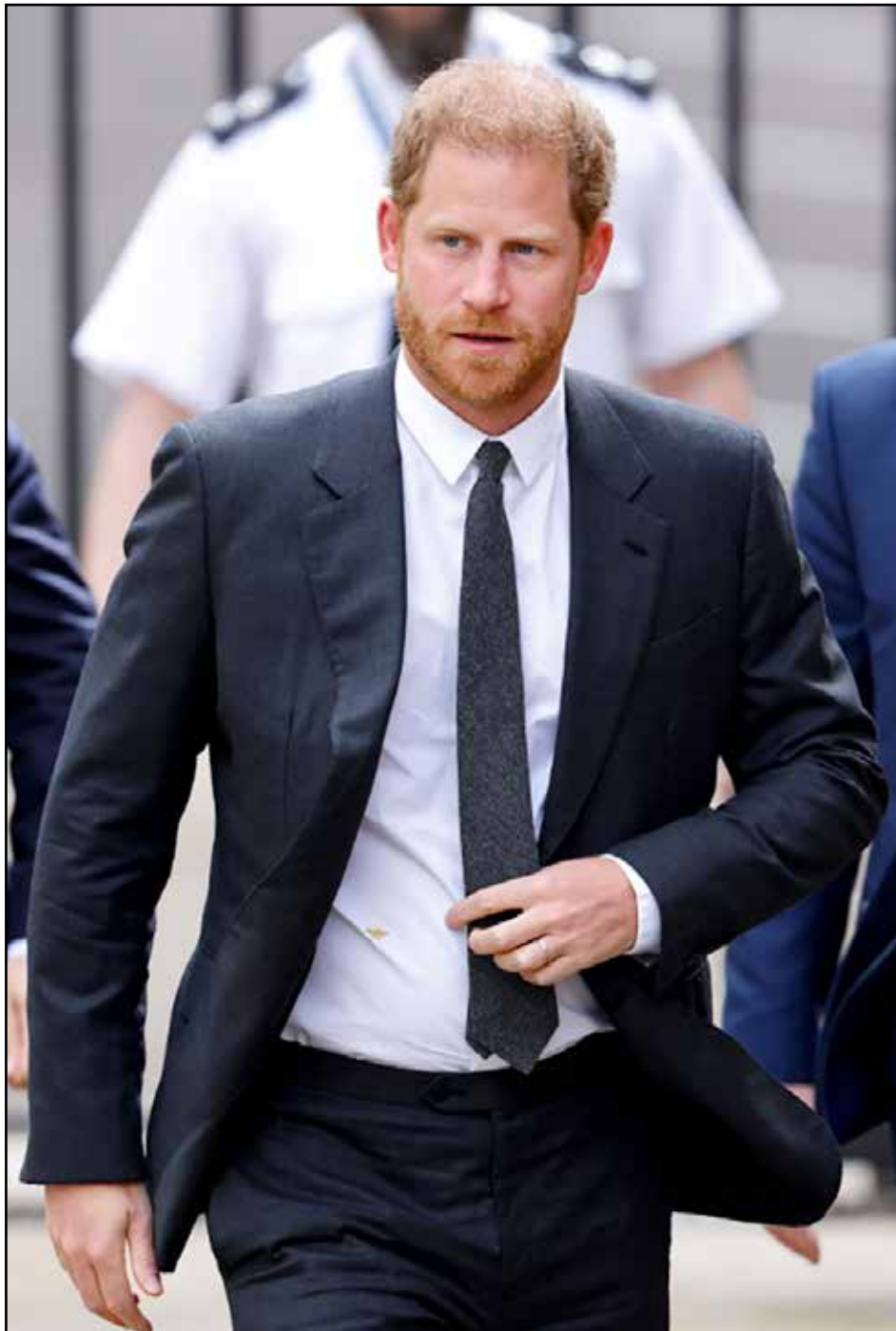
The Duke and Duchess of Sussex lost the right to automatic police protection after they quit their official royal roles in March 2020

■ Another setback for Prince after ruling endorses Home Office decision over specialist police security