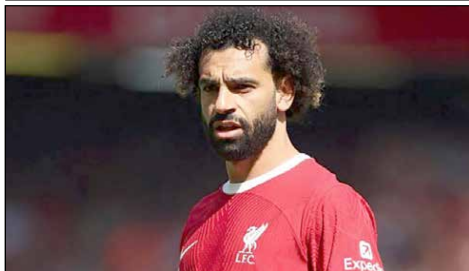
Salah has scored 19 Premier League goals with one game left this season