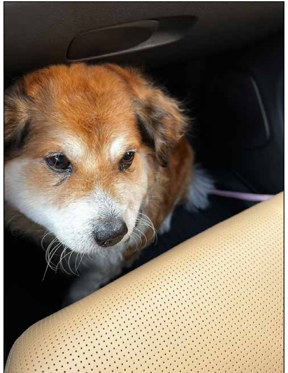
BONNIE, CHASTENED: the writer's beloved dog got a nasty surprise on the trail....

Identifying a snakebite on your dog is crucial in providing immediate assistance. Common signs of a snakebite include puncture wounds, swelling, pain, and inflammation around the affected area. Your dog may also show signs of distress, such as whimpering, restlessness, or difficulty breathing. If you suspect a snakebite, it is vital to