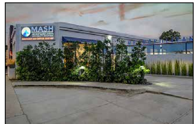
MASH: The Metropolitan Specialty Animal Hospital

Do not attempt home remedies: Avoid applying tourniquets,