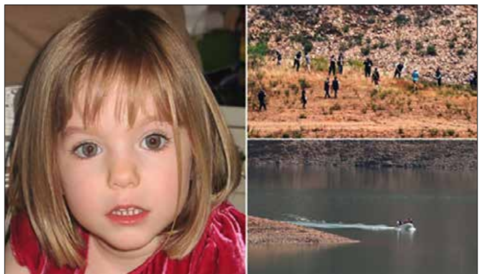
A police spokesman described the search as 'very specific'

One 10-metre squared patch of land appeared to have been the focus of the investigation. The slope of the bank had been cleared of wood and cut into. A series of deep pot holes had been scoured into the ground and soil samples had evidently been