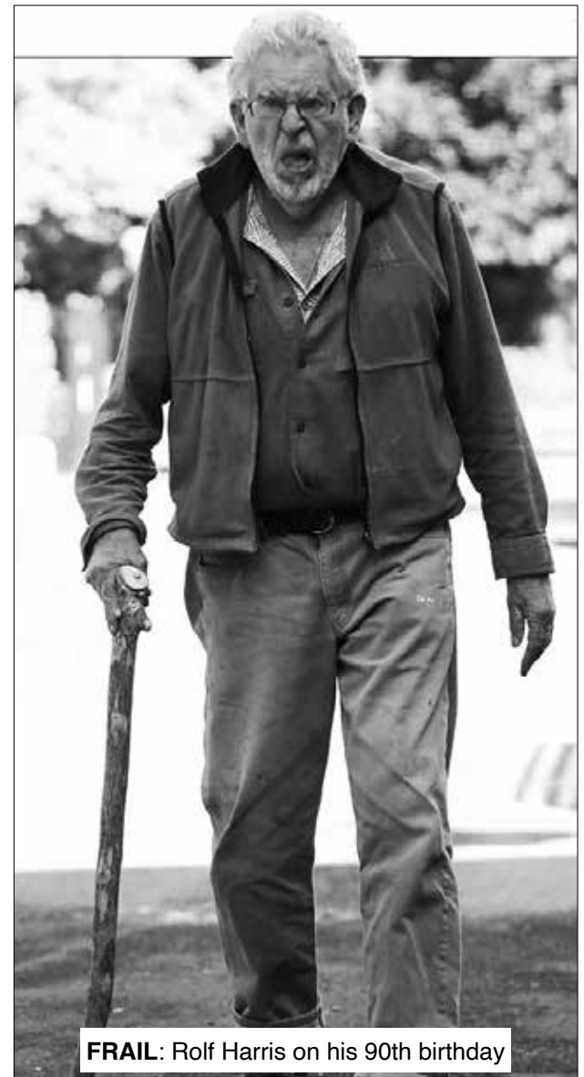
FRAIL: Rolf Harris on his 90th birthday

She said she tried to call and scream before she ran away.