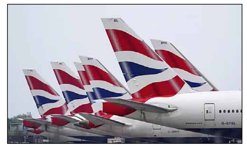
TAILS OF WOE: British Airways said it had "acted lawfully at all times"

"Since March 2020, the Department has received