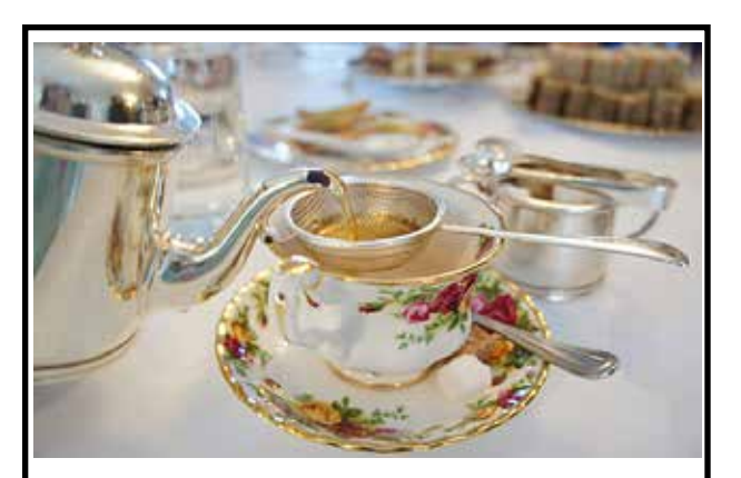
It's Time For Tea....

In the end it doesn't matter, the show gave us lots of feelgood moments but the final whistle blew at the right time. No extra time. No penalties. And whatever happens in the future...we'll never forget this season.