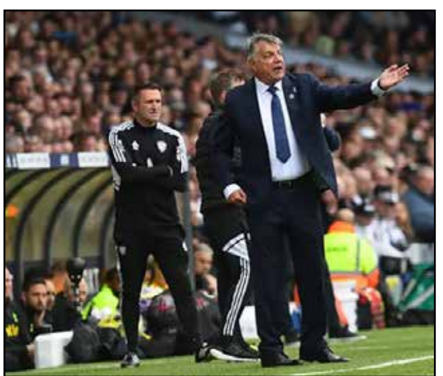
Allardyce: only one point in four games at Leeds

Whoever takes charge next season is likely to do so against a backdrop of considerable uncertainty. While it is unclear whether a successor to the recently sacked former