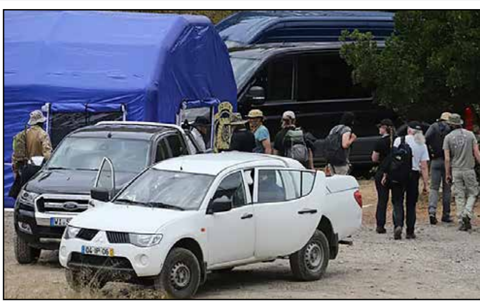
Members of the search team at Barragem do Arade reservoir last week

He added that the joint operation between German, British and Portuguese authorities went "excellently and very constructively".