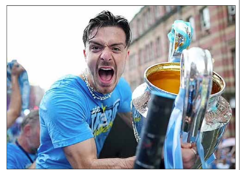
JACK THE LAD: Grealish was at the center of Manchester City's celebrations

All in all, it promises to be a fascinating summer.