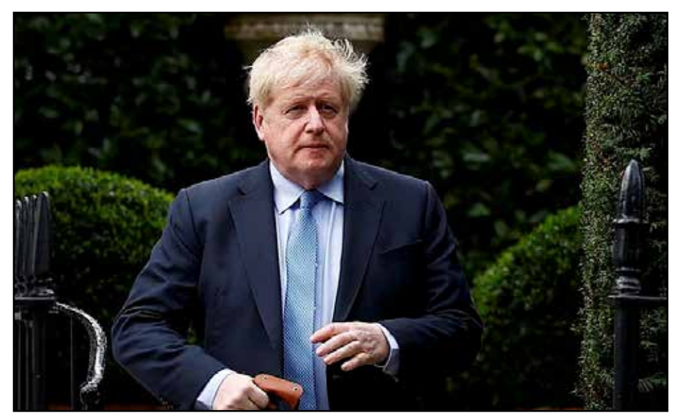
Johnson's "repeated failures pro-actively to investigate" the lockdown breaches, amounted to "a deliberate closing of his mind", said the report

•"Impugning the committee" in his criticism of it, and being complicit