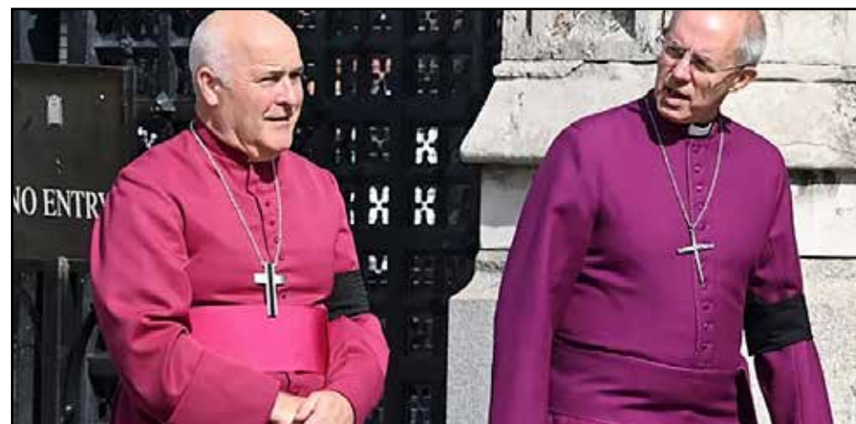
IN LOCKSTEP: the archbishops of York and Canterbury made the announcement

Writing on Twitter, he said the panel “had one overriding objective; to work independently