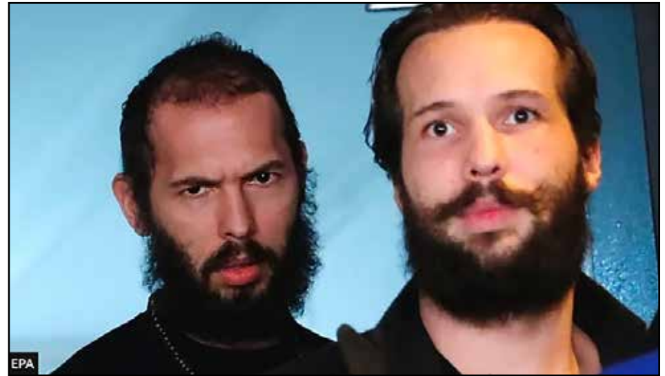
BOORISH BROTHERS: Andrew and Tristan Tate appeared in court for the first time on Wednesday in Bucharest

Despite social media bans, he gained popularity, particularly among young men, by promoting what he presented as a hyper-masculine, ultra-luxurious lifestyle.