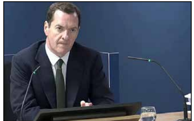
Former Chancellor George Osborne claimed austerity measures made the UK better able to weather Covid