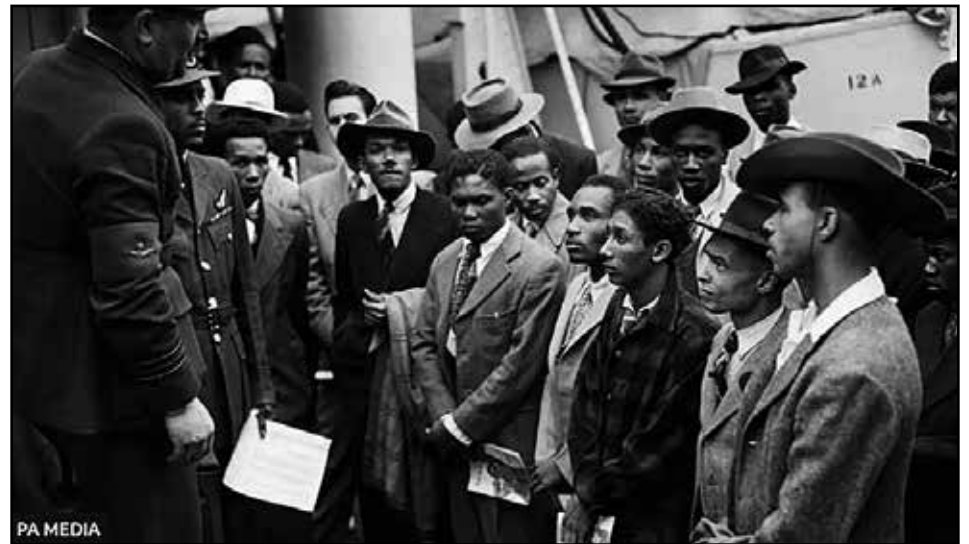
DIFFERENT WORLD: HMT Empire Windrush docked in Tilbury on 22 June 1948