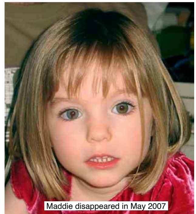
Maddie disappeared in May 2007

Earlier this year, a reservoir in Portugal was searched and items seized after the German prosecutors received "certain tips" about the case.