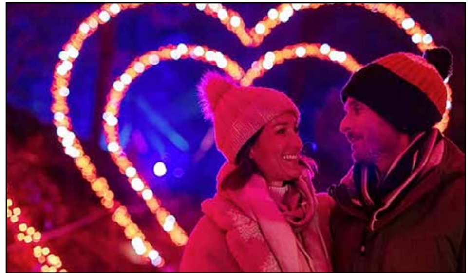
Blenheim Palace in Woodstock, Oxfordshire, is the country seat of the Churchill family. This year they debut their Christmas Illuminated Light Trail (above), and there's always plenty to enjoy at their Christmas Market in the Great Court (below)

Another historic British site is Blenheim Palace in Oxfordshire, ancestral home of the Churchill family, which this year sees the debut of their Illuminated Light Trail and an exquisitely themed Palace interior. The trail brings together a multitude of twinkling lights, seasonal sounds and festive fun. This after-dark trail makes