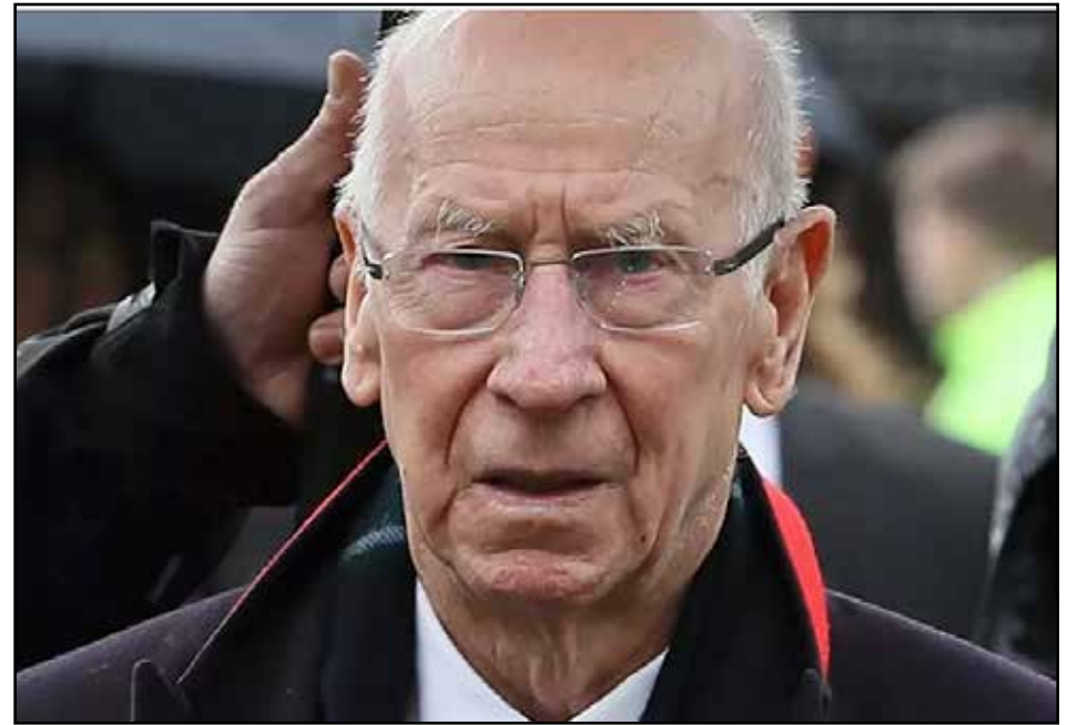
CHARLTON: sad end for the Manchester United and England legend

United bosses have said a memorial service will be held at Manchester Cathedral on Monday, November 13, at 2pm. The procession there will pass by the Old Trafford ground where fans will be able to say a final farewell. A