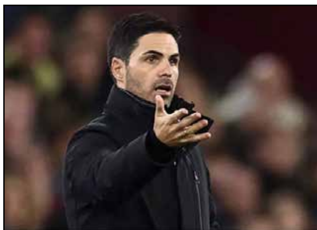
ARTETA: "I'm disappointed with myself."

"The game took a direction because of the