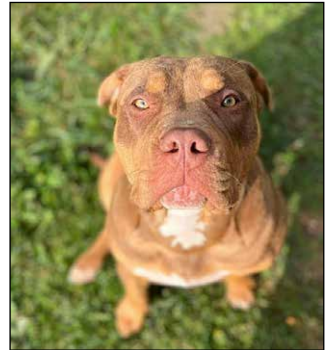
BAD TO THE BONE? the general public think so...

The American Bully was started by crossing the American Pit Bull Terrier with other