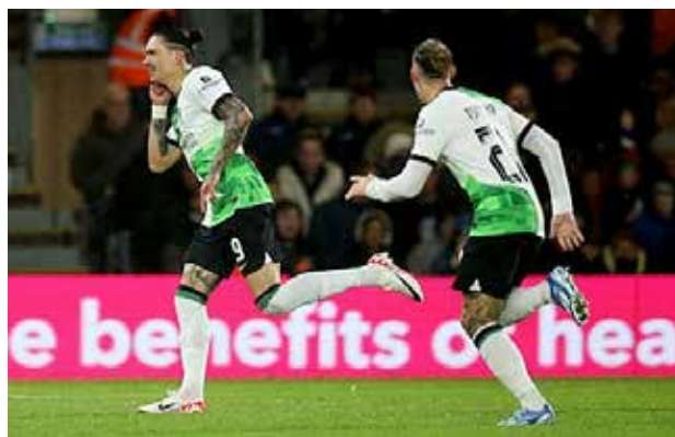
Darwin Nunez has seven goals for Liverpool this term

But Bournemouth levelled through Justin Kluivert as he netted his first goal for the club since joining from Roma in the summer. He emerged unmarked at the far post to head home an Alex Scott corner in