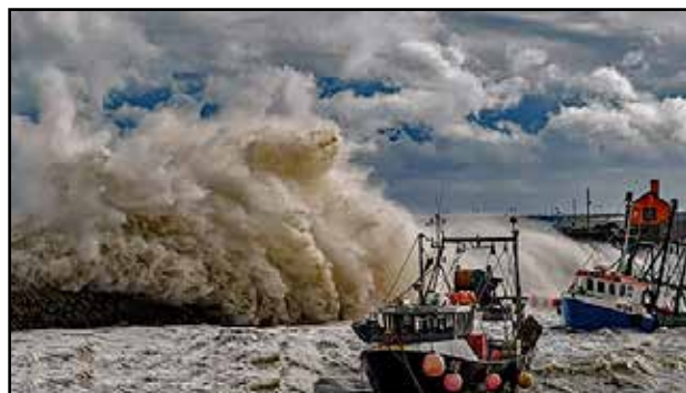
BREACHING THE WALLS: Sheltering in harbor did little to protect these trawlers from the elements

In France, where 1.2 million people were reported to be without electricity, a lorry driver was killed after being struck by a falling tree. Spain, Belgium and the Netherlands have also been badly hit.