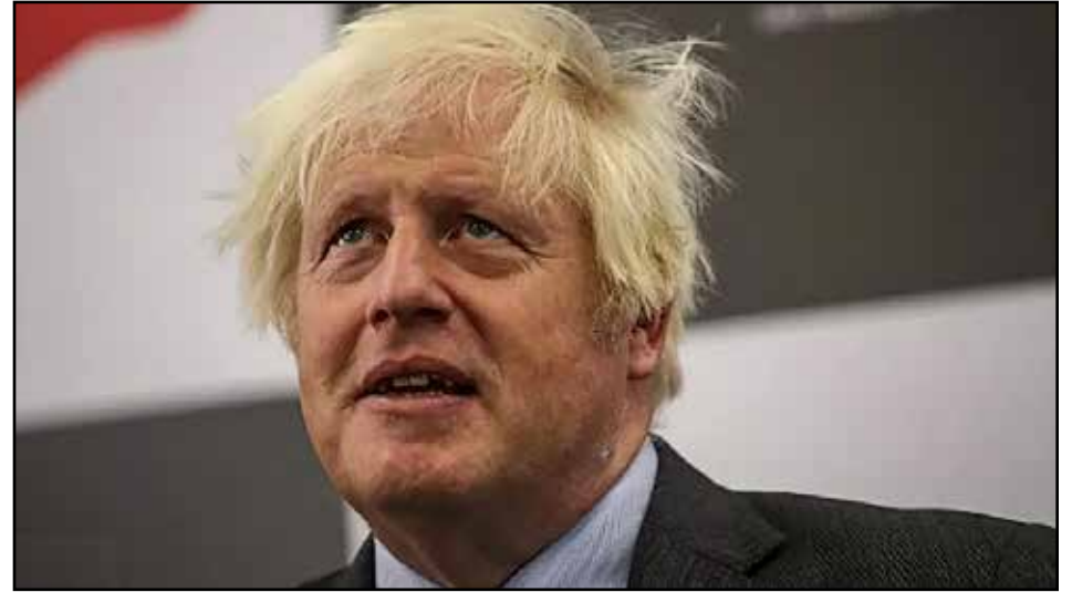
"Why are we destroying the economy for people who will die anyway soon?"