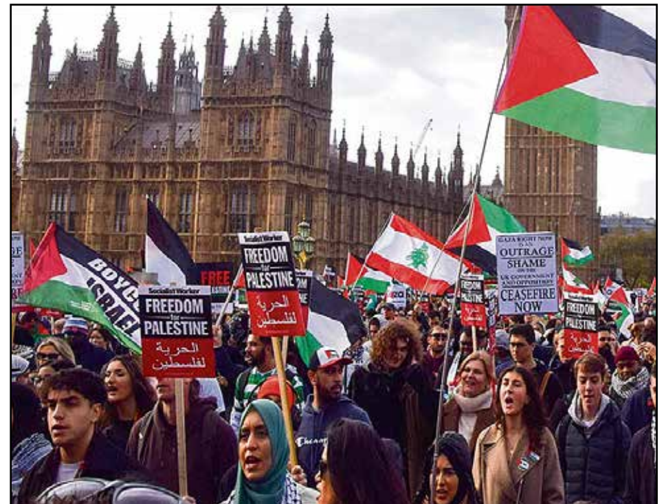
One of many pro-Palestine marches in the UK this past week....but Government officials are uneasy about the events stoking anti-Semitism

"There's a lot to do with terrorism and hate crime but we don't have a body