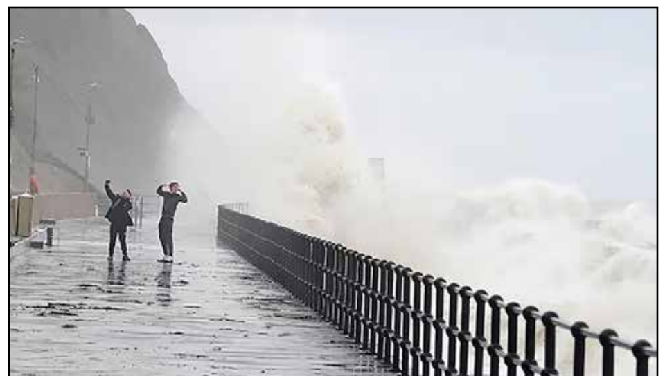
STORM SELFIES: young locals in Folkestone prioritize social media over safety

St Helier was blown apart - but it was even worse on the nearby French coast, which saw winds reach a top speed of 129mph.