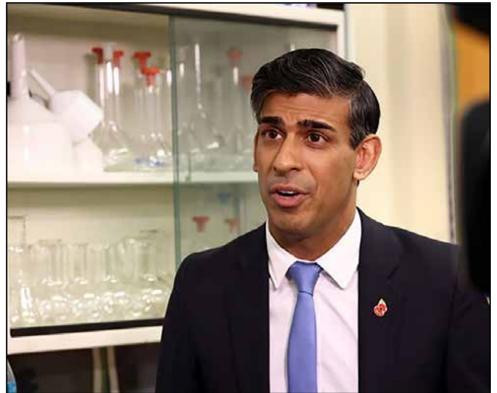
The prime minister's comments come after Steve Barclay, the health secretary, said 11 November was the "wrong day" for protest action in London calling for a ceasefire in Gaza. But the police say they can protect remembrance events.

the police instead of working with them is cowardice," he said on X.