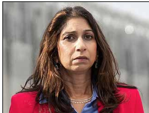
BRAVERMAN: not backing down