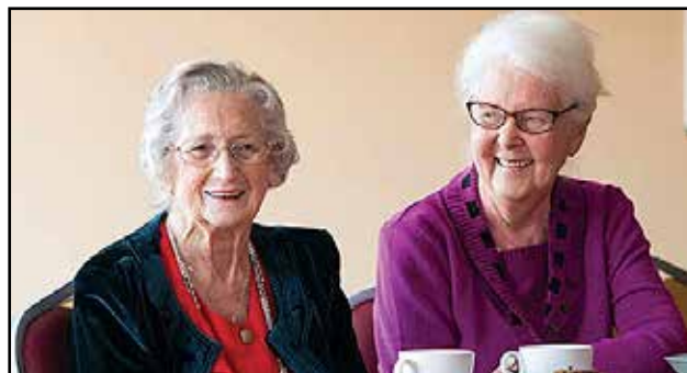
GOLDEN OLDIES: one in three of the Yorkshire coastal town's residents is aged 65 or older, drawn by modest costs, plentiful amenities and a bustling local harbor

Taking 65 as the average retirement age today, the ONS figures show that in 1998 those aged 65-plus accounted for one in six of the population (16%).