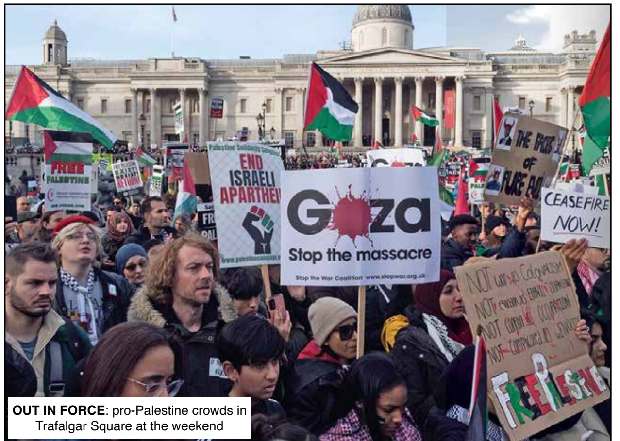
OUT IN FORCE: pro-Palestine crowds in Trafalgar Square at the weekend

Contradicting Mrs Braverman’s claims of police bias, the official said: “The Prime Minister continues to believe that