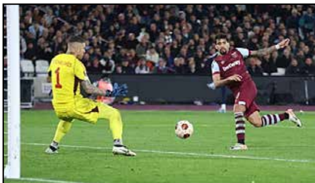
Paqueta's quality was the difference between the two sides on Thursday night at the London Stadium

The win, avenged West Ham's loss to the same opponents in Athens a fortnight ago, which marked the end of an