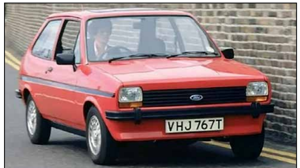
Launched in 1976 in response to the oil crisis, the thrifty Ford Fiesta remained a firm favorite among British drivers for almost 50 years

A spokesperson for Essex Police said: "This particular Ford model is