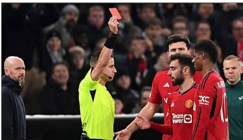
The match turned on Rashford's 42nd minute dismissal