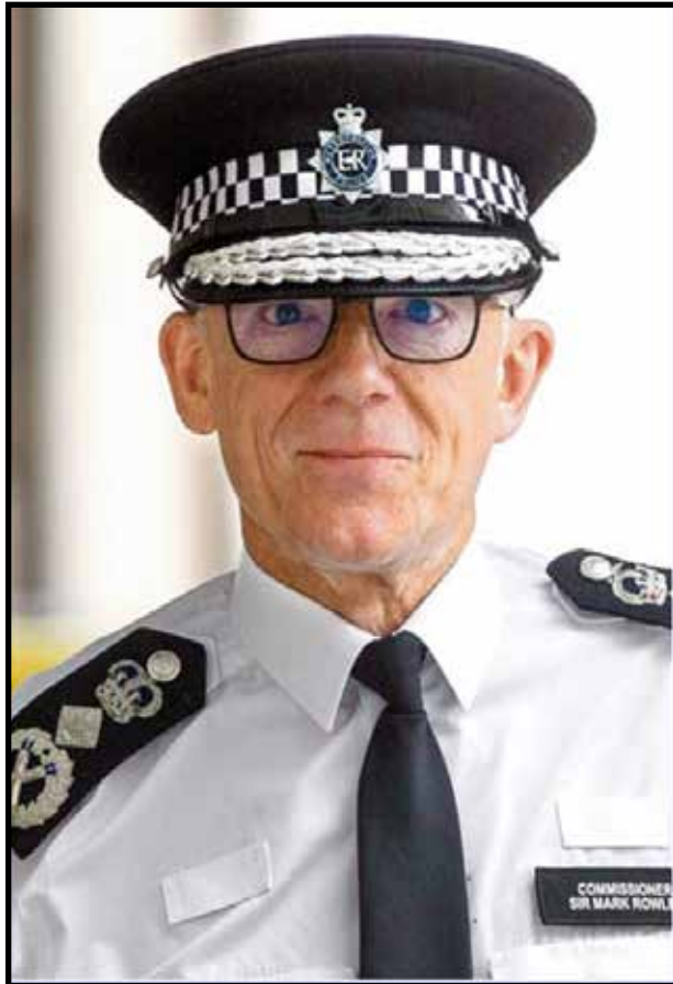
Sir Mark Rowley: the Met chief said there was no sign that Saturday's planned march would turn violent

Sir Mark said the demonstration on Saturday would go ahead because the "legal threshold" to stop it on security grounds "had not