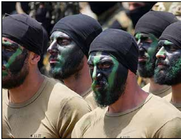
TROUBLE TO COME? Hezbollah recruits on a training exercise in Lebanon in May