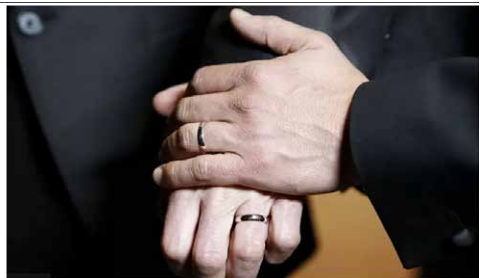
Services of blessing will soon be available for gay couples in C of E parishes