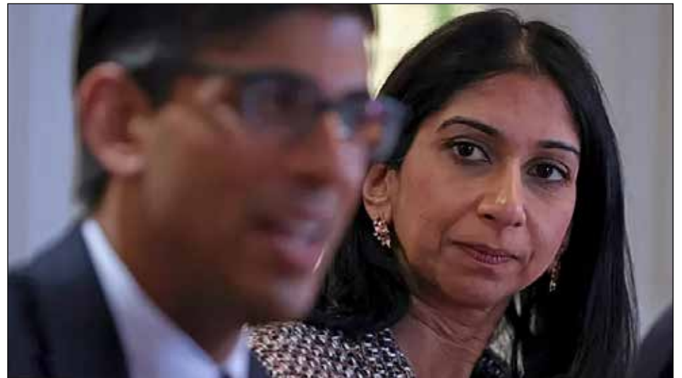
FEELING BETRAYED: Braverman accused Sunak of 'magical thinking'

If the ruling goes against the government,