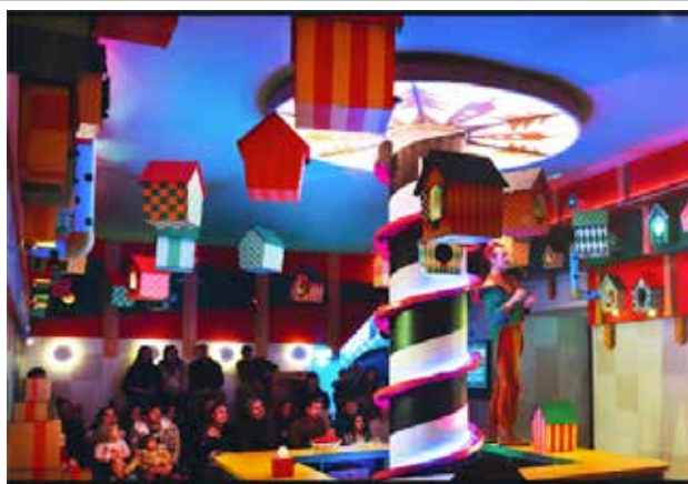
Festive Fun at Wishmas in Waterloo south London

Mischief's unique brand of hilarious, 'gut-busting' comedy (New York Times), has found universal appeal on a global scale. Don't miss Peter Pan Goes Wrong in London this Christmas and brace yourselves for an awfully big adventure! Tickets from £15. Run time is two hours plus