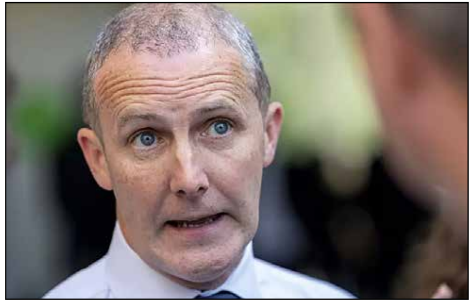
SNP's Michael Matheson, health secretary of Scotland, made an emotional apology this week after initially an £11k data bill to Holyrood

Officials also allowed Matheson to put the remainder of the costs on to parliamentary expenses, leaving taxpayers to foot the entire bill. The parliament has since announced a wholesale review of all iPad and data billing rules.