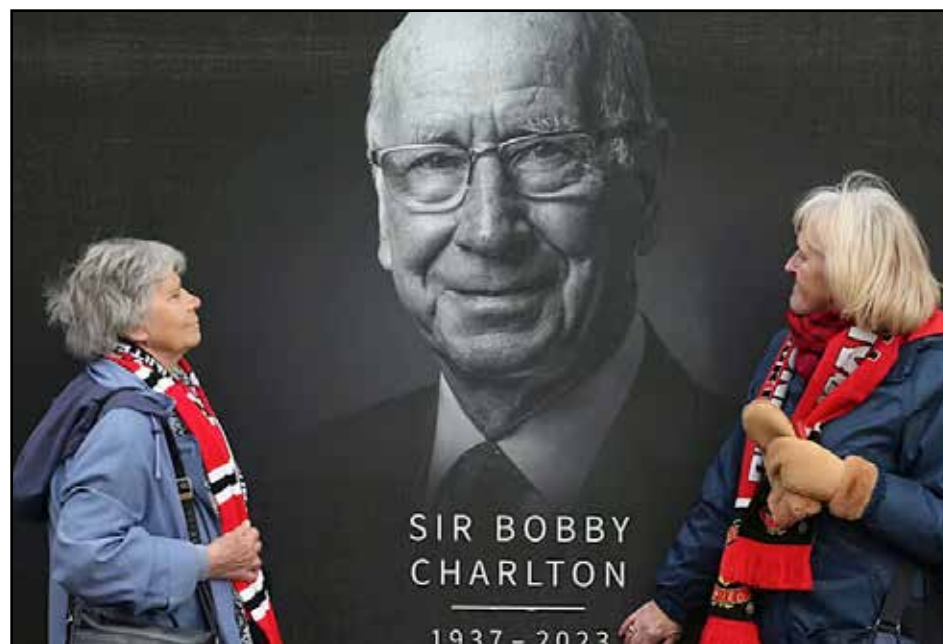
Gone, but never forgotten: Sir Bobby Charlton was laid to rest this week

Inside, tributes and eulogies drew a connection