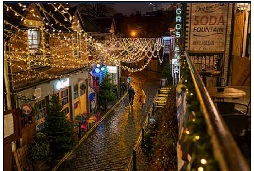
Earth has nothing to show more fair...than London at Christmas

Produced at the West End's famed Lyric cont. on page 11, col. 1