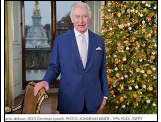
King Charles III 2023 Christmas speech

King's Christmas plea for peace on earth - page 3