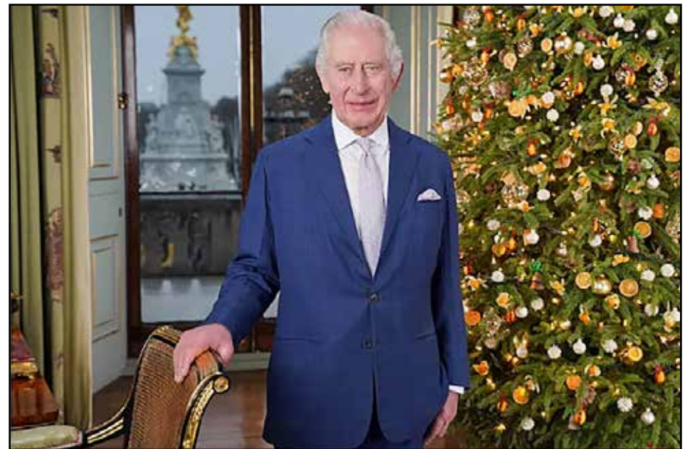
King Charles delivers his 2023 Christmas speech

Princess Anne and the Duke and Duchess of Edinburgh also featured. Highlighting the cost crisis and acknowledging the work carried out