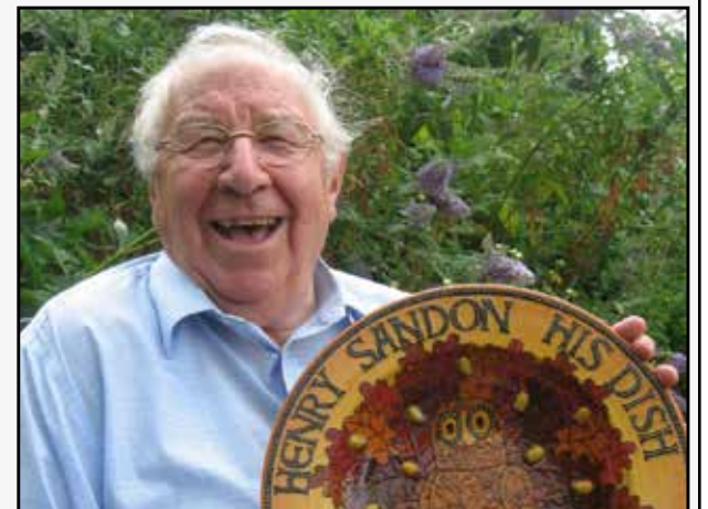
Sandon: a fixture on the popular show for 30 years

curator and then patron will be "sorely missed".