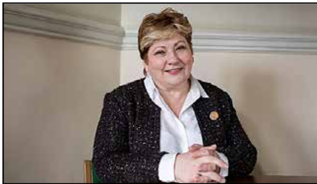
EMILY THORNBERRY: "The country is desperate for a general election."

If he fails to call an election in May, Labour may start to spread the narrative that Sunak is a "bottler" and "squatting" in Downing Street, which