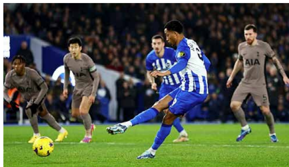
Eight of Joao Pedro's 13 goals for Brighton this season have come from the penalty spot

"We played fantastic football for 80 minutes and then we were unlucky in the first goal we conceded," Brighton boss Roberto De Zerbi