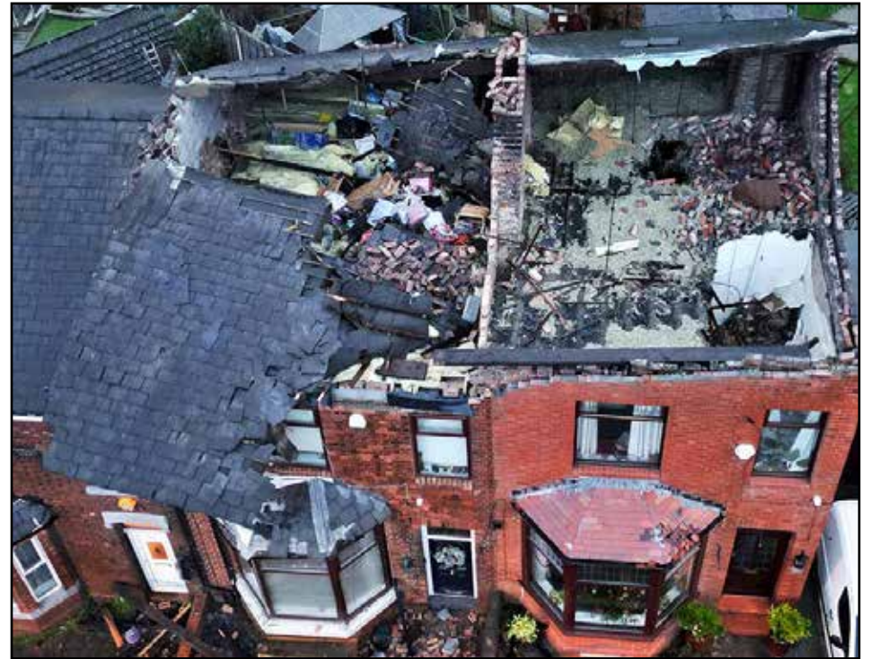
RIPPING THE ROOF OFF: the Moodys' Stalybridge house after the tornado struck

A Met Office spokesman said that early reports from the area indicated that "a tornado at the surface was likely" to be the cause of the destruction.