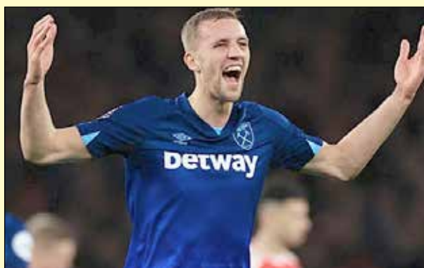
HISTORY MAN: Soucek scored West Ham's 300th goal in Premier League London derbies

Despite plenty of possession and pressure, Arsenal could not find a response.