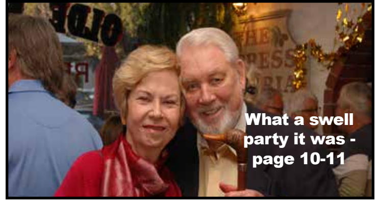
What a swell party it was - page 10-11

California's British Accent™ - Since 1984