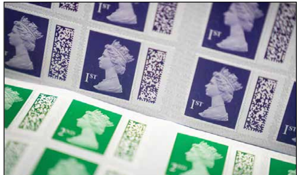
"ECONOMIC WARFARE": Even Royal Mail experts have trouble telling them apart

Fake stamps are becoming so realistic that even figures at the Royal