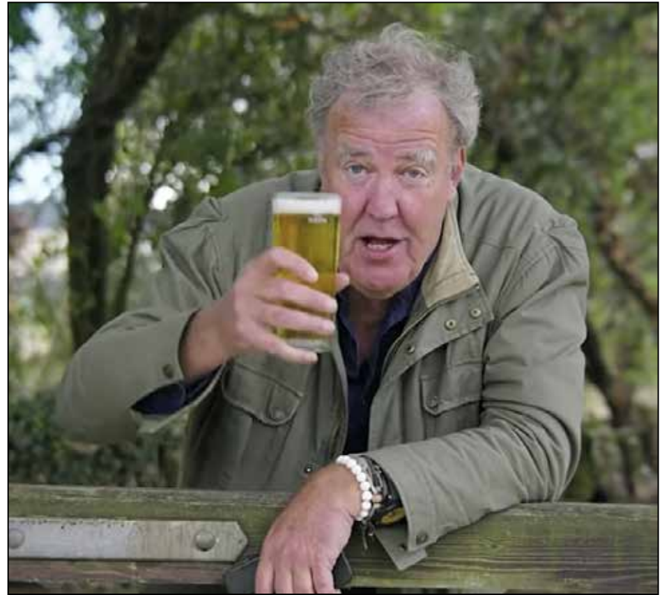
MORE ON TAP: a new series of Clarkson's Farm will drop on Amazon on May 3rd