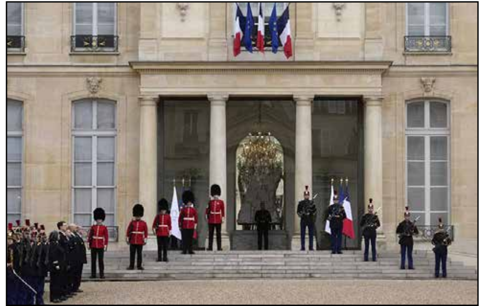
BROTHERS IN ARMS: Coldstream and Republican Guards outside the Elysee Palace

Relations had always been rocky between England and France, to say the least - two headstrong countries with powerful global influence and a history of