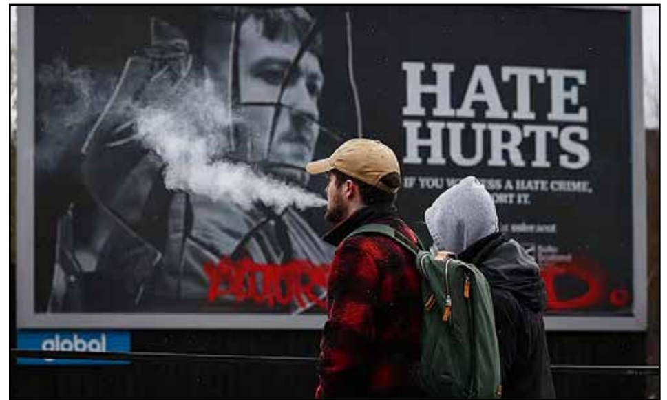
OVERWHELMED: Scottish police are required to investigate every complaint on the anti-hate hotline, no matter how seemingly frivolous

"This public targeting of a group deeply offended us and thus