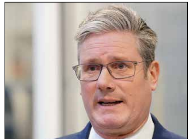
CLOSE TO HOME: Labour leader Keir Starmer

government to publish its legal advice. David Lammy, the shadow foreign secretary, said arms sales should be halted if there has been a "serious breach" of international law.