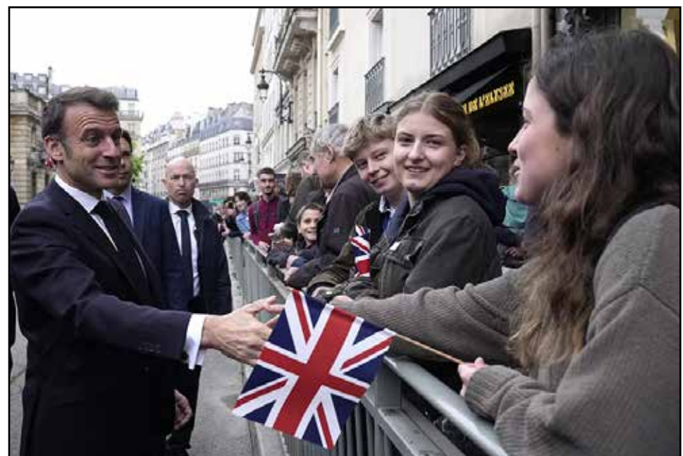
PRESSE LE FLESH: Emmanuel Macron greets British tourists in Paris on Tuesday