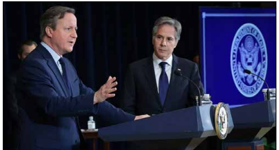
UNITED FRONT: David Cameron appeared with Anthony Blinken in DC on Tuesday

was having "an ongoing conversation with Israel about any Rafah operation".