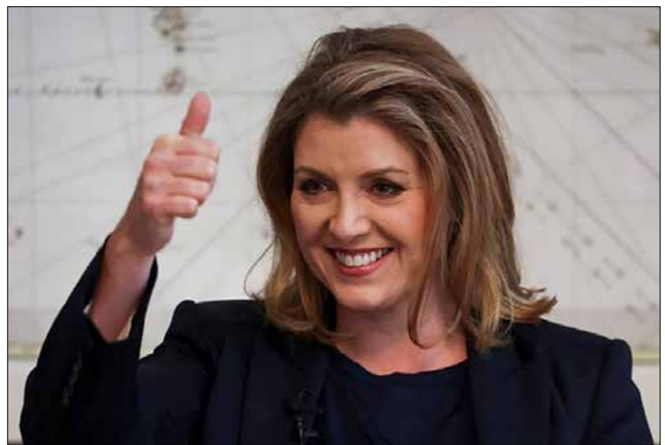
Penny Mordaunt: darling of the Tory Party’s disgruntled right wing