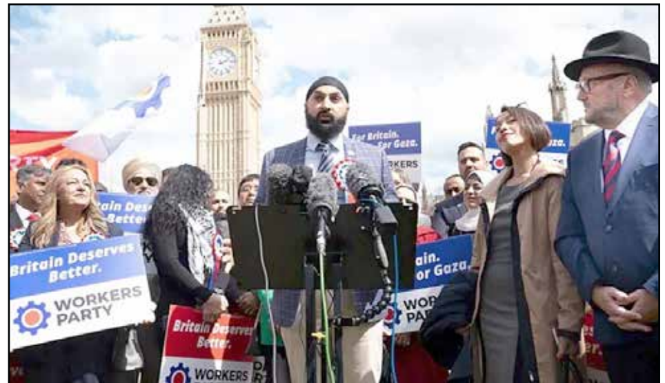
FULL MONTY? Panesar announced his candidacy on Wednesday

Kate Forbes narrowly lost to Humza Yousaf in 2023 understood working sense for the unity together with Mr of the party and the Swinney made "huge movement".