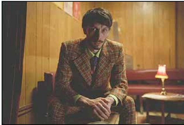
Richard Gadd: the show's creator relives his early struggles as a stand-up comic in London

The British show recounts the creator Richard Gadd's harrowing experience of being stalked by a troubled woman, and the trouble had trying to get the police to take the matter seriously. And in a bizarre twist, internet sleuths have identified the woman in question, who is now considering legal action against the streaming giant for defamation. In an interview with the Daily Mail, she accuses Gadd of exploiting her story for fame and subjecting her