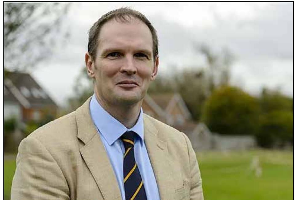
Dan Poulter, MP for Central Suffolk and North Ipswich, has defected to Labour

“We’ve heard these rumours time and time again. Always lacking substance. Idle speculation is not helpful to anybody but those wishing to cause chaos,” the source said.