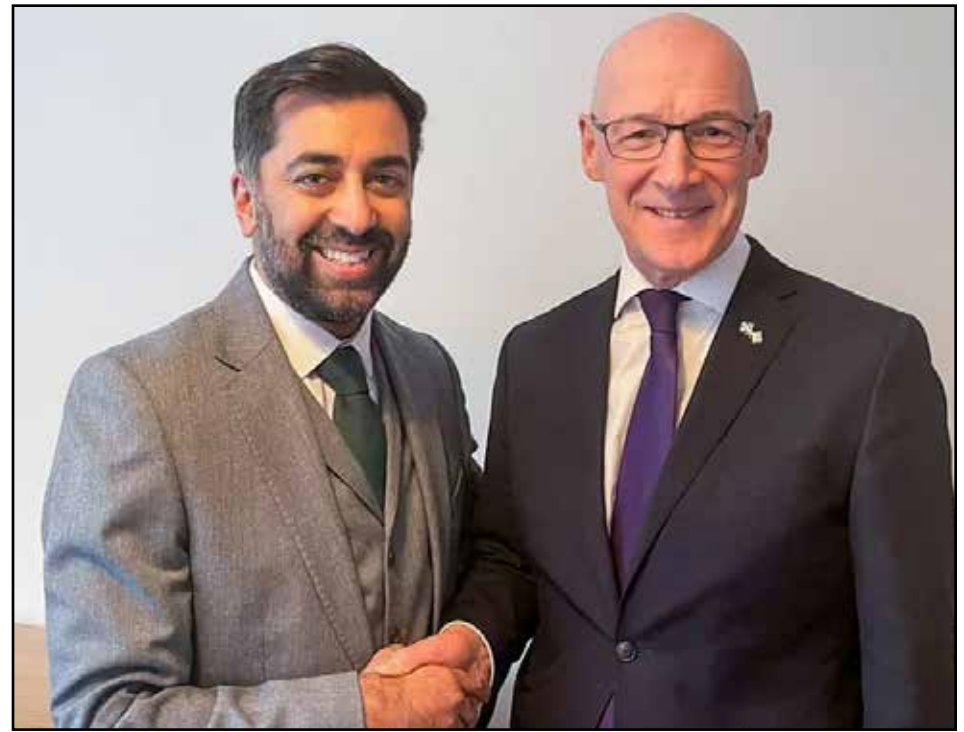
BACK TO THE FUTURE: departing First Minister Humza Yousaf with veteran SNP member - and his replacement - John Swinney

He told reporters he had "always believed" Ms Forbes could make a