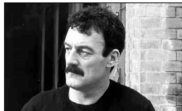
Hill as Yosser Hughes in Boys From The Blackstuff

Samwise Gamgee, began by saying: "We love him. He was intrepid, he was funny, he was gruff, he was irascible, he was beautiful."