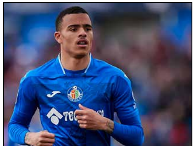
GREENWOOD: thriving at Getafe

“I think he will remain with us for another season or at least until January. He is a good footballer.”