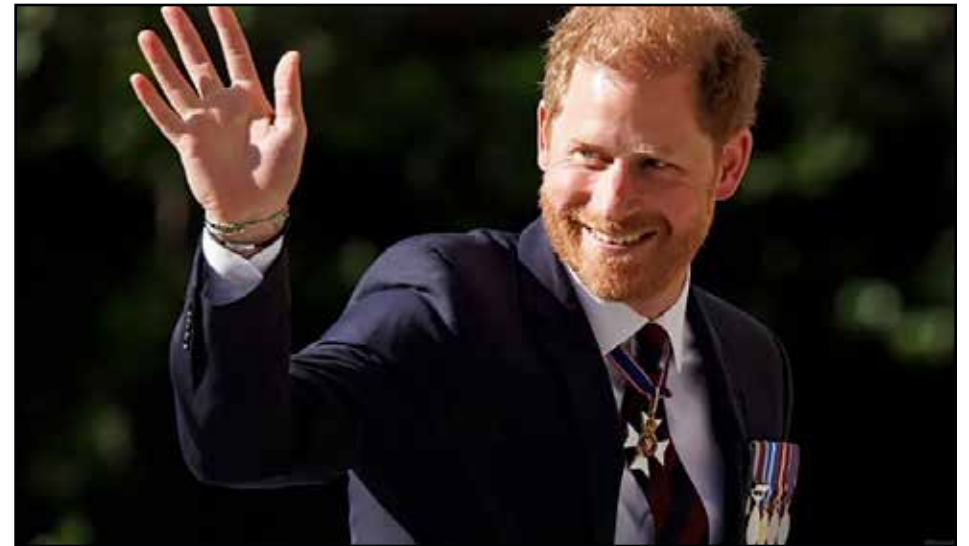
IT'S THE WAY HE TELLS 'EM: Harry was in town for a service at St. Paul's Cathedral celebrating 10 years of his Invictus Games

This week Harry was also without his wife Meghan, who was at home in California with