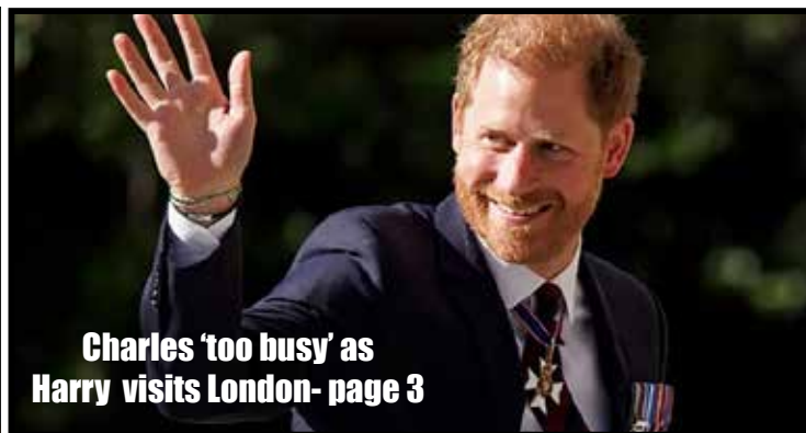
Charles 'too busy' as Harry visits London- page 3

California's British Accent™ - Since 1984