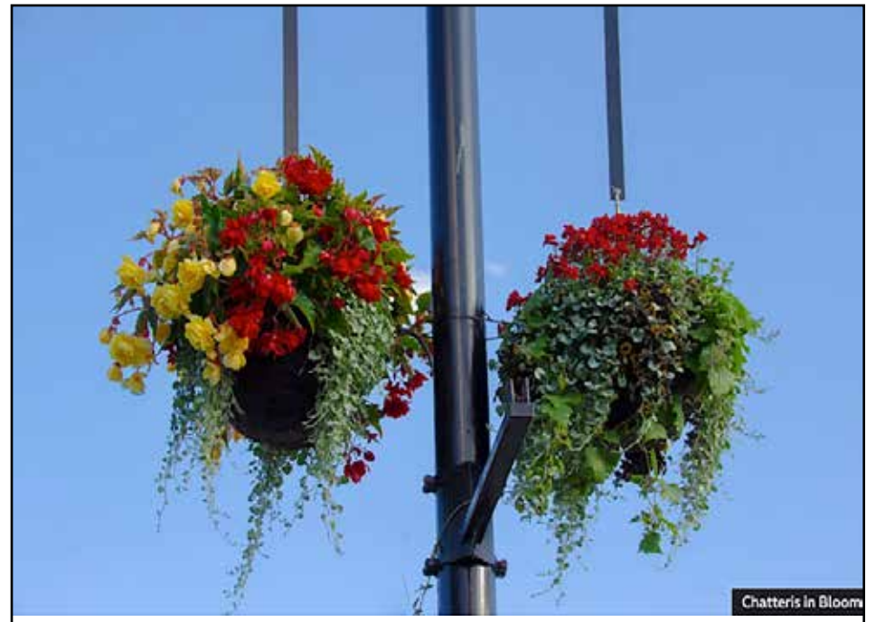
Flowers have long adorned lampposts in Chatteris in spring - but not this year

"You can't just have the flowers, the hanging baskets do make it... you can't have the fish without the chips," she said.