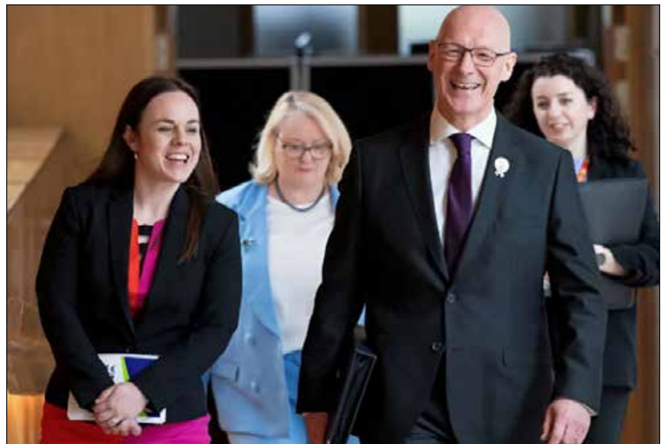
JOHN SWINNEY: said Scotland could only “move on” if it became independent.

backbencher Mick Whitley called her move “outrageous,” adding Ms Elphicke did not share the “values of the Labour movement”.