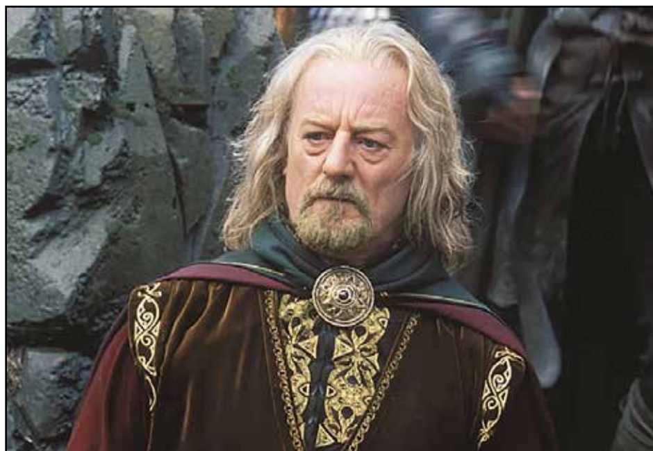
Hill was best known to younger audiences as Theoden in Lord of the Rings

"We worked together in John, Paul, George, Ringo and Bert, [by] Willy Russell marvellous show 1974-1975. A really marvellous actor. It was a privilege to have crossed paths with him.