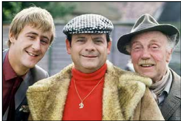
WOULD YOU ADAM-AND-EVE IT? more than 25% of Brits don't know the insult 'plonker'