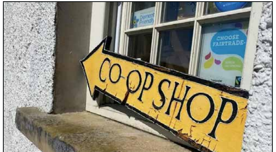
STILL OPEN: With Rathlin's very low crime rate, the incident has shocked people.

member in the shop, said she has been worried for weeks about its future.