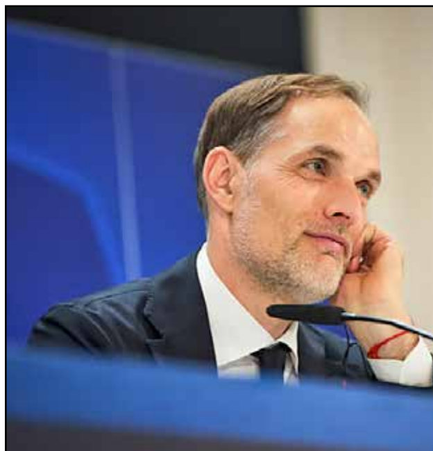
TUCHEL: "I loved it in the Premier League"

When asked about a possible return to the Premier League this week, Tuchel told reporters: "I'd rather not answer but it is no secret that I loved it at Chelsea.