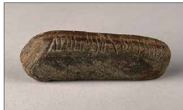
RUNE FOR IMPROVEMENT: the Ogham stone