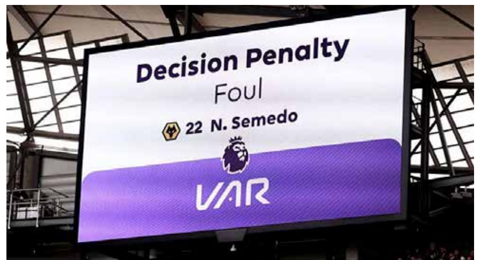
VAR was introduced in the Premier League at the start of the 2019-20 season

"I want to be successful at this football club, it's why I was brought in. So what other people, how they want to feel, and what their priorities are, are of zero interest to me."