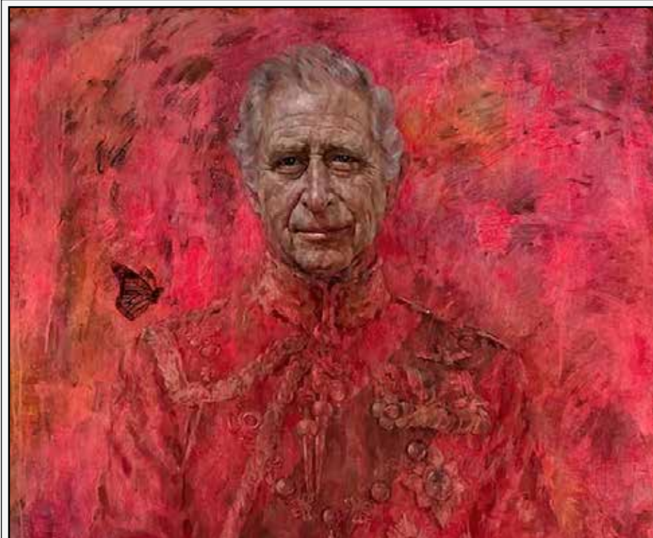
DIVIDING OPINION: the new official portrait of the King