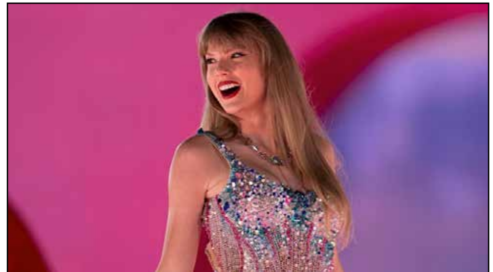
Swift has 15 UK tour dates in June and August –

(14%) is so invested in Swift's personal life that they have even started listening to her boyfriend Travis Kelce's podcast New Heights , and the same proportion admit to having streamed his American football games because Swift was in the crowd.