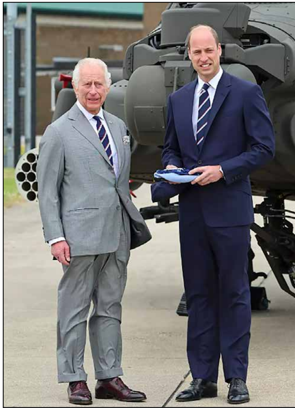
LIKE FATHER, LIKE SON: Charles and William at the official handover of Colonel-in-Chief title in Hampshire on Monday

He and his father last undertook an official public engagement together when they met members of the public during a walkabout among the crowds following the death of Queen Elizabeth.