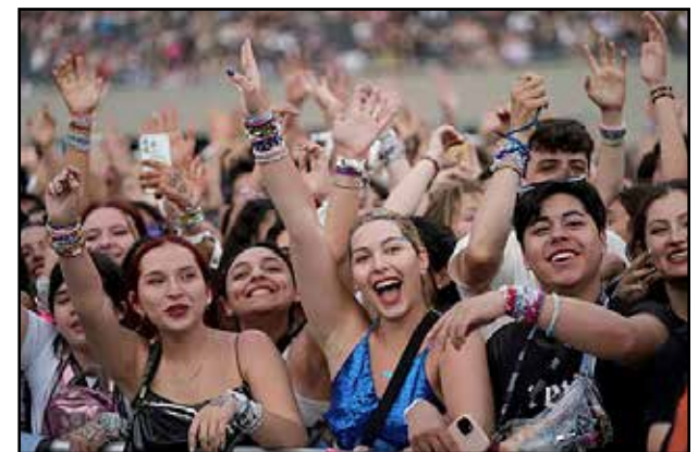
THEY JUST CAN'T GET ENOUGH: Swifties will spend an average of £848 on tickets, travel and outfits

"There's growing evidence that spending on experiences boosts happiness and well-being more so than purchasing physical items, especially if that experience is shared with friends and loved