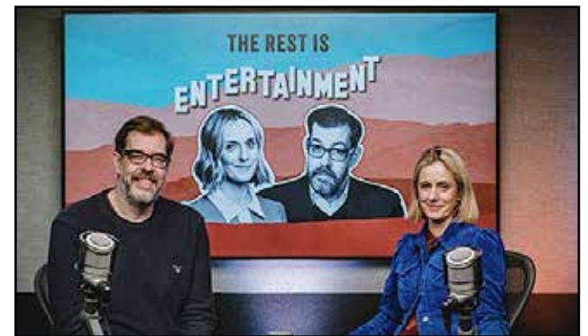
GOSSIP AND CHEMISTRY: Richard Osman and Marina Hyde front The Rest is Entertainment

And then of course there is The Rest is Football , hosted by Lineker, Alan Shearer and Micah Richards, and our personal favorite, The Rest is Entertainment , hosted by Richard Osman and Marina Hyde. Osman is an English author, TV presenter, producer, novelist and comedian, and former presenter of the BBC Two quiz shows Two Tribes and Richard Osman's House of Games . Hyde is a veteran journalist and longtime columnist for The Guardian . The witty chemistry of the two and the inside knowledge of the often-grubby workings of showbiz make for an engaging and slightly addictive podcast, and their TV and book recommendations also can't be beat. It was this duo who first turned this columnist onto Netflix's show of the year, Baby Reindeer , as well as the excellent Robbie Williams documentary on Netflix and the unmissable documentary on the life of snooker legend Ronnie O'Sullivan, The Edge of Everything , now streaming on HBO Max. Another hidden