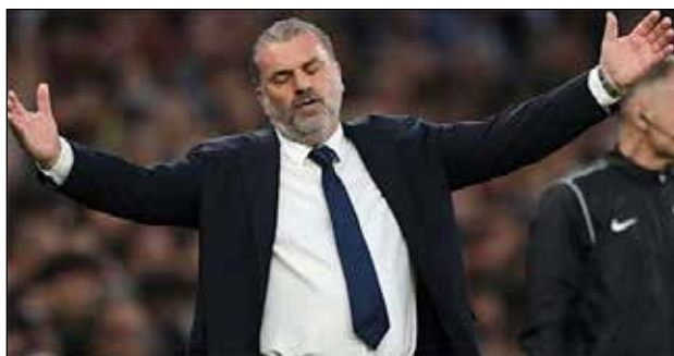
HE'S NOT HAPPY: Ange Postecoglou

Postecoglou's side needed to beat City at Tottenham Hotspur Stadium to keep hopes of a top-four finish alive, but lost 2-0.