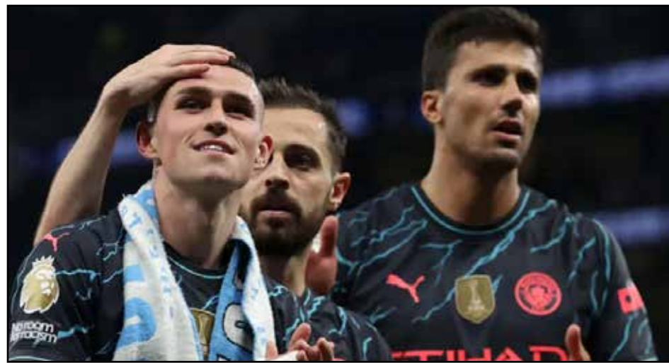
Manchester City went top of the Premier League win a win at Spurs on Tuesday

of such significance that Guardiola threw himself on the turf in sheer relief.