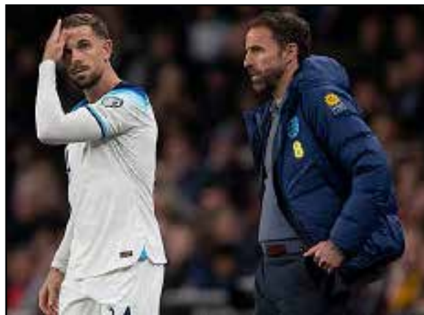
Henderson misses his first major tournament since 2012

Southgate continued to pick him following his move to the Saudi Pro League, though he was booed by