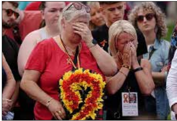
Infected blood campaigners in Parliament Square ahead of the public inquiry's report this week

"People put their trust in doctors and the government to keep them safe, and that trust was betrayed, "And then the government compounded the agony