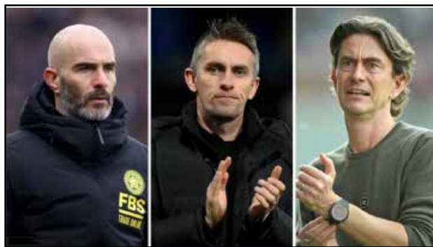
POISONED CHALICE? Enzo Maresca, Kieran McKenna and Thomas Frank have all won promotion to the Premier League as managers

Manchester United are also reportedly interested in McKenna, who would cost more than £4m in compensation.