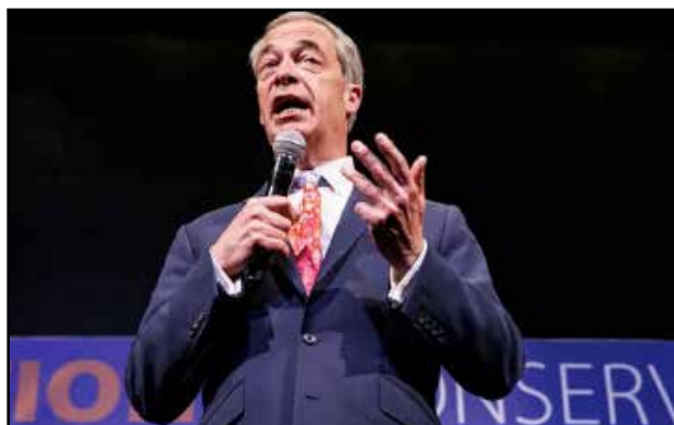
FARAGE: vowed to "do my bit to help"

Mr Farage said he would be "100 per cent behind" Mr Tice