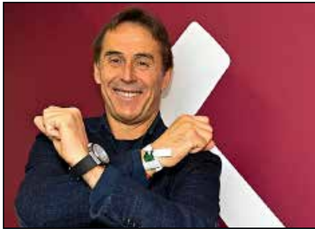
Pedigree, chum: Lopetegui coached both Spain and Real Madrid

Earlier this month, West Ham confirmed Moyes, who took over for his second spell at the club in December 2019 and won the Europa Conference League in 2023, would leave at the end of the season.