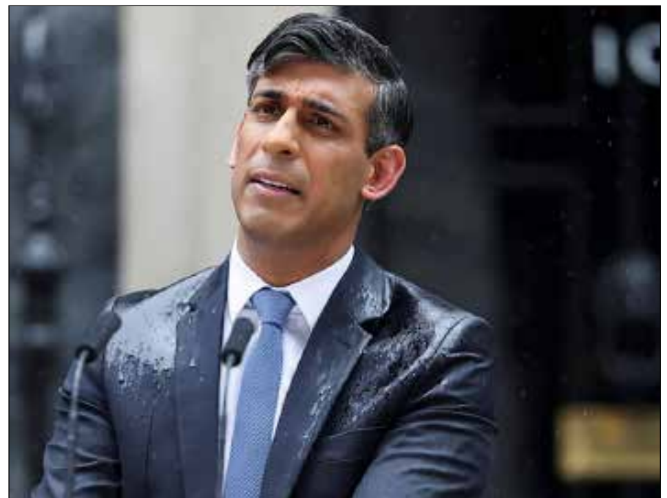
SUNAK: "Now is the moment for Britain to choose its future and to decide whether we want to build on the progress we have made, or risk going back to square one."

"If you don't have the conviction to stick to anything you say, if you don't have the courage to tell people what you want to do, and if you don't have a plan, how can you possibly