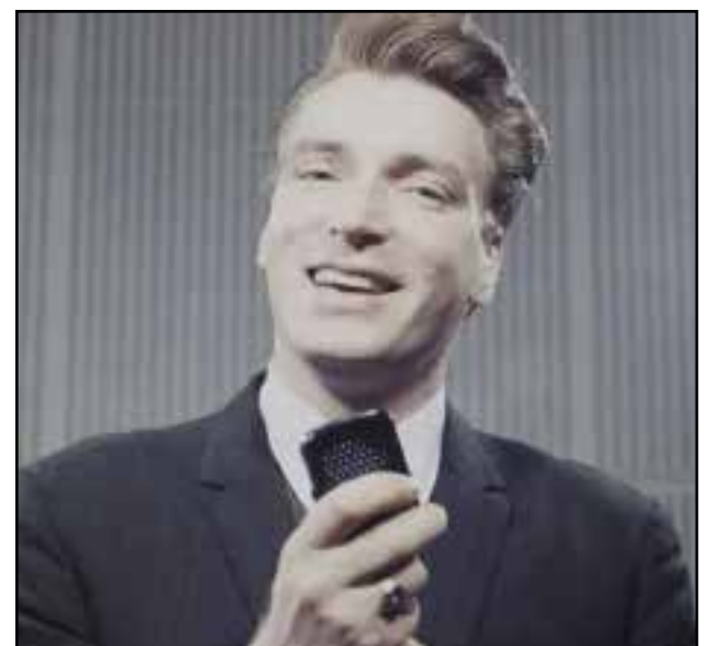
IFIELD: three consecutive number ones in the UK

After demobbing, he travelled back to the UK,