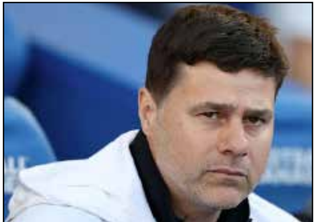
POCH: "the club (Chelsea) is now well positioned"

"The club is now well positioned to keep moving forward in the