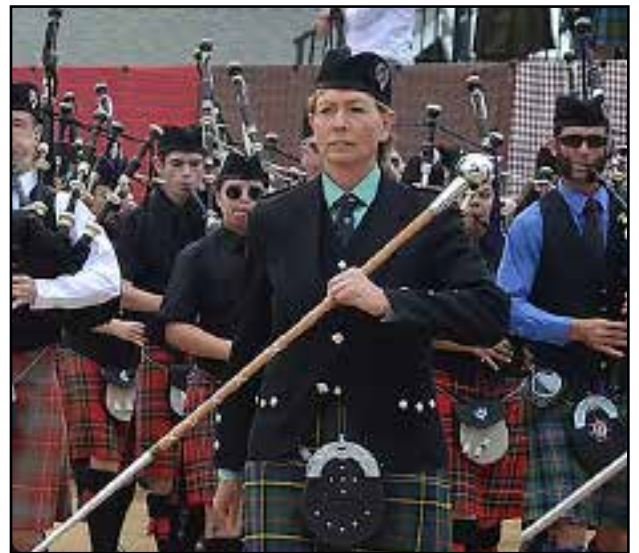
Visitors can enjoy Celtic music, piping and drumming competitions at the Scottish Fest

WHETHER you are Scottish, wish you were, or just love all things north of the border, you will find plenty to enjoy at the Scottish Fest, this weekend (Sat. May 25th and Sun. May 26th, 10am-5.30pm), at the Orange County Fairgrounds in Costa Mesa.