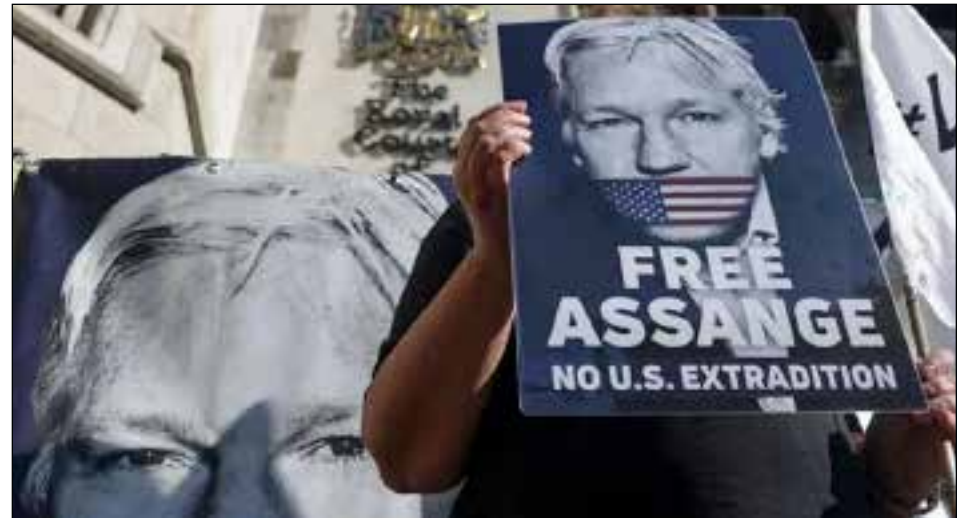
Assange is currently being held at Belmarsh Prison

had gathered outside the court ahead of the ruling, and supporters of Mr Assange cheered as news of the decision filtered through.