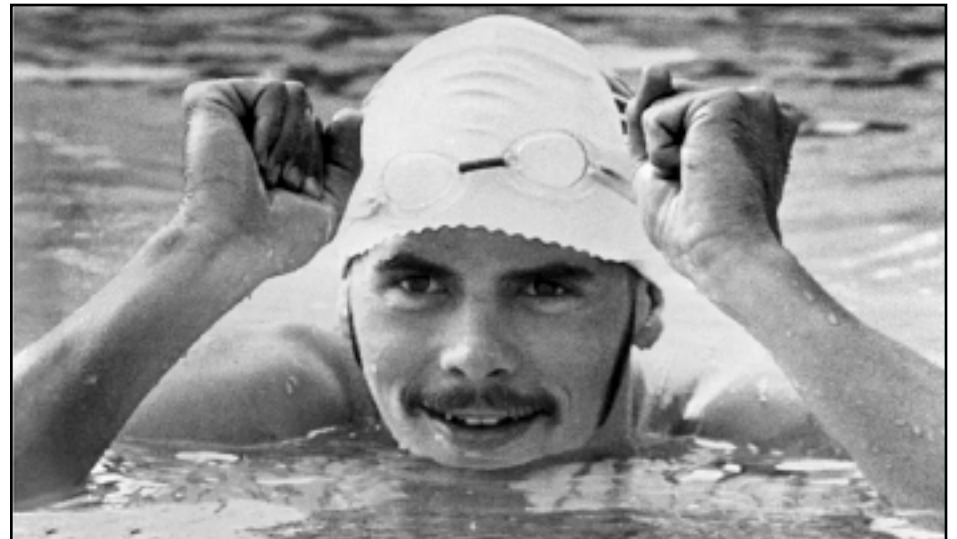
David Wilkie retired from swimming at 22 and became a successful businessman

Wilkie added three more Commonwealth medals for Scotland, including two golds, in 1974.