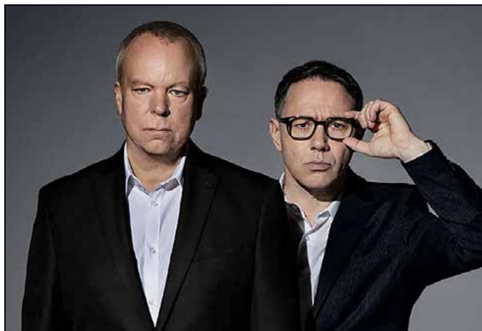
Pemberton and Shearsmith debuted their show in 2014, and it is currently midway through its ninth and final season in the UK

in storytelling, offering viewers a deliciously dark and inventive experience. Season One got me hooked from the first episode with its collection of intricately woven narratives, showcasing the creators' talent for seamlessly blending genres such as horror, comedy, and drama. From a seemingly mundane dinner party with sinister secrets to a mysterious costume party where nothing is as it seems, the first season sets the stage for the unpredictable twists and turns that lie ahead. Key to the show's knack of hooking a viewer is the writers' ability to load their characters with depth and backstory in a matter of seconds.