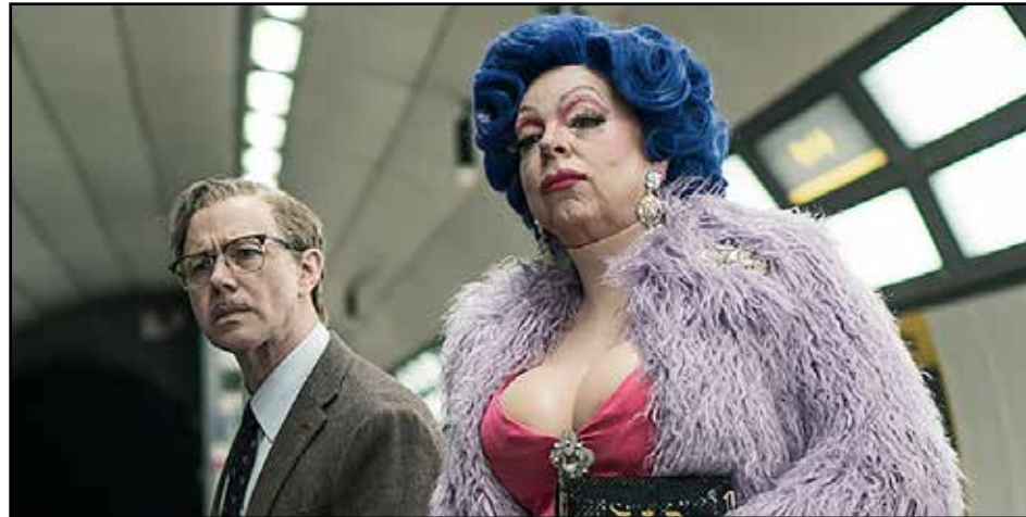
LIVING THE WORK: Reece Shearsmith and Steve Pemberton star in many of the episodes of Inside No 9, now available on Amazon Prime

Date of birth: May 14th 2024 Time: 14.13 Gender: F Weight: 7lbs 10oz Length: 20 in Born at Kaiser in Baldwin Park