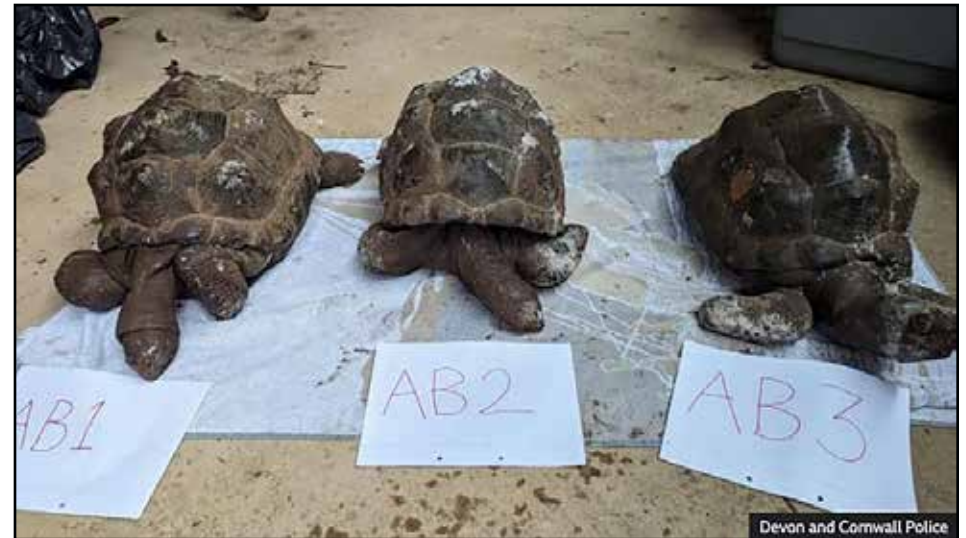
Following the discovery of the bodies earlier this year, Devon and Cornwall Police issued an appeal for information which led to the culprit being identified

Sentencing him to 50 hours of unpaid work,