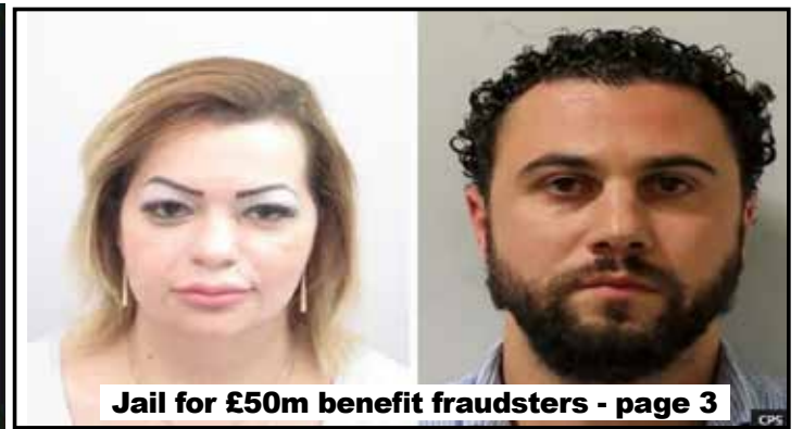
Jail for £50m benefit fraudsters - page 3