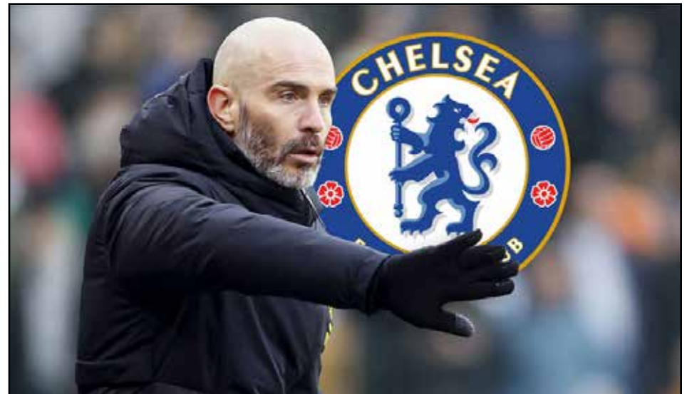
Maresca has impressed in guiding Leicester City back to the Premier League