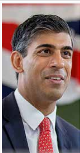
SUNAK: Hail Mary?

■ The five person gang made thousands of false claims for Universal Credit between 2016 and 2021