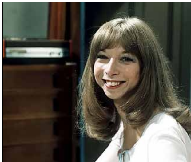
THE WAY SHE WAS: Helen Worth joined the show as Gail Rodwell in 1974