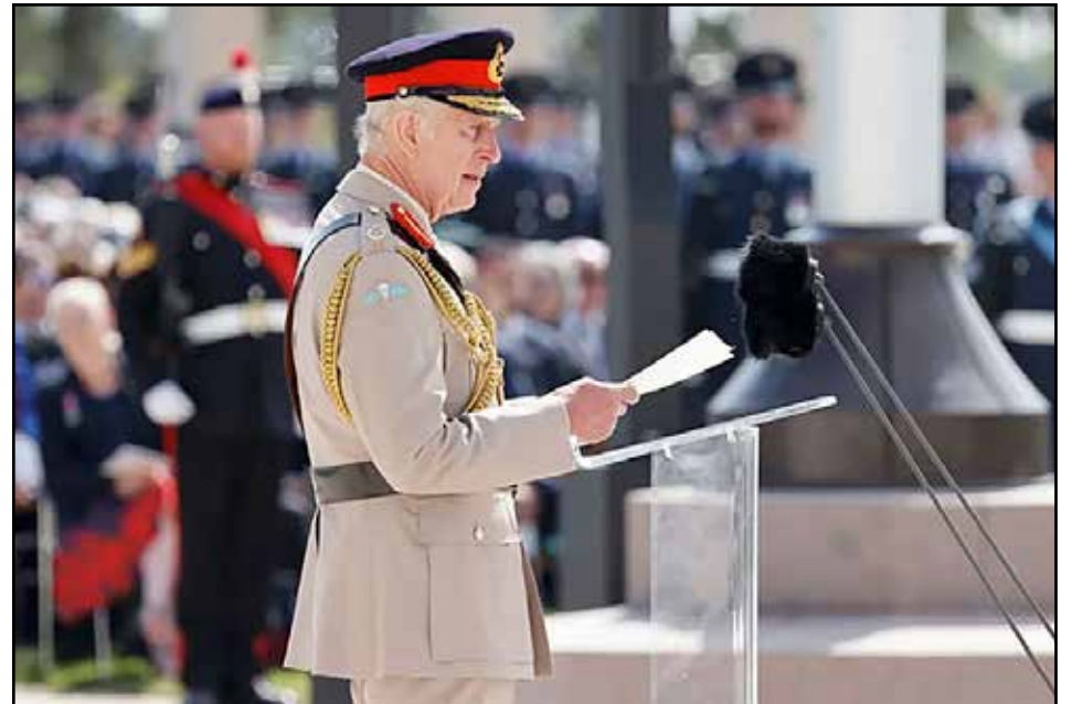
CHARLES: "Our obligation to remember them, what they stood for, and what they achieved for us all, can never diminish"