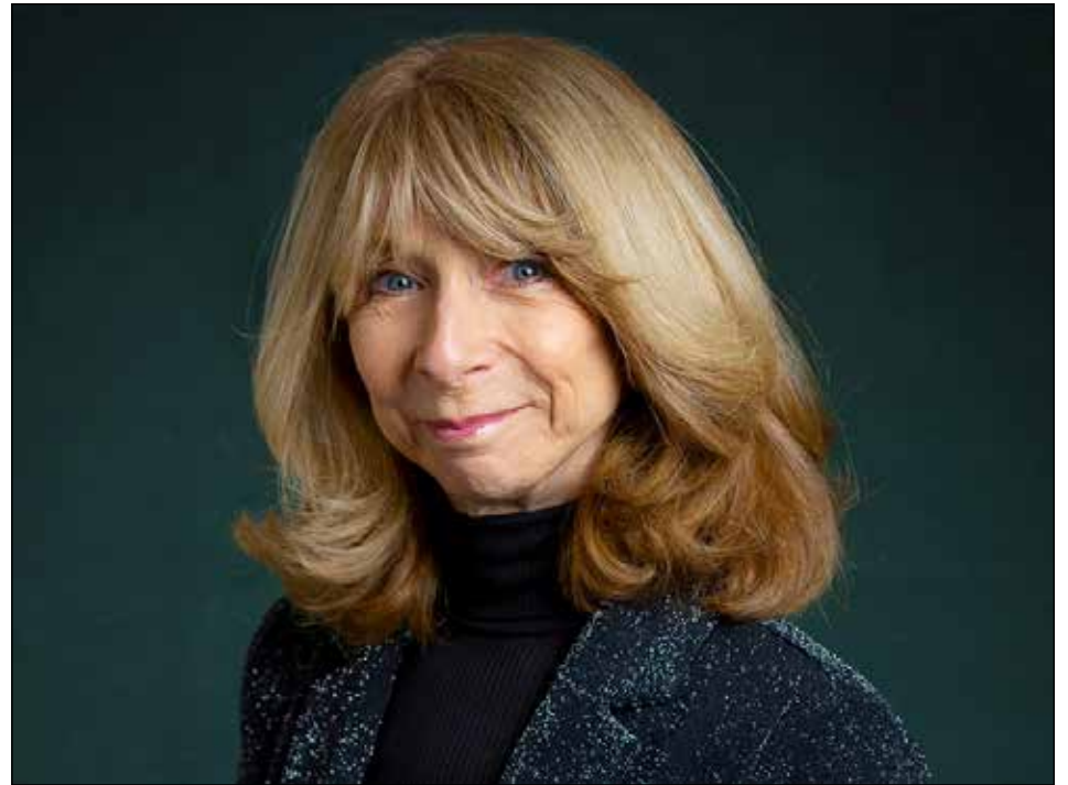
Helen Worth described her long spell on Coronation Street as 'the most wonderful job on the most wonderful street in the world'.

"Her ill-fated marriage to Richard Hillman was one of the most