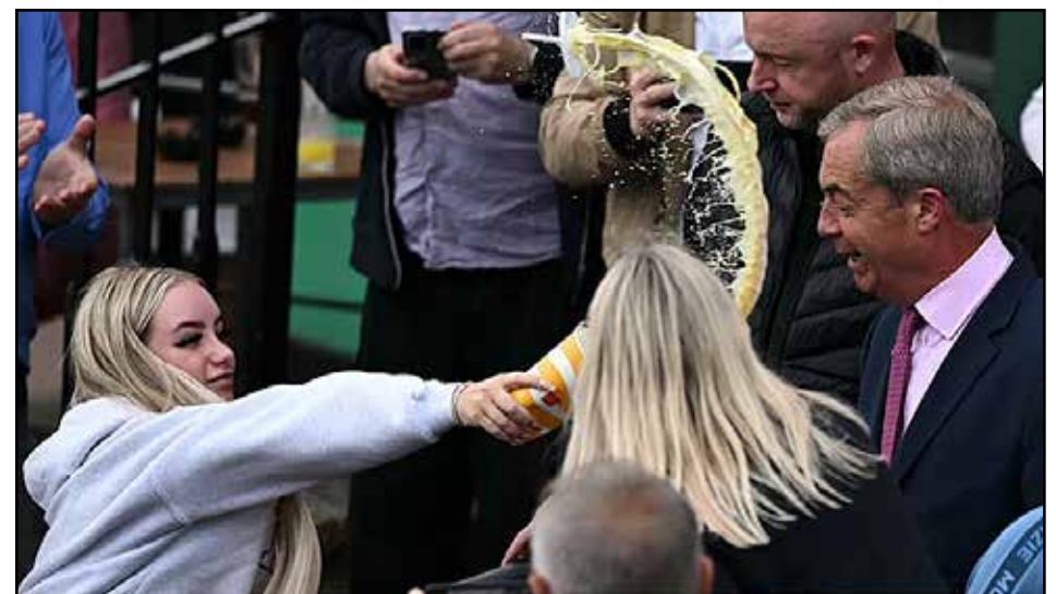
NOT A FAN: Farage gets the milk shake treatment in Clacton on Monday

In a stunning return to frontline politics, the Brexiteer vowed to lead