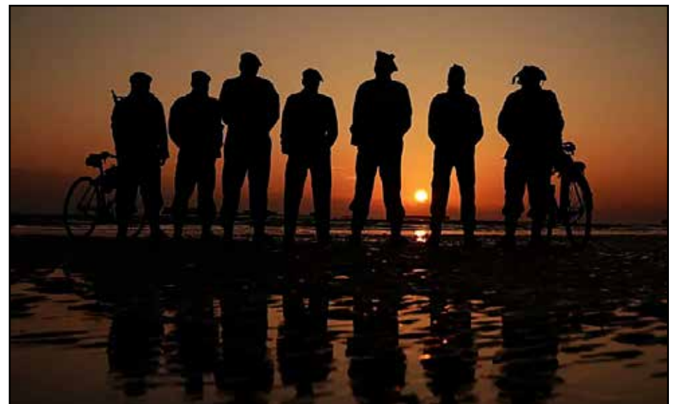
May the sun never set on their memory: British servicemen at Gold Beach

Omaha Beach, President Biden said that what happened 80 years ago in Normandy did not absolve modern