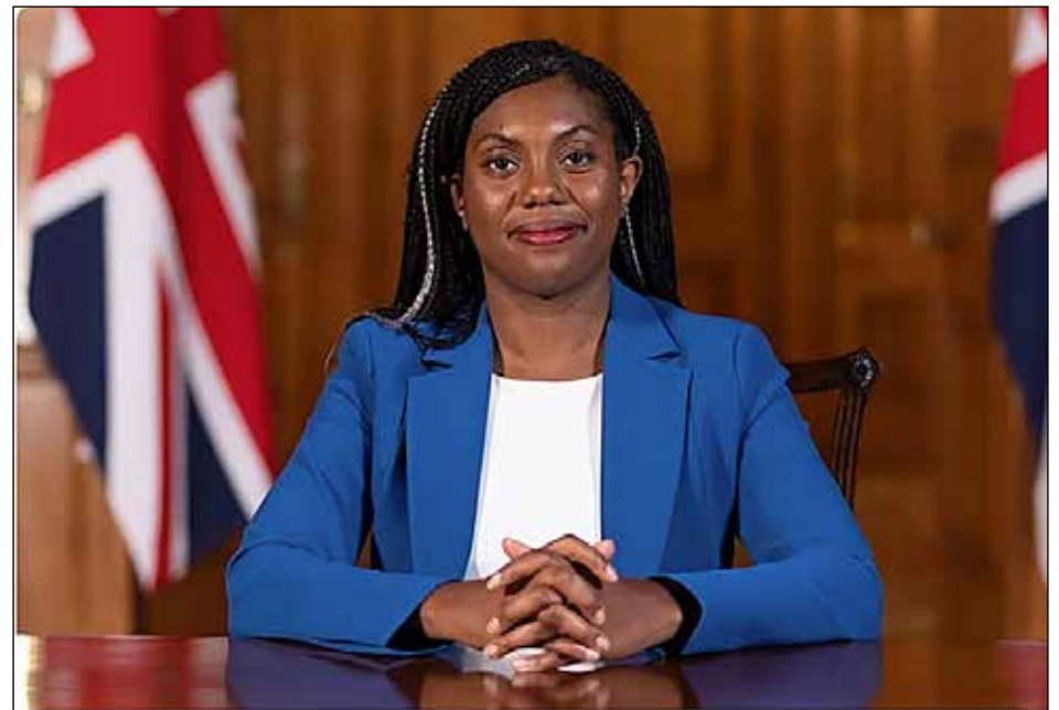
Kemi Badenoch, Minister For Women and Equalities, said her party would clarify that ‘sex in the law means biological sex and not new, redefined meanings of the word.’

Announcing on the Tories’ pledge, Equalities Minister Kemi Badenoch said: “Whether it is rapists being housed in women’s prisons, or instances of men playing