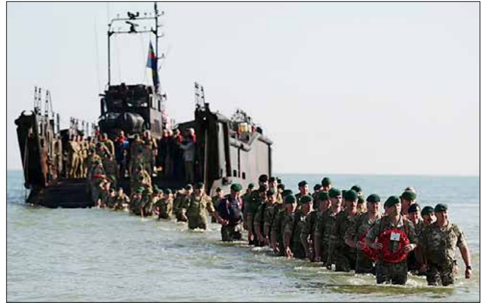
The Royal Marines of 47 Commando bearing a wreath while landing on the beach at Asnelles in Normandy on Thursday

The King addressed veterans at the British Normandy Memorial in Ver-sur-Mer, saying allies had faced the “supreme test” 80 years ago and we are fortunate the D-Day generation did not flinch when “the moment came to face that test”.