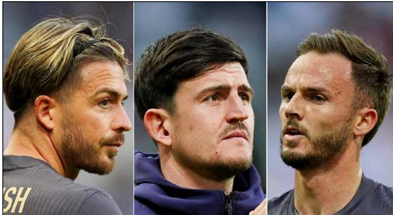
THREE GUTTED LIONS: "All the players took the decisions respectfully," said Southgate

"That meant people were waiting for bad news and we tried to do that as respectfully and with as much on the human side as possible. For the players not coming with us, it's a devastating blow and a difficult day for them and for their team-mates."