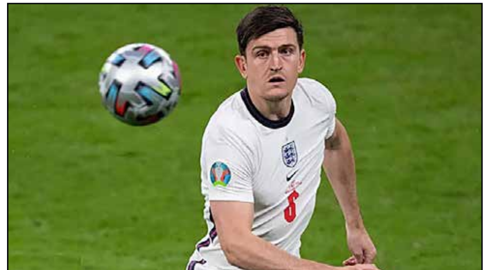
MAGUIRE: "For me, representing England is the highest honour"

He said: "I'm devastated not to have been selected to play for England at the Euros this summer. Despite my best efforts, I've not been able to overcome an injury to my calf. Maybe I pushed myself too hard, to try and make it. Simply, I am absolutely