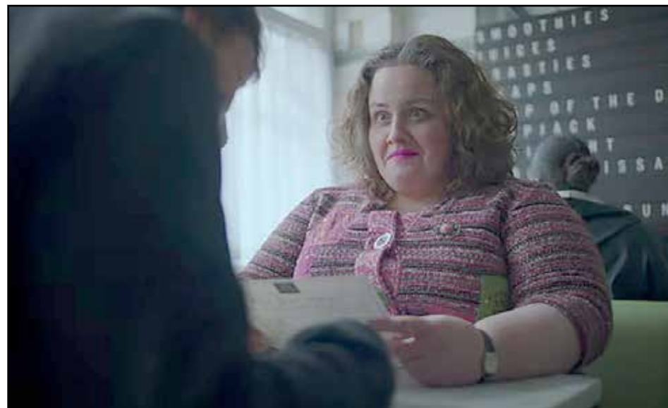
The plaintiff is rumored to be the real-life Martha Scott — the stalker played by Jessica Gunning (above) in the worldwide Netflix hit