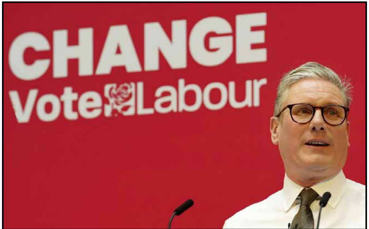
Sir Keir Starmer: “running to be prime minister, not a candidate to run the circus”.

After his speech was briefly interrupted by heckling from a climate protester, he said: “We gave up on being a party