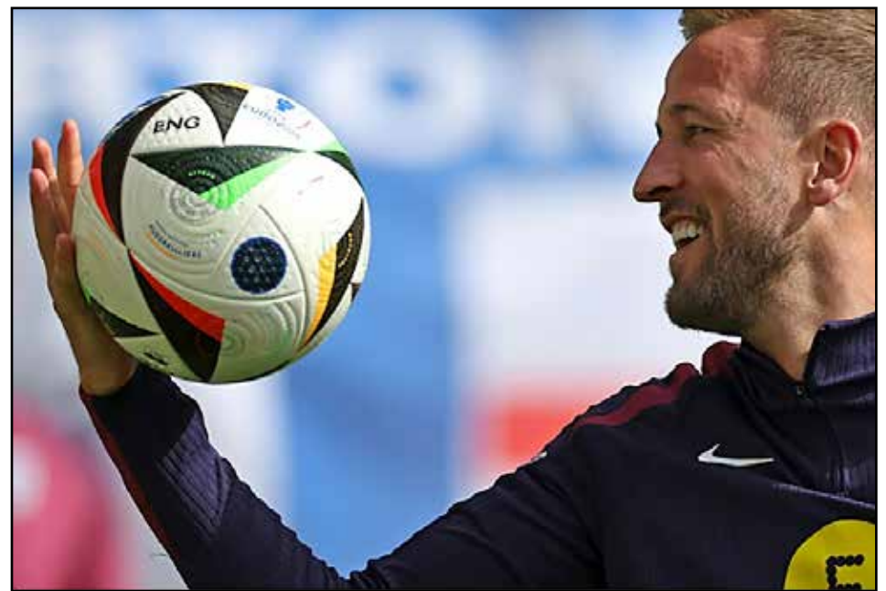
England have 'a lot of fantastic players' said Harry Kane on Thursday

"Being England manager is not easy – you have a lot of tough decisions, a lot of players to