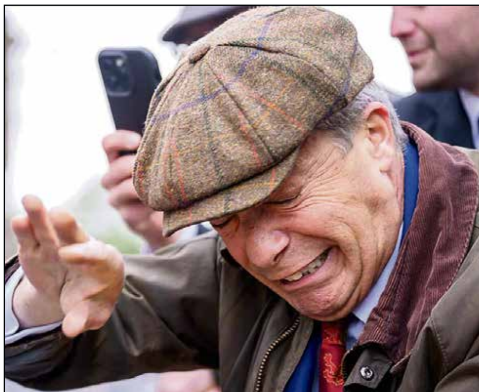
TAKING COVER: Nigel Farage dodges a missile in Barnsley this week