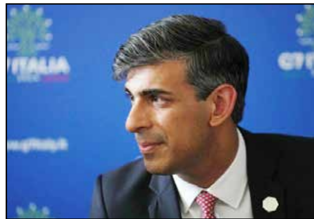
Sunak: vowing to halve migration

Mr Sunak said: "Keir Starmer simply can't tell you what he would do with people who come here illegally because he doesn't believe it's a problem. With Brexit we took control of our bor-