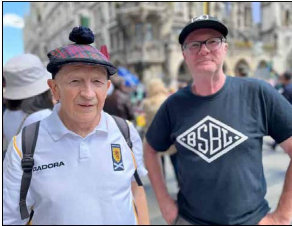
WORTH THE WAIT? Scotland face hosts Germany in the opening match