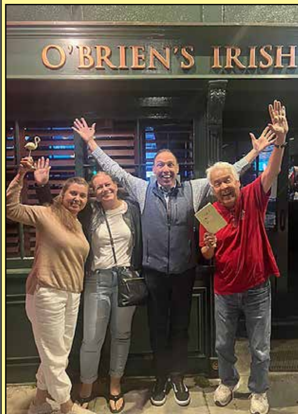
One of the best nights out in Los Angeles, Brits in LA Pub Quiz continues to pull in the crowds each Tuesday at O'Briens in Santa Monica.