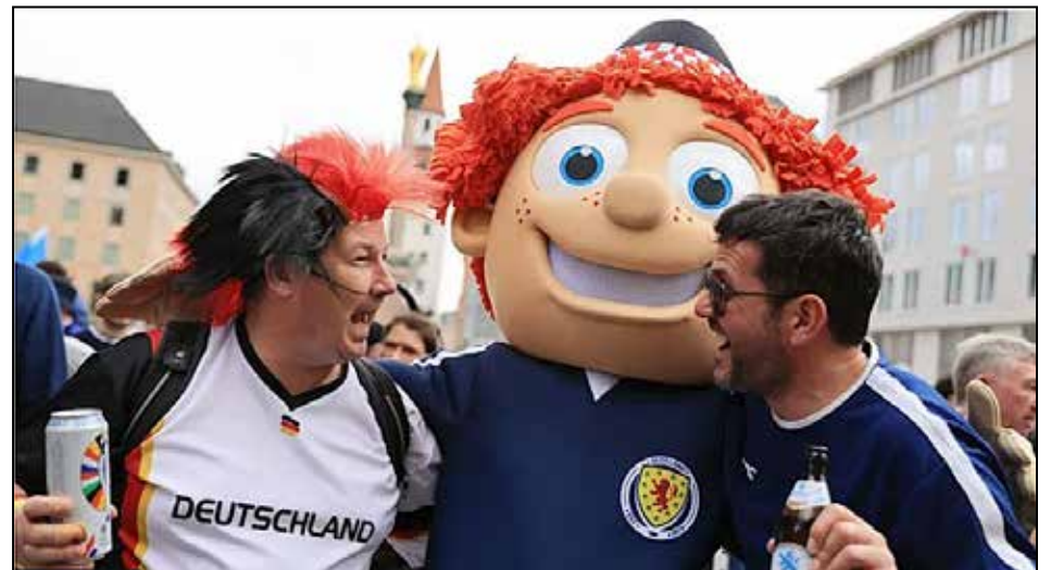
Getting intae the spirit: Scottish fans in Munich