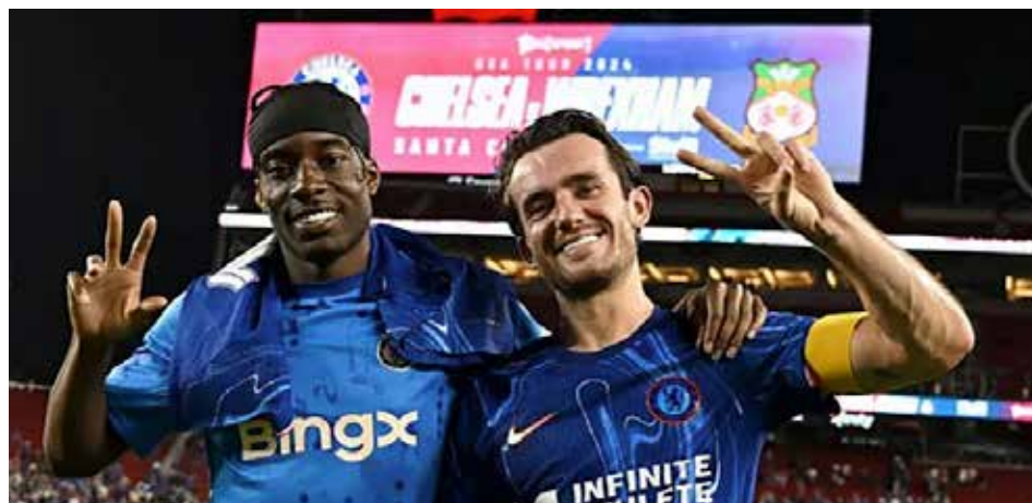
Chelsea's Noni Madueke and Ben Chilwell after their unimpressive 2-2 draw with Wrexham in Santa Clara on Thursday

retired in 2019 following two hip surgeries. His last ATP tournament victory came at Antwerp in October 2019.