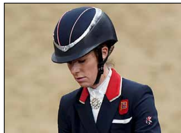
DUJARDIN: winner of six Olympic medals

The FEI said Dujardin confirmed she was the individual in the video which was "filmed several years ago" and "re-