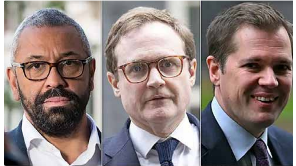
James Cleverly, Tom Tugendhat and Robert Jenrick are all in the running

His campaign manager, Tory MP Danny Kruger,