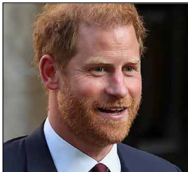
HARRY: featured in "Tabloids On Trial" in the UK

Harry has previously referred to the lawsuits