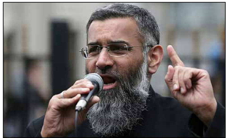
Anjem Choudary was described by police as a ‘shameless, prolific radicalizer’. He was convicted in South London this week and will be sentenced July 30

The conviction followed investigations by the Metropolitan police, the New York police department (NYPD), and the Royal Canadian Mounted