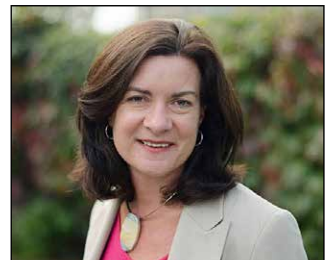
Eluned Morgan is poised to replace Vaughan Gething, who stepped down earlier this month

Her appointment follows the resignation of Vaughan Gething, who announced his departure