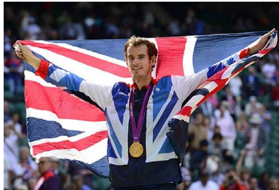
HIS FINEST HOUR: Murray celebrates his Wimbledon win in 2012

Murray's triumph at London 2012, where he won in the final with a straight-sets victory over Roger Federer, was his first major title. He followed it up by lifting his first Grand Slam title a month later, this time