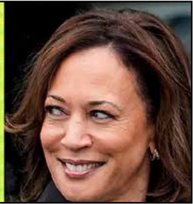
It's a Brat summer for Kamala - page 10

California's British Accent™ - Since 1984