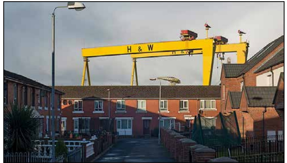
Towering over the landscape: H&W's famed gantry cranes, Samson and Goliath

Ending the use of the Bibby Stockholm, it says, forms part of the expected £7.7 billion of savings in asylum costs over the next 10 years, as the Home Secretary pledges to take action to 'restart asylum case working, clear the back-