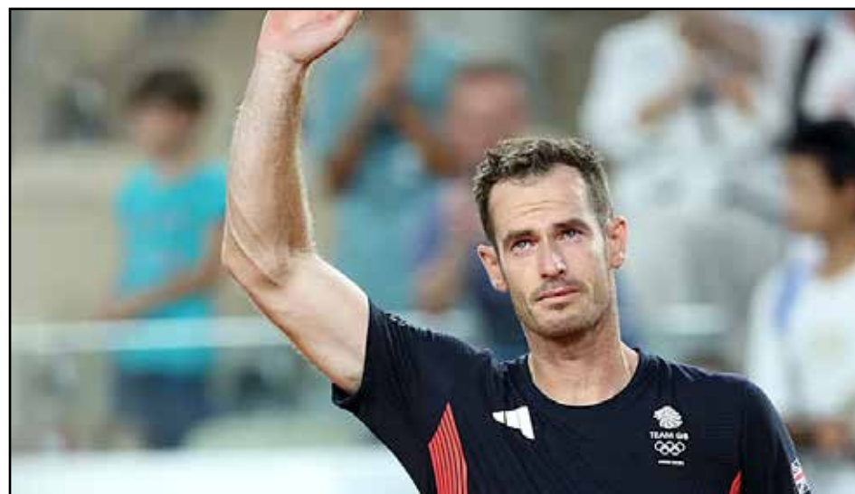
HE WILL BE MISSED: Andy Murray bows out at the Roland Garros on Thursday

On the eve of the 2019 Australian Open, Murray broke down in a pre-tournament news conference when he revealed he would have to retire because of impending hip resurfacing surgery, which he thought would