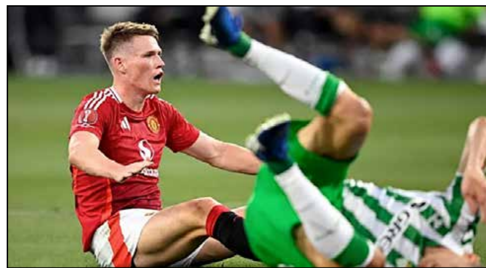
McTominay is now 27 and wants regular first-team football

stood to prefer the sale to a club outside of English football so have opted to accept a lower bid, rather than the £45m being discussed with Aston Villa in June. It remains unclear whether Gallagher will accept a move overseas but the Londoners are ready to sell with less than one year remaining on his current deal. He is believed to have turned down a three-year contract, structured in a two-year deal with an option for an extra year, in June. Gallagher could also opt to leave the club on a free transfer next summer and has previously had interest from Tottenham, West Ham and Everton.