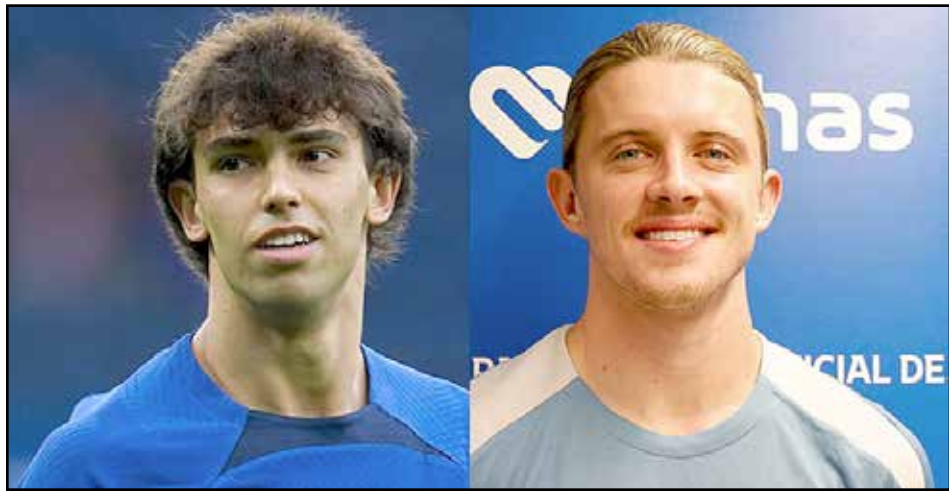
HELLO GOODBYE: Felix and Gallagher are going in different directions

Chelsea have signed Portugal forward Joao Felix from Atletico Madrid for a fee in the region of £45m, with England midfielder Conor Gallagher going the other way for about £33m. Felix, 24, who has signed a seven-year deal to begin a second spell at Stamford Bridge, scored four goals in 20 appearances during a loan spell in west London in 2023. "I'm really happy to be back at Chelsea and I can't wait to get started," said Felix. "I can see some familiar faces from the last time I was here, which is always nice." Gallagher meanwhile has signed a five-year contract with the Spanish top-flight club. Gallagher joined Chelsea at the age of six and went on to make 90 appearances, scoring 10 goals. He had entered the fi-