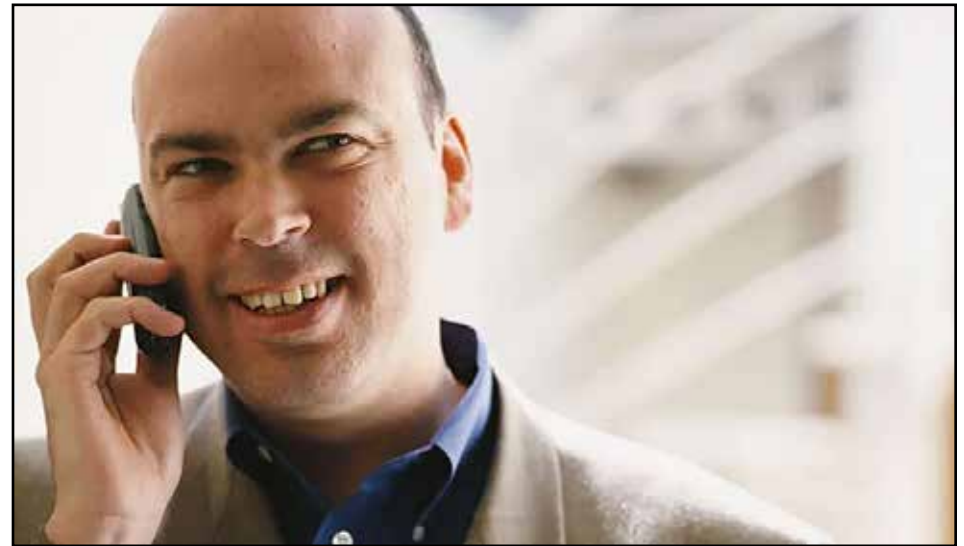
HIGH ACHIEVER: Mr Lynch was awarded an OBE in 2006

Mr Lynch was awarded an OBE in 2006, took a seat on the BBC board, became an adviser to former PM David Cameron and a multi-million-pound sponsor of the Mercedes Formula One team as well as Tottenham Hotspur. In his spare time, he built model railways and bred koi carp while indulging a passion for James Bond, driving an