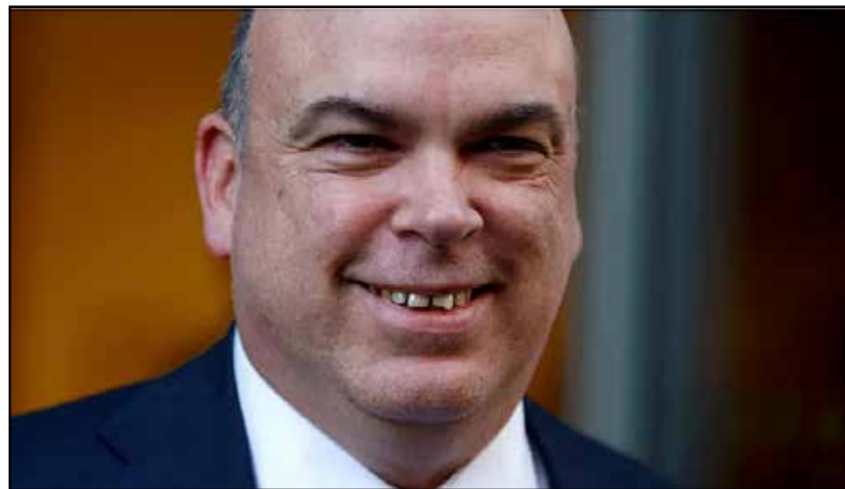
Autonomy founder Mike Lynch was described as “the Steve Jobs of Britain”

co-founded the British tech firm Autonomy. In 2011, Lynch made his riches by selling his company to US computing giant Hewlett-Packard (HP) for $11bn (£8.6bn).