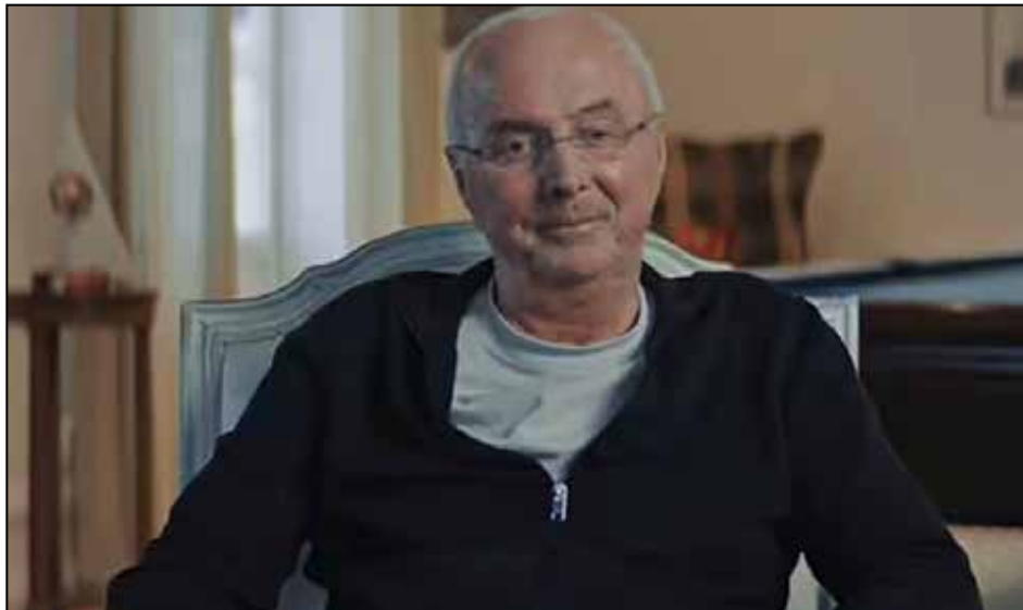
Sven-Goran Eriksson has issued a heartfelt goodbye message to the public

thing, coaches, players, the crowds, it's been fantastic. Take care of yourself and take care of your life. And live it. Bye."