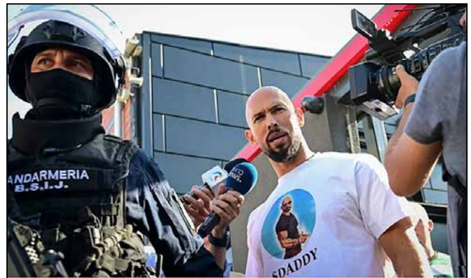
Andrew Tate (center) was taken in custody late Wednesday night

The same man is accused of repeatedly having sexual relations with a girl who was 15 years old when they met.