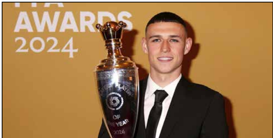
Foden picked up his PFA Player of the Year Award on Tuesday night. "Last season was another very special one for everyone at the club, but now all our focus is on trying to achieve more success this term."

chester after the England star helped City win a fourth consecutive title last season. That comes on top of Foden also being crowned Football Writers' Association Footballer of the Year – and Bunny Shaw made it a clean sweep for City as she also collected both awards on the women's side of the game. City also had Erling Haaland, Kyle Walker and Rodri in the PFA Premier League Team of the Year, with all the awards voted by PFA members. Foden said: "To win