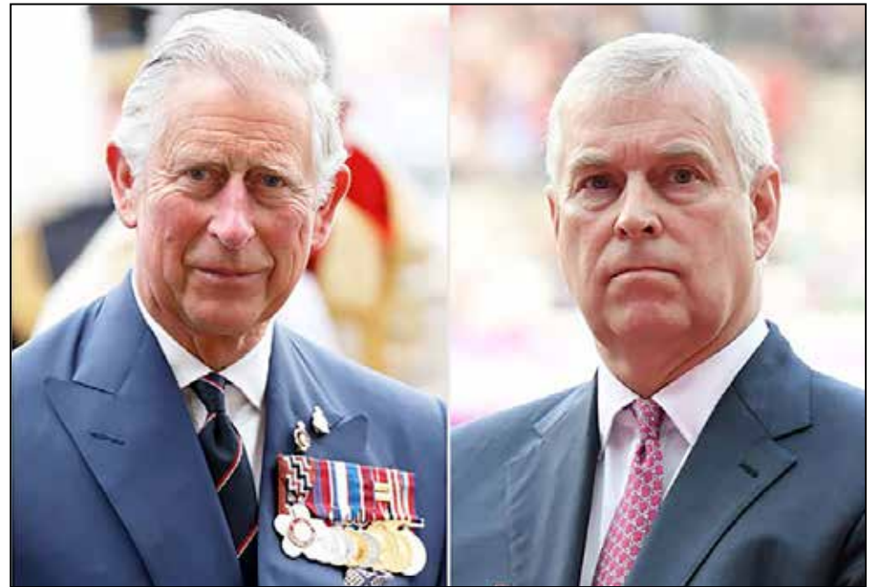
King Charles has been funding private guards at the sprawling Windsor estate where Andrew has been living, despite a long running attempt to evict him

Allies of the Duke claim his "cast iron" 75-year