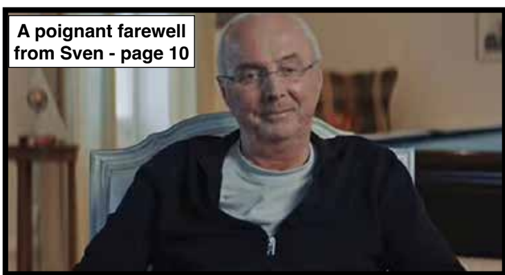
A poignant farewell from Sven - page 10