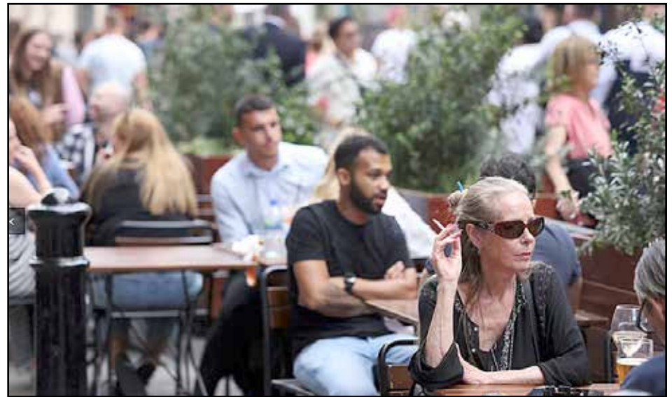
VERY BRITISH: but smoking on pub terraces could soon be a thing of the past

Health authorities also say there is no safe level of exposure to second-hand smoke.