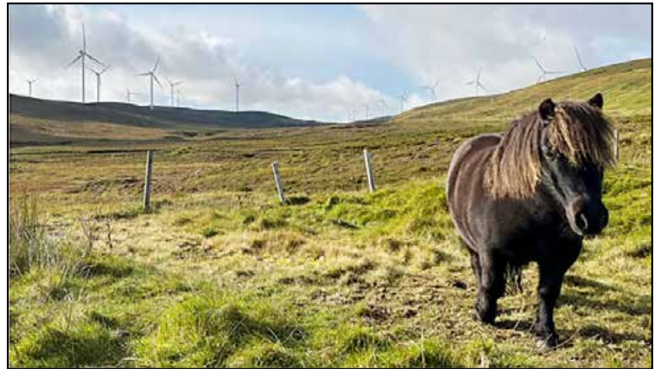
Locals are also worried about the turbines' impact on the landscape

Morag Lyall, chair of the environment and transport committee of Shetland Islands Council, said annual household bills in the islands were often more than double the UK average of £1,700 and showed no sign of falling as a result of hosting Viking.