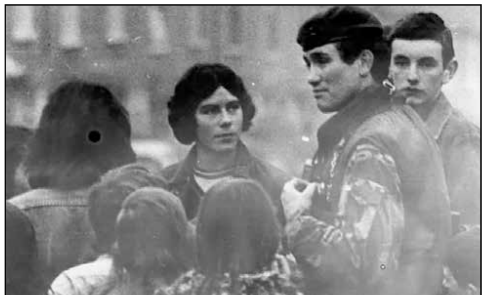
Capt Nairac pictured in Belfast's Ardoyne district in 1977

The Independent Commission for the Location of Victims' Remains (ICLVR), which has located the remains of a number of the "disappeared", said it would be its first