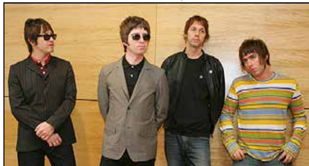
The way they were: Oasis in 2006