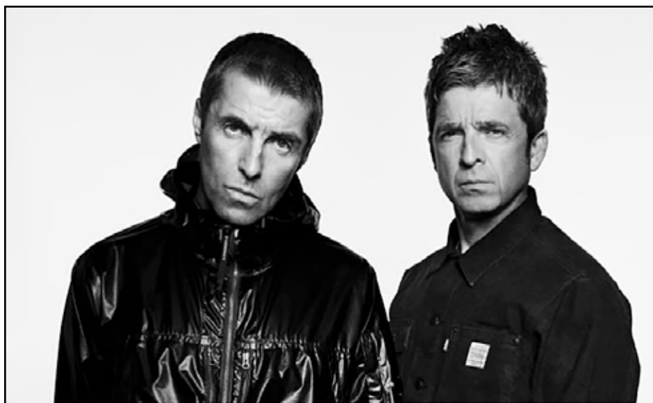
Liam and Noel Gallagher have announced a 14-date UK tour for next year

The Oasis lineup has not been confirmed; the band also have no plans to re-enter the recording studio to make new music. The Gallaghers had been teasing the news on social media in recent days, sharing a clip of the date "27.08.24" in the same font as the Oasis logo on their respective