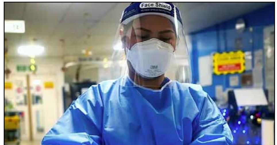
NHS workers were simply burnt out", the inquiry found

This included suspending elective care, such as hip and knee replacements. She also listed missed can-