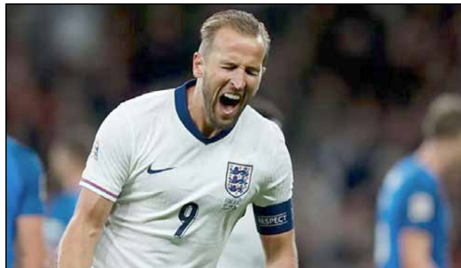
SEIZING THE MOMENT: 100 caps and two more goals for Harry Kane

Carsley has shown he is determined to do things his way, clearly wanting to impose a more dy-