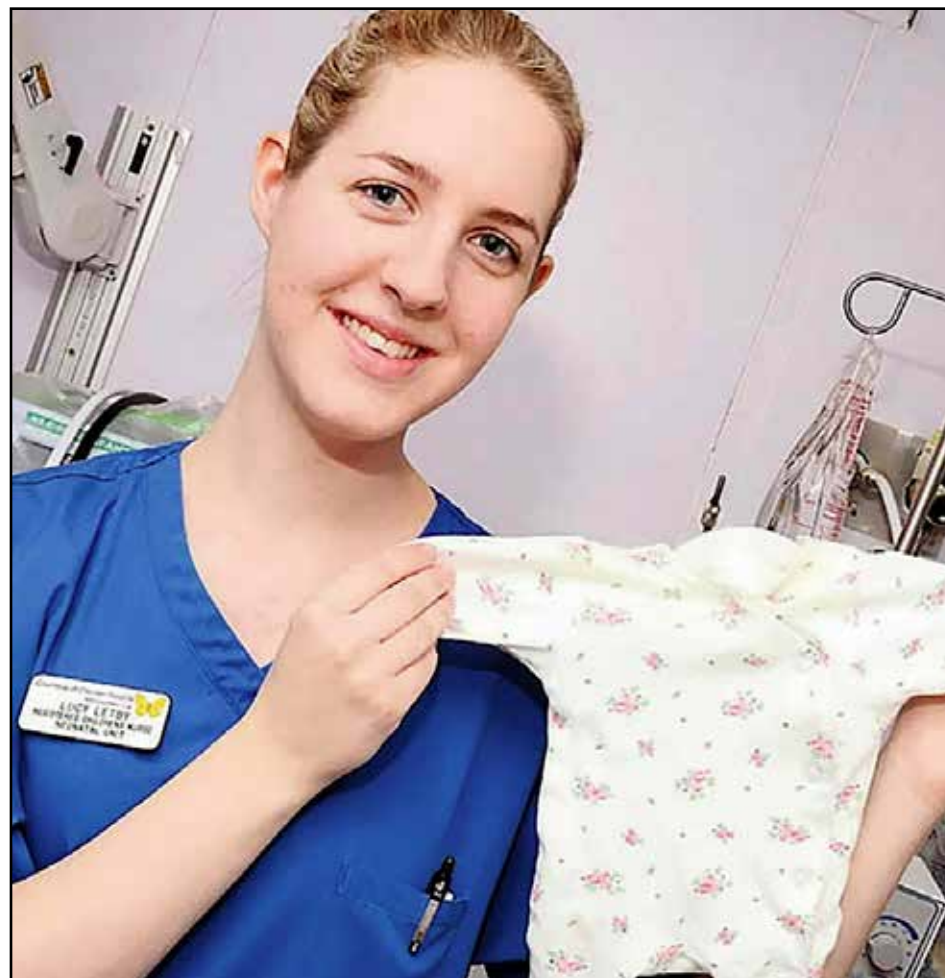
Letby was convicted of murdering seven babies and attempting to kill seven more at the Countess of Chester hospital's neo-natal unit

The inquiry continues and is expected to last nearly five months.