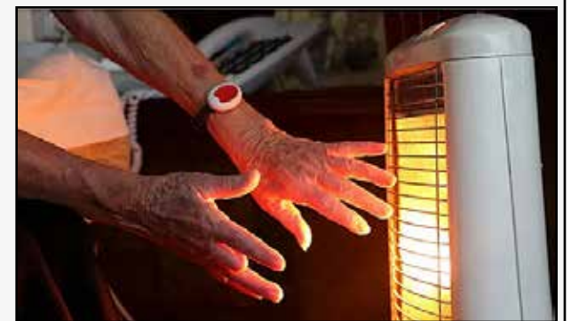
WINTER OF DISCONTENT? most probably

Shouts of "shame" were heard in the Commons chamber as the result was announced, which will mean the number of fuel payments will fall from 11.4 million to 1.5 million this winter.