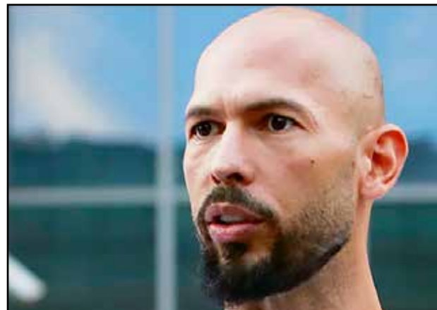
Andrew Tate: facing charges in Romania

Andrew Tate is currently under house arrest in Romania. In addition to the charges he already faces, prosecutors are considering new allegations against him, including having sex with a minor