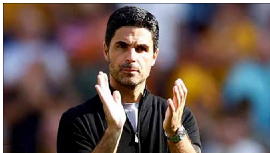
Arteta: "I want to do much more than what we've already done together."

"We saw after five minutes the pitch tore up and then it becomes about who can win the battle. It was close at times. If it was a boxing match, there were two teams out on their feet and we came out on top. Sometimes you take more pride from these wins."