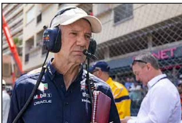
Pedigree: Newey is F1's most successful designer ever