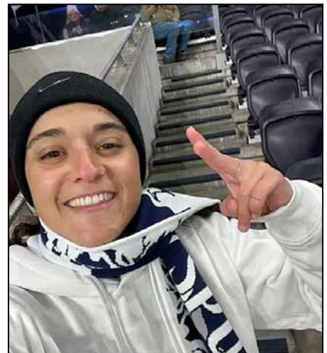
Emily Damari, 28, is a keen Spurs fan