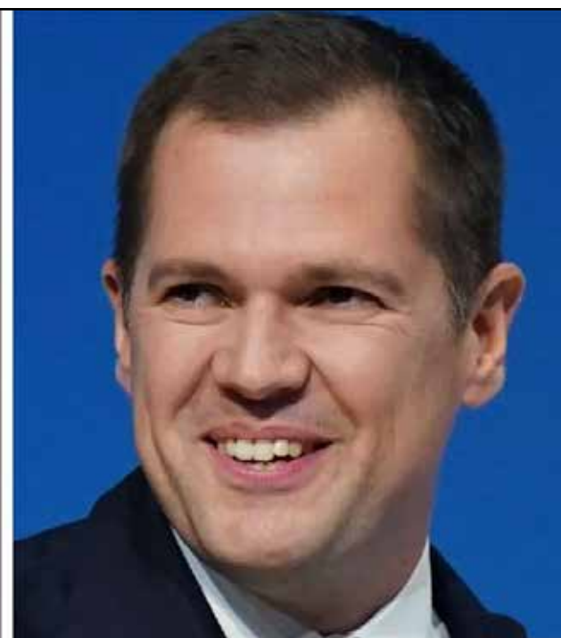
RIGHT AND RIGHTER: either Kemi Badenoch or Robert Jenrick will be the next Tory leader

everything, we need to talk about the system, which I think is broken".