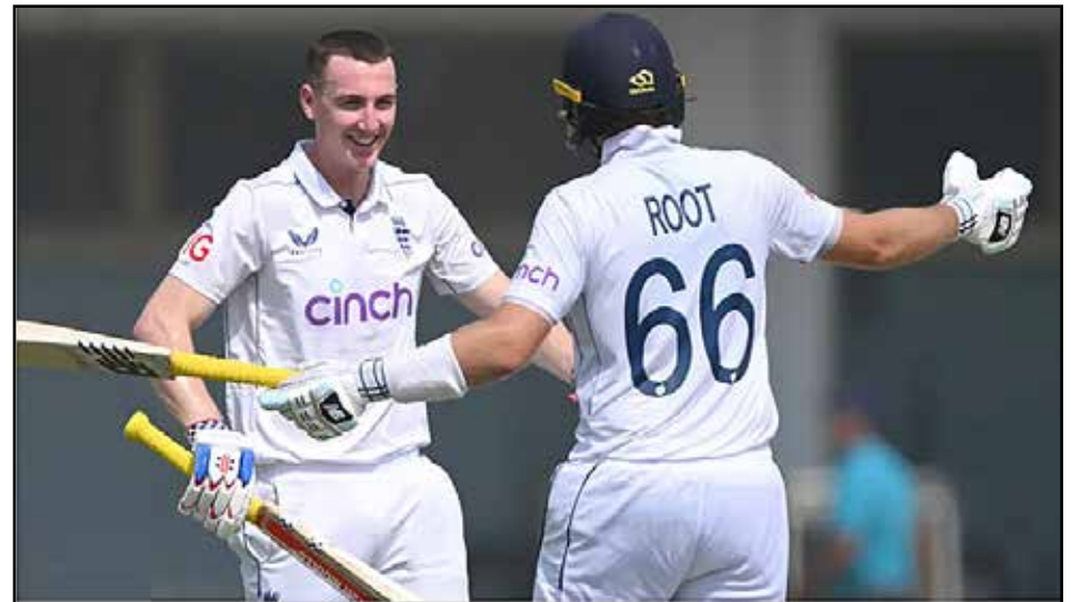
HISTORY BOYS: Harry Brook and Joe Root shared a jaw-dropping partnership of 454 in the First Test in Multan

and Brook added for the fourth-wicket is England's highest partnership for any wicket, the fourth-highest in all Test cricket and best for the fourth-wicket.