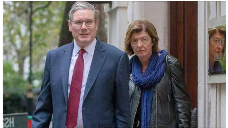
EXIT THE DISTRACTION: Sue Gray, seen here with the PM, has been caught up in rows over pay and donations since Labour came to power