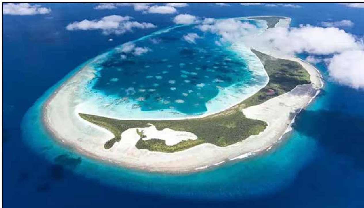
INCREDIBLY REMOTE...and strategically vital. While sovereignty will be handed back to Mauritius, the deal will also allow the continued use of Diego Garcia atoll as a US military base

US President Joe Biden welcomed the "historic agreement", saying it was a "clear demonstra-