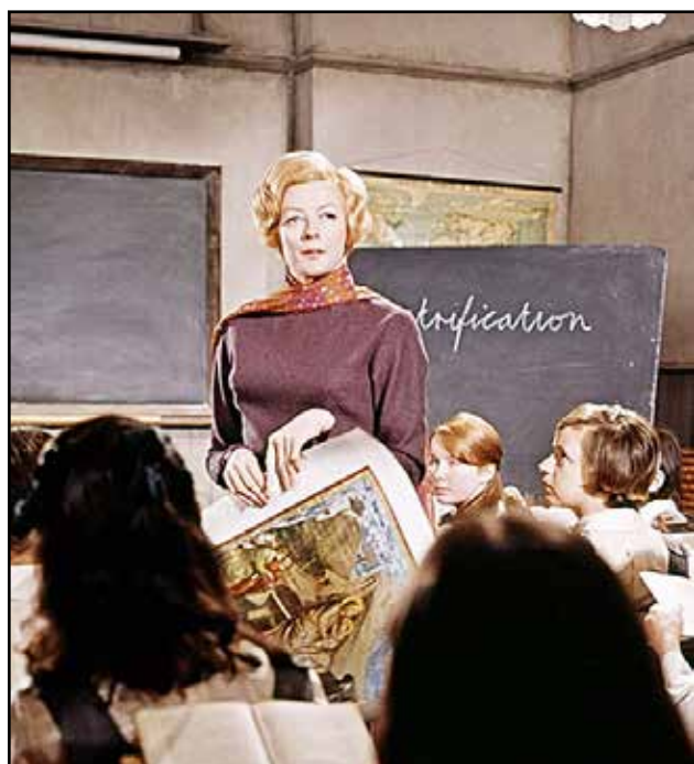
OSCAR WINNER: Smith took home the Best Actress Award in 1969 for The Prime of Miss Jean Brodie

Later in 1963, Laurence Olivier offered her the part of Desdemona opposite his Othello , at the