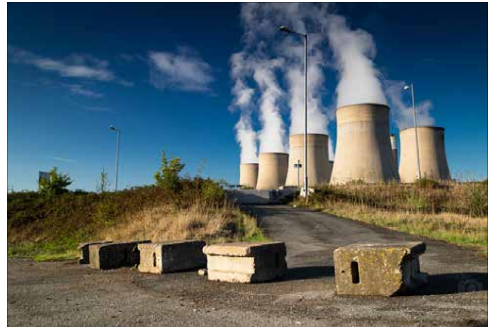
The Ratcliffe-on-Soar station: once a landmark, now a relic

Energy Minister Michael Shanks said the plant's closure "marks the end of an era and coal workers can be rightly proud of their work pow-