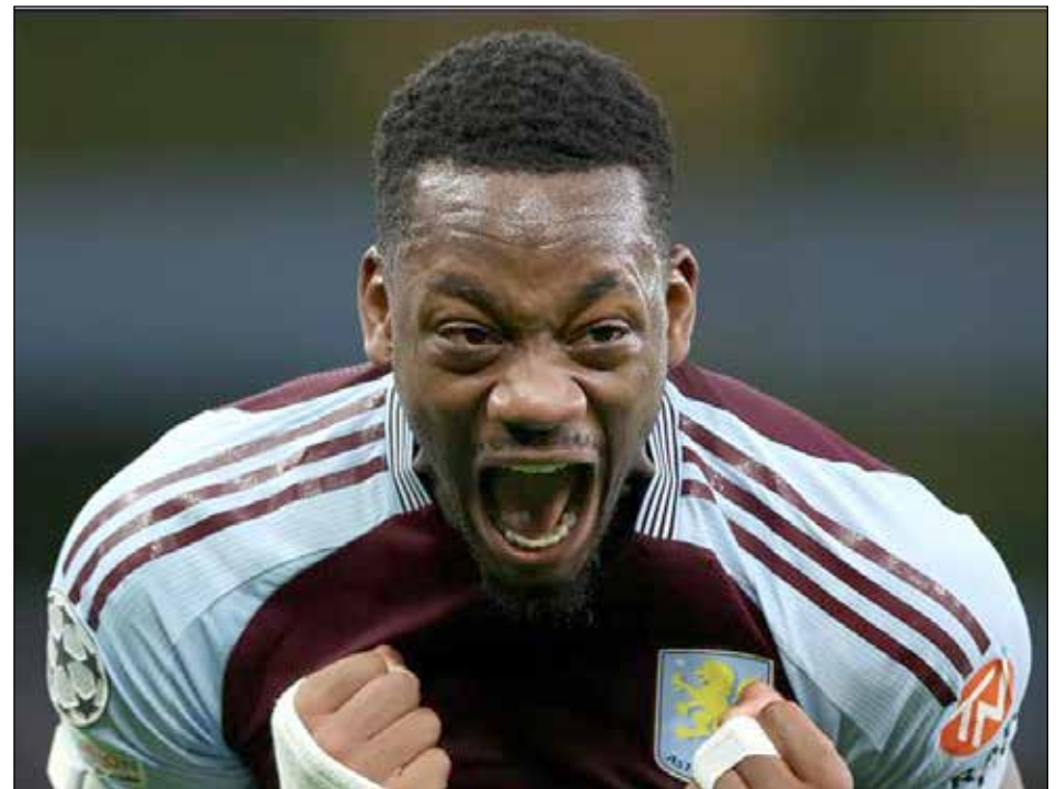
HUNGRY LIKE THE WOLF: Duran scored the only goal of the game for Villa

Villa were only three points off the relegation zone when Emery succeeded sacked Steven Gerrard in October 2022. The transformation has been remarkable.