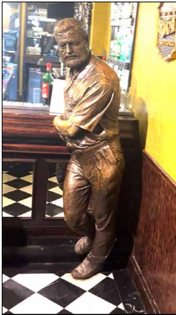
PAPA IN PAMPLONA: at the famed Cafe Iruna

The day dawned grey and threatening for our hike into the busy town of Pamplona. We had waterproof covers for our backpacks and the requisite cheap n' cheerful ponchos to ward off the rain. And boy, did we need them. The skies opened barely ten minutes after we left our hotel and we were dumped on for the best part of three hours. The dirt roads turned into mushy ponds and small streams, slowing our progress and dampening our spirits. But on the flip side, this was a