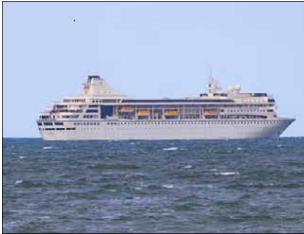
ALL AT SEA: The Villa Vie Odyssey had been stuck in Belfast for four months