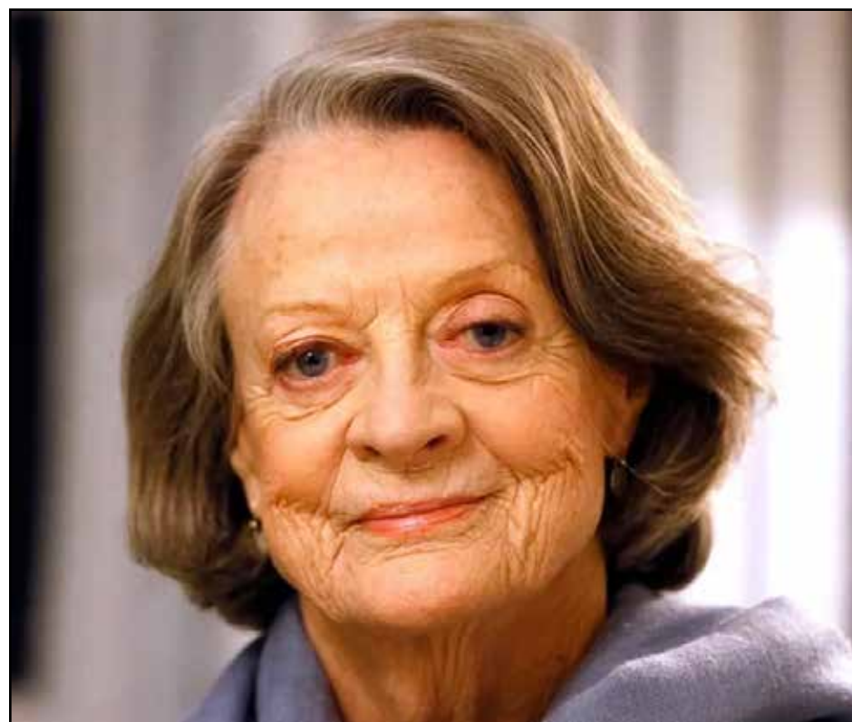
BEST OF BRITISH: Smith passed away on Friday at the age of 89

National Theatre. The production, with the original cast, was made into a film two years later, with Smith being nominated for an Academy Award.