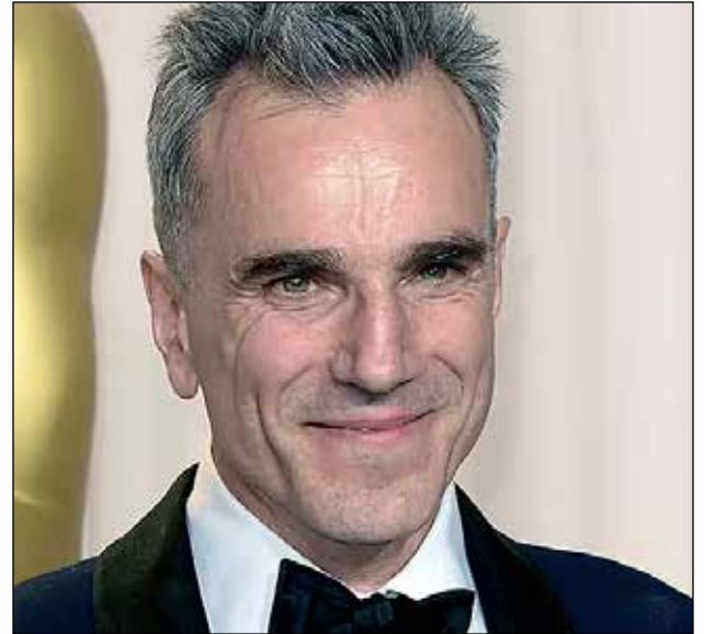
The multiple Oscar winner retired from acting in 2017

The 67-year-old British actor quit acting after starring in Paul Thomas Anderson's 2017 film Phantom Thread, and has largely stayed out of public life since.