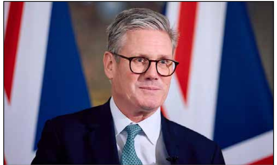
NO SLEAZE, PLEASE: Starmer is eager to snuff out allegations of financial impropriety