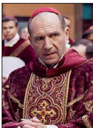
Nominated: Ralph Fiennes in Conclave

Kate Winslet is listed as best actress for both TV's The Regime and her film Lee , while Wicked lead Cynthia Erivo is nominated as best actress in a comedy or musical, for playing