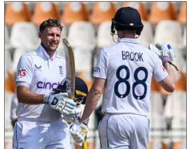
Main men: Joe Root and Harry Brook have excelled with the bat for England

Brook was more than happy to repay the compliment to Root, who hit the 36th century of his career in the second Test at Basin Reserve and has more runs than anyone in 2024 with 1,470.