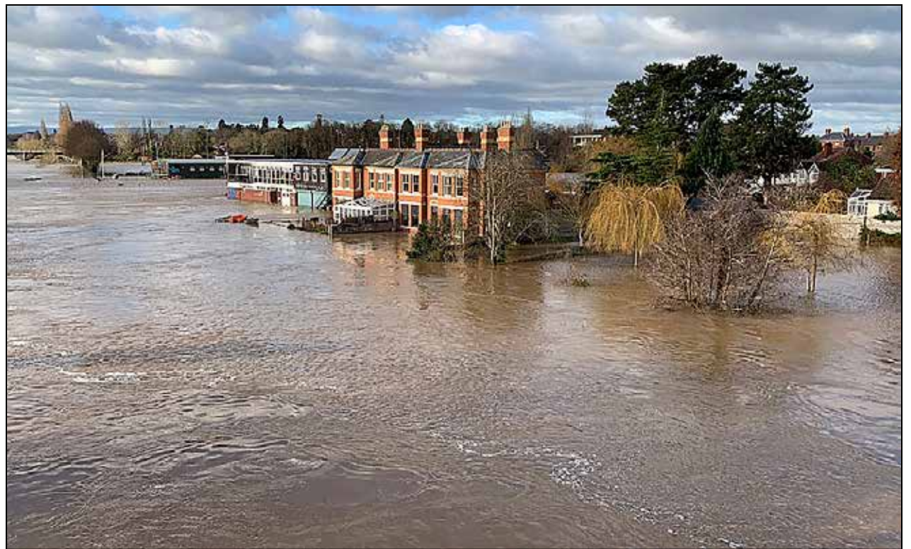
ALL WET: the picturesque Wye Valley in Herefordshire was particularly badly hit by the floods