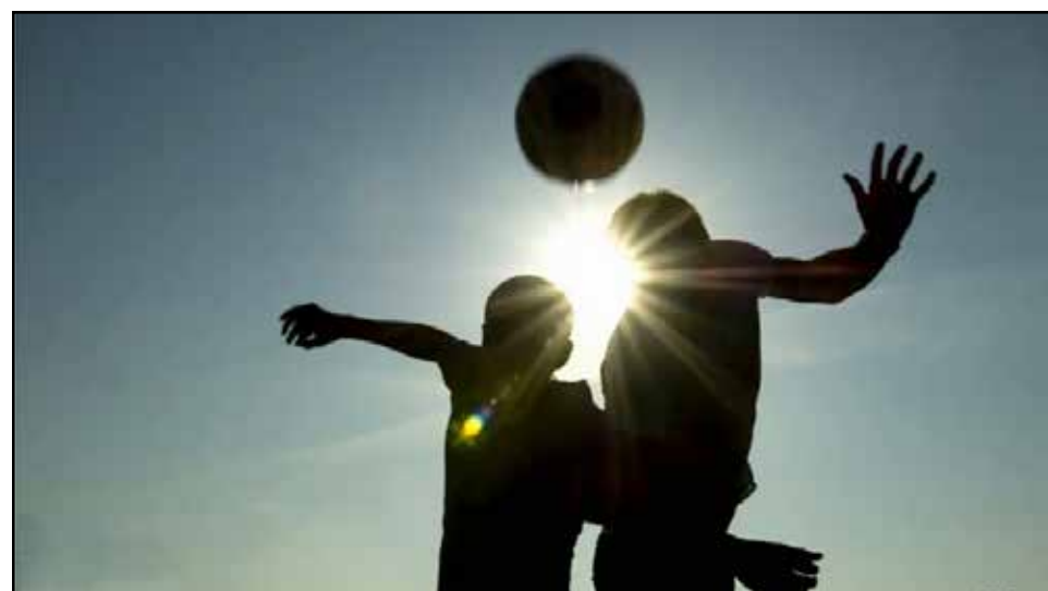
HEADED TOWARDS TROUBLE: footballers are three-and-a-half times more likely to die from a neurodegenerative disease than the normal population

"Now, we actually know, having looked at the data, that these other risk factors don't appear