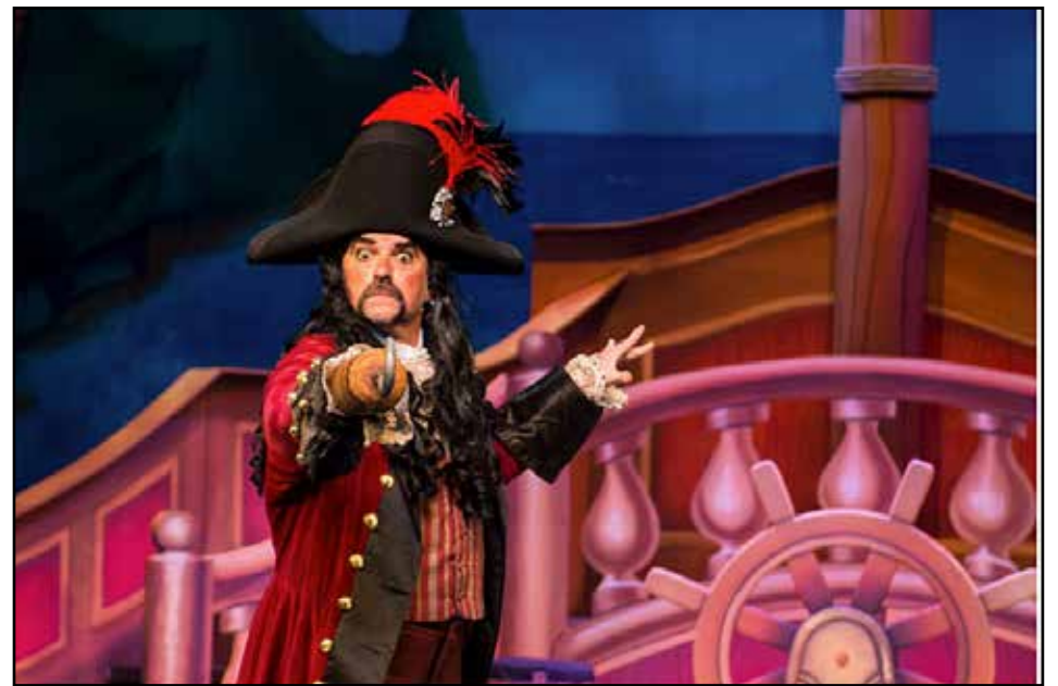
From Seinfeld to Panto: John O'Hurley stars as Captain Hook

"Whatever this story is that everybody knows, and they layer in popular music, they