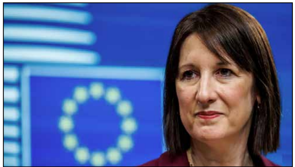
REEVES: the Chancellor will seek new trade negotiations in the new year

Following a speech to Eurogroup finance ministers in Brussels - the first given by a UK chancellor since Brexit - Reeves repeated that the UK would not rejoin the single mar-