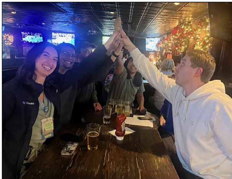
EYES UP HERE: the lucky winners of the humble potato celebrate