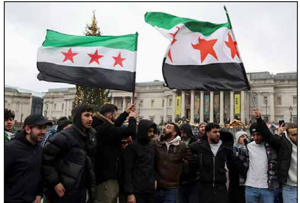
Syrian migrants gathered in Trafalgar Square this week to celebrate the sudden and unexpected overthrow of Bashar al-Assad

The Home Office will be hoping the end of the Assad dictatorship will see a sharp drop in the number of Syrians seeking sanctuary and that many already in Britain may now look to return to their homeland.