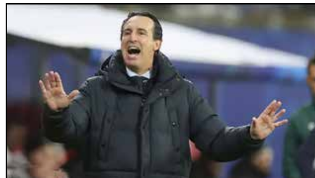
MASTER BUILDER: Villa coach Unai Emery

Watkins could have easily added a second soon after but he could