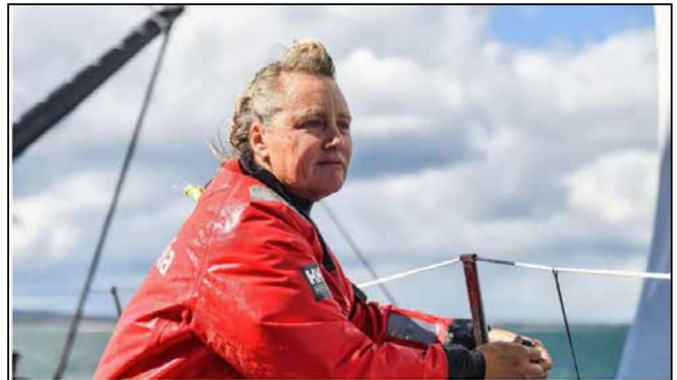
Once was not enough: For me, this is my version of a World Cup or the Olympics," said Hare before setting off on the Vendée Globe

"In May, the Court of Appeal dismissed Letby's leave to appeal on all grounds, rejecting her argument that expert prosecution evidence was flawed."