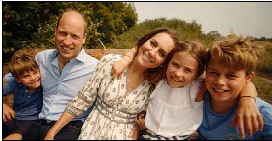
The image for the royal card was taken from a video released this earlier year

The Prince and Princess of Wales have revealed a Christmas card with a personal significance, using a picture taken from the video released when Catherine announced the end of her chemotherapy.