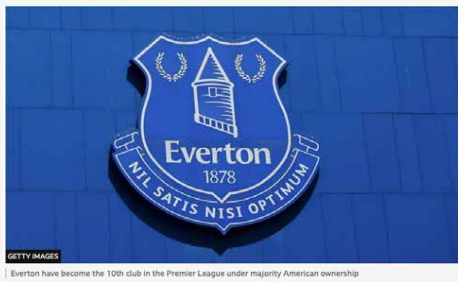
Everton have become the 10th club in the Premier League under majority American ownership