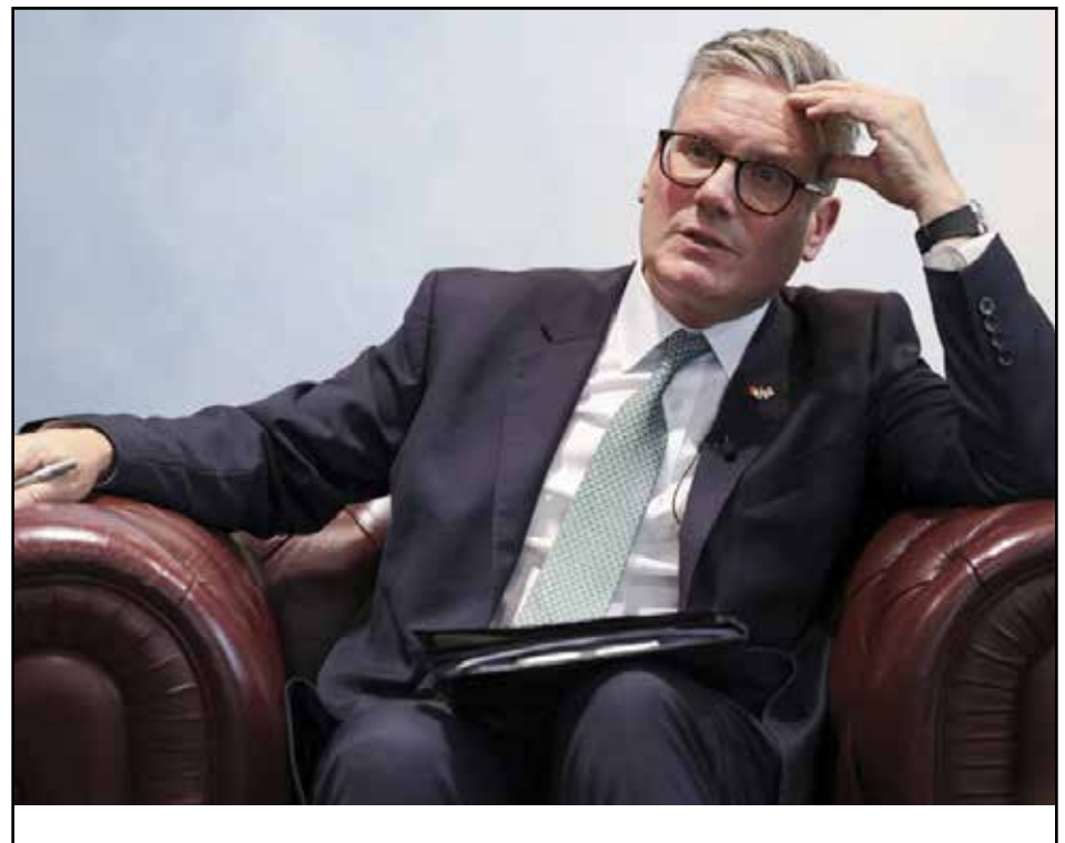
STARMER: his landslide victory in July seems a long time ago...

She told the Business Property Relief Summit: “Keir Starmer and Rachel Reeves spent months, years even, on a charm offensive to convince businesses they had nothing to fear from a Labour government.