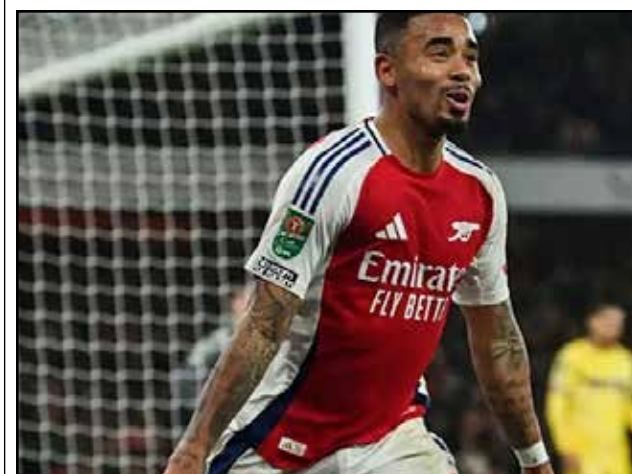
Saved by Jesus: Gabriel scored a hat-trick Wednesday

British-Iranian businessman Moshiri first bought a 49.9% stake in Everton in 2016, before increasing his holding to 94.1% in 2022.