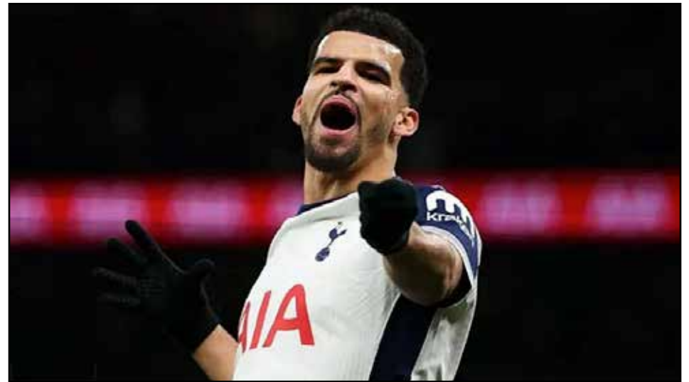
WINTER BLUNDERLAND: but Solanke scored a brace for Spurs on Thursday

The keeper was the villain of the piece again seven minutes later