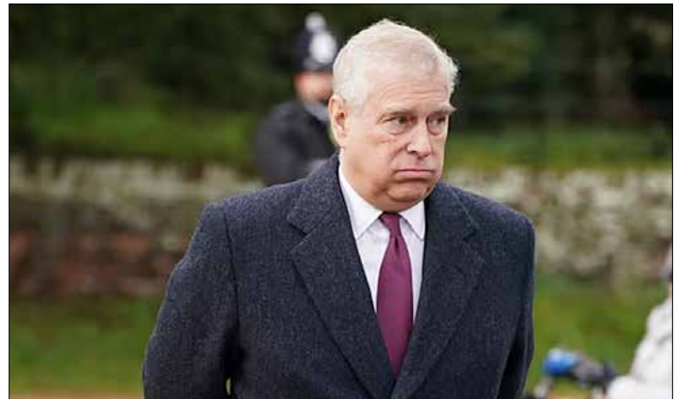
LONELY THIS CHRISTMAS: Andrew is on the outs again with the Royals

Stalemate over the Grade II-listed home is still a bone of contention between the brothers, after Charles's repeated