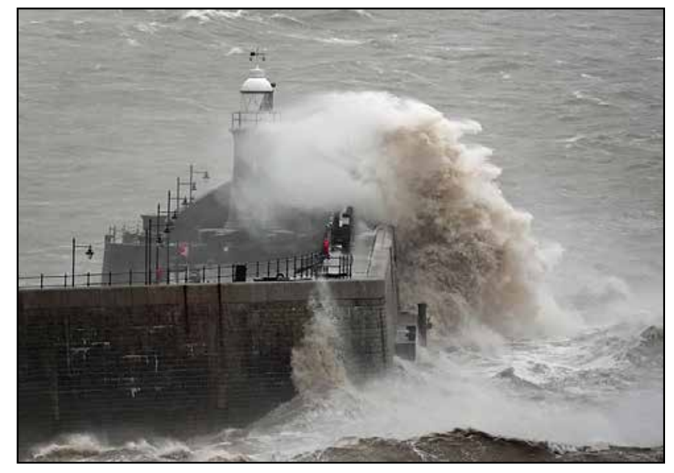
The Shipping Forecast: a 'cherished ritual' and one of the UK's 'national treasures'

The last at 12:48 am (0048 GMT) is credited as an aid to lull insomniacs to sleep or just provide a reassuring end to the day for oth-