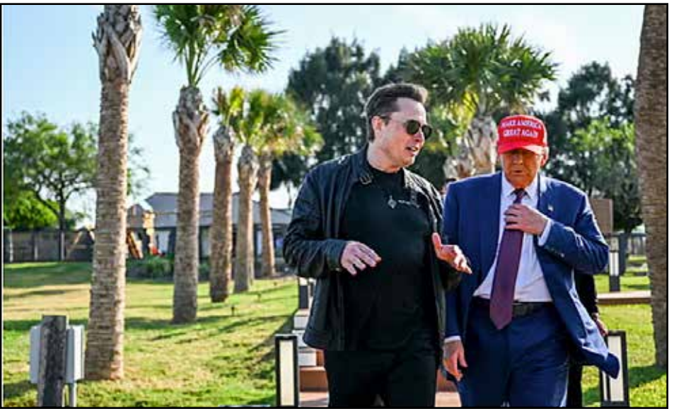
Elon Musk with president-elect Donald Trump. Many Labour MPs want the government to stop posting on X, while others warn this could cause a diplomatic incident

The damning commentary came after Ash Regan, the Holyrood leader of Scotland's nationalist Alba party, called on the billionaire