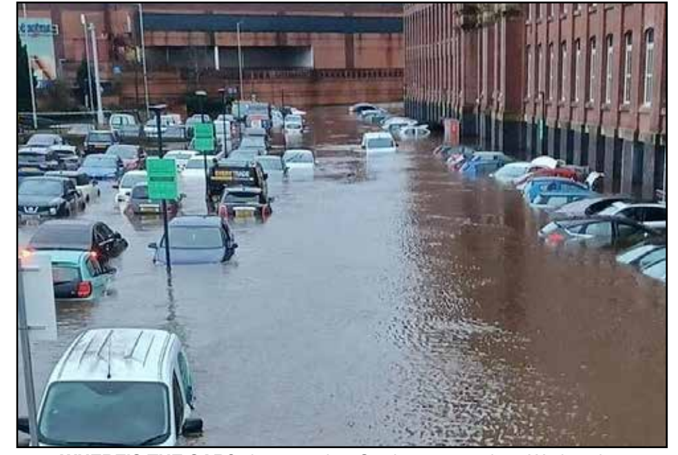
WHERE'S THE CAR?: the scene in a Stockport car park on Wednesday

on the roads as stretches across the region were shut. Cars were abandoned after becoming submerged. People in blocks of flats were trapped, with lower floors underwater.