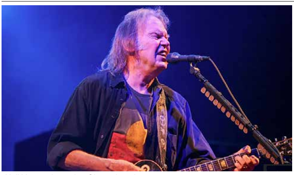
Neil Young pictured at Glastonbury in 2009