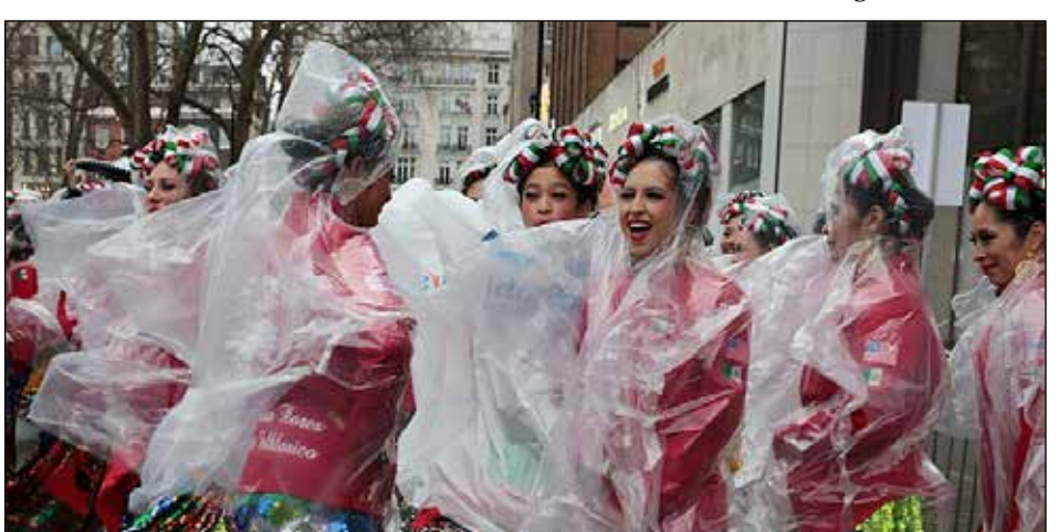
NEW YEAR IN LONDON: (above) heavy rain couldn't dampen the spirits of participants in a New Year Parade, while (below) darts fans dressed as Wizard of Oz characters on day 14 of the PDC World Darts Championship at Alexandra Palace

London's New Year's Day parade suffered a short delay due to the high winds in the capital.